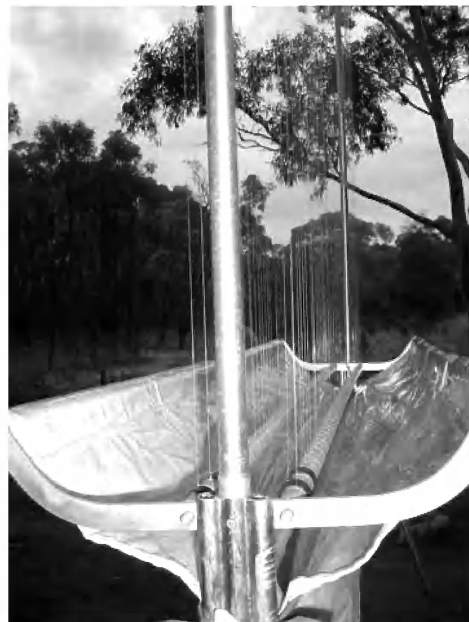
Harp Trap used for trapping bats

A very enjoyable afternoon and evening, thankyou Grant!