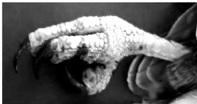
Scaly claws and sharp talons assist in prey capture

They are opportunistic predators of many kinds of prey and are the only raptor known to eat snakes. They swoop down after prey on the ground, their long unfeathered legs enabling them to hunt with great agility. A light wing loading allows easy hovering and easy lifting to escape the strikes of a venomous snake. However at Serendip, in November 2001, Gordon McCarthy saw a Brown Falcon that could not take off with a large Brown Snake in its talons. It dragged the snake away. Their relatively wide gape enables them to swallow snakes whole or gulp down small prey, lessening the risk of losing prey to pirates. They will hesitate in flight to reach down with one foot and snatch a mouse from the ground. A study found that when they hunt in pairs their success rate in taking prey is increased by 2.7 times. With small mammals the success rate may be as high as 57% (only the Nankeen Kestrel is more successful).