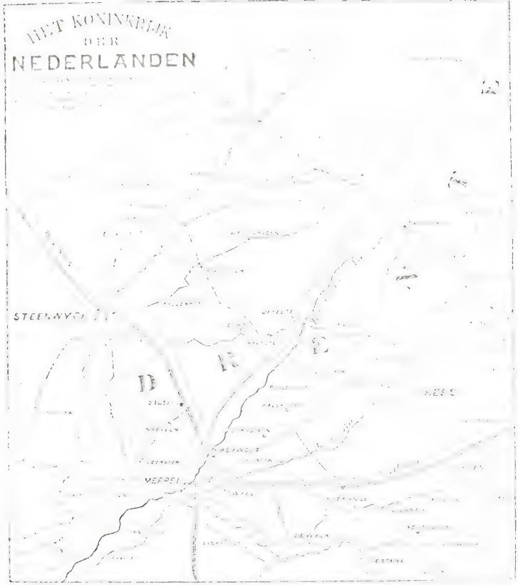
Map of a part of the Kingdom of the Netherlands showing the position of the main cities. By Dr. I. D. van der Waardenburg, Amsterdam, 1926