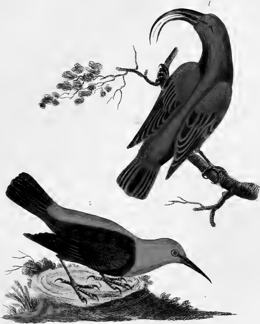
1. Hook-billed Honey-eater. 2. Cardinal Creeper.