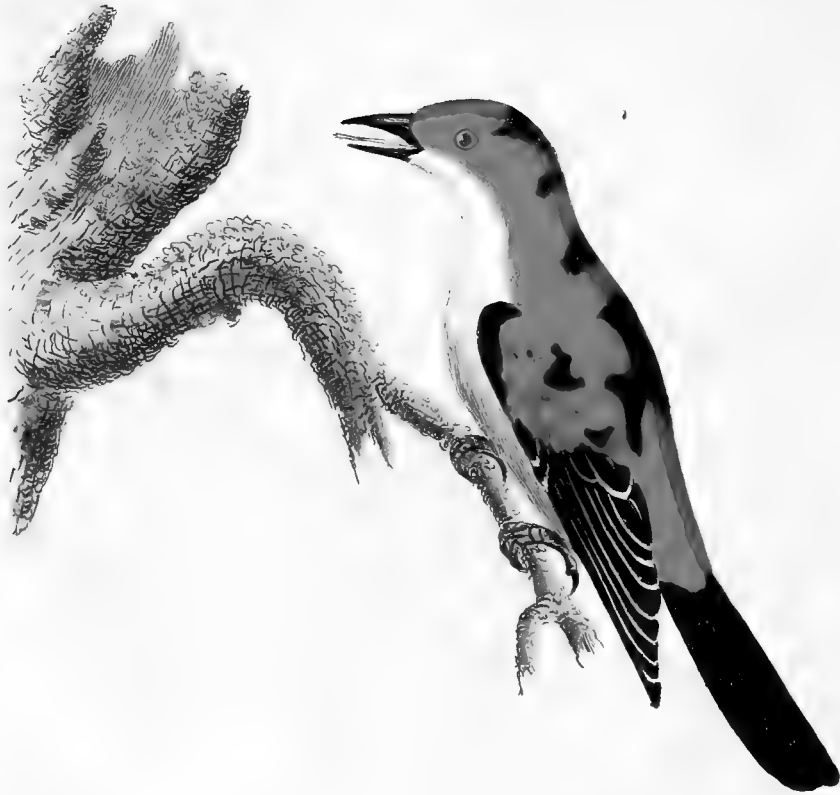
Sanguinaria - Honey-eater.