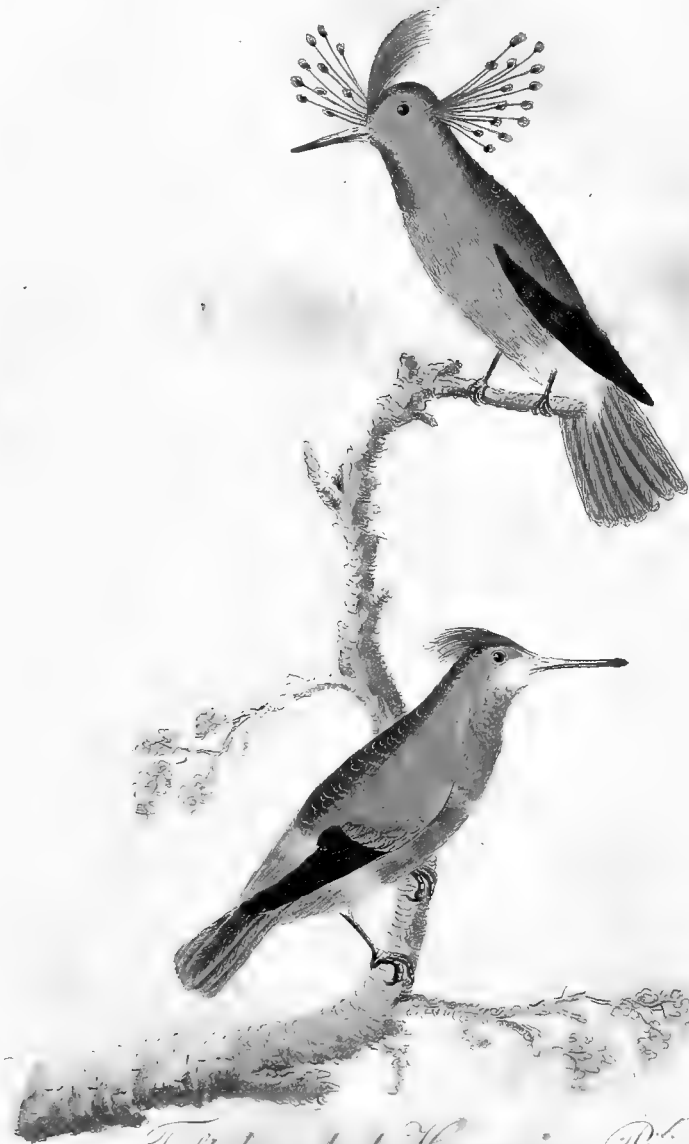
Tufted-necked Humming Birds.