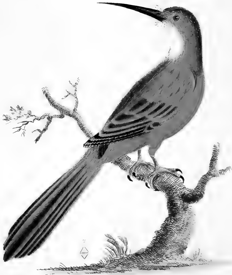
Long beak great sycamore