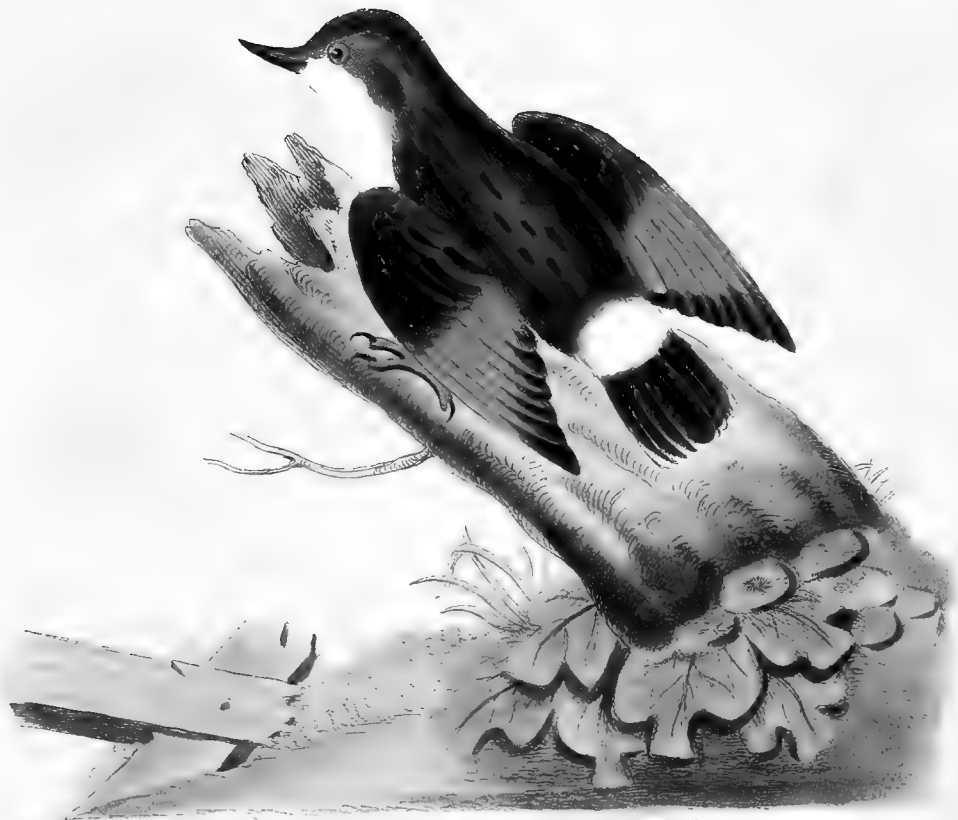
Orange-winged Nuthatch 2.