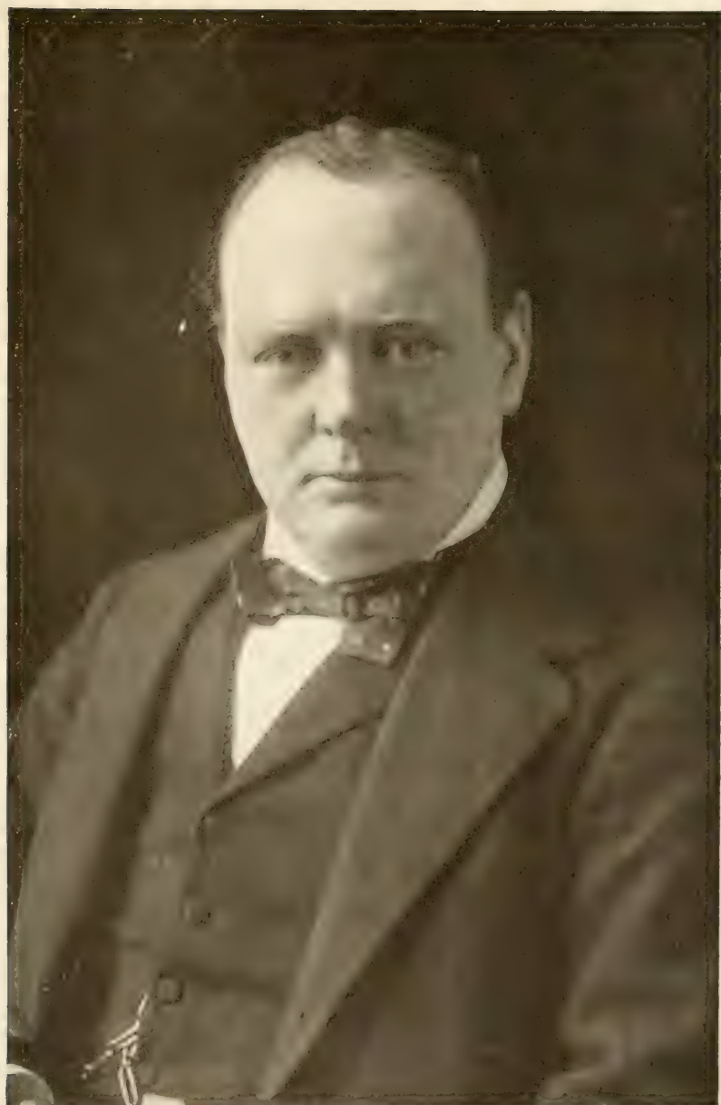
Rt. Hon. Winston Churchill