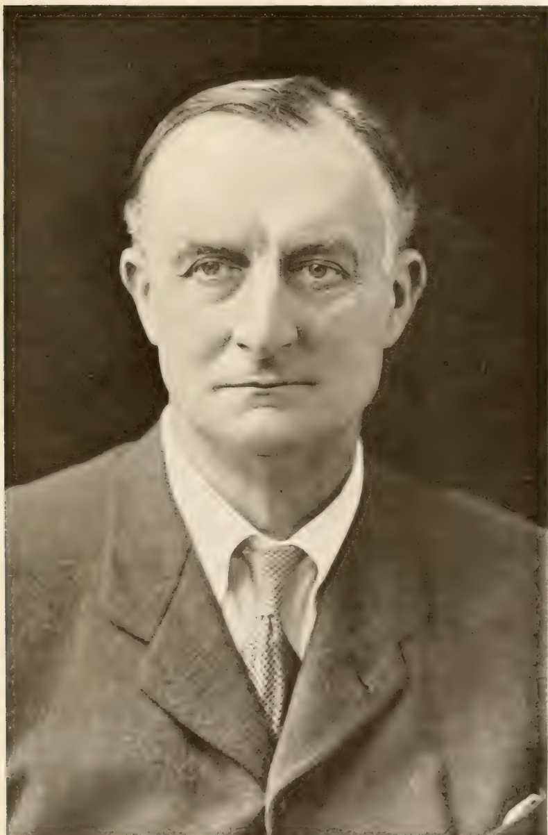
Viscount Grey of Fallodon