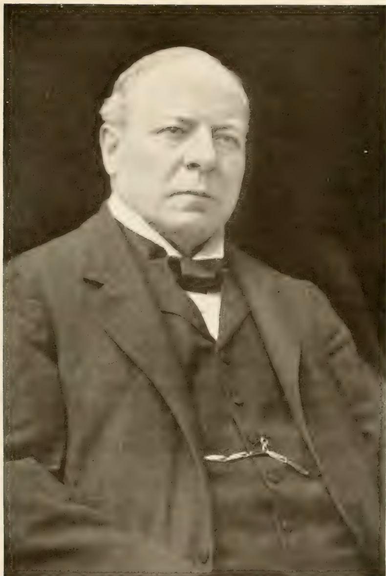
Viscount Haldane of Cloan