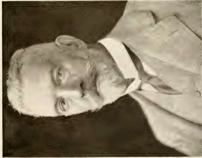
Dr. von Bethmann-Hollweg