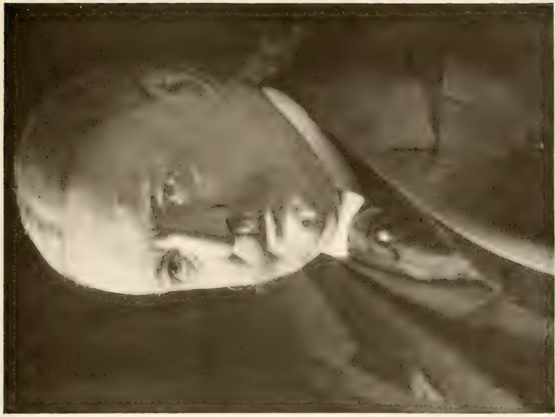
Prince von Bülow