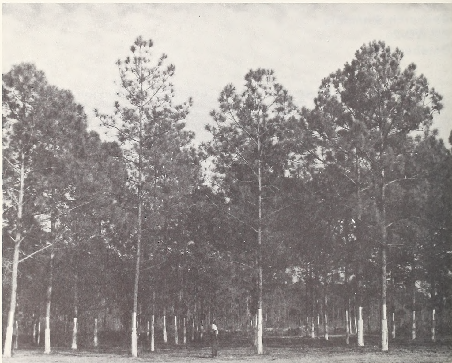
Rows of 25-year-old slash pine clones illustrate differences in branch diameter, branch angle, branch length, crown shape, stem straightness, and stem volume growth. The two large trees in the second row from the right are a fast-growing clone, but their oleoresin yield is less than one-third that of the clones selected for high yield in the three rows to the left.

Range-wide breeding programs are being conducted, and important gains in wood yields are indicated. First-generation seed orchards are producing seed for a large part of the planting program, and second-generation orchards are being established. Seed is produced in grafted orchards of carefully selected and progeny-tested clones. Major emphasis in breeding has been on improving growth rate, tree form, oleoresin yield, and resistance to fusiform rust, with wood quality an additional goal in certain projects.