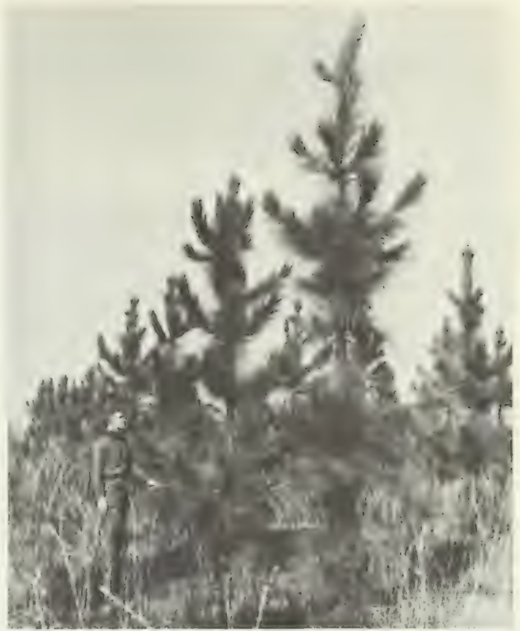
Figure 3.—Control-pollinated progeny of highly vigorous parents with good traits show uniformly superior height growth and stem and crown form. Breeding for high wood yield will not reduce tree quality if parent trees are selected for good stem and branch traits along with rapid growth.

The average gain in wood volume production per unit area from selection has been difficult to estimate because of the differences in methods of study. For example, in Florida plantings, where fusiform rust infection is not an important factor, several control-pollinated families of seed orchard clones averaged 40 percent greater dry weight production than the controls (Goddard and Cole 1966). In Georgia, where rust influences survival, some fast-growing families produced over 100 percent more wood per plot (Webb and Barber 1966). In a test with clonal stock, the stem volume of the smallest clone averaged 4.1