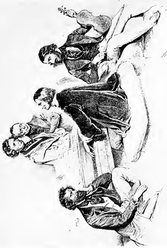
A MORNING WITH LISZT