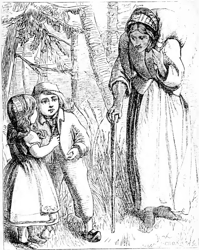
IB AND CHRISTINE MEET THE GIPSY.