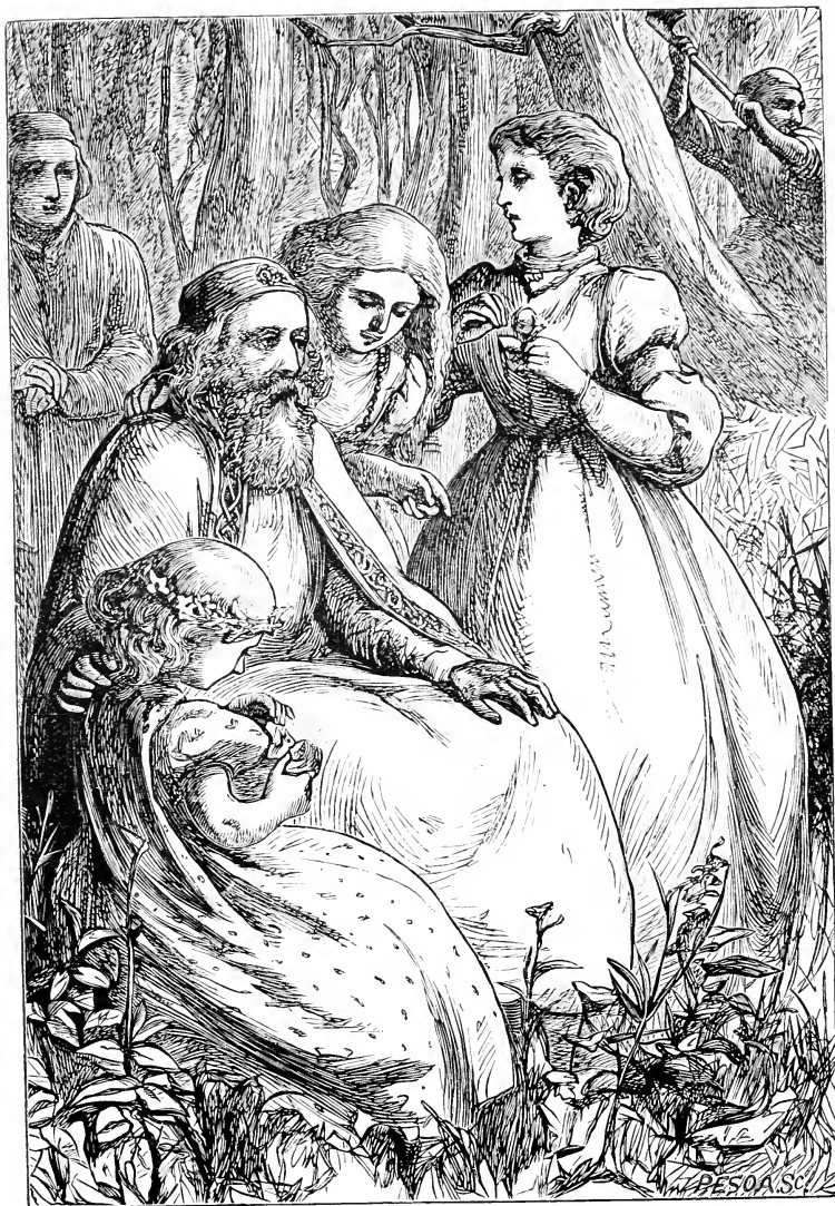
WALDEMAR DAA AND HIS DAUGHTERS.