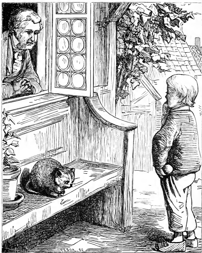
THE MAYOR AND THE WASHERWOMAN'S SON.