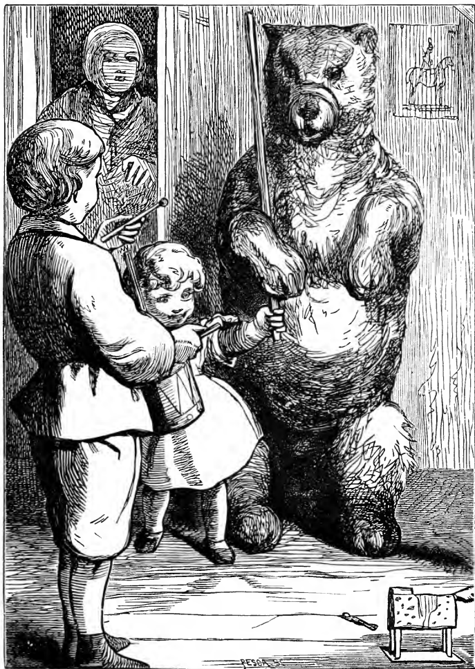
THE BEAR PLAYING AT SOLDIERS WITH THE CHILDREN.