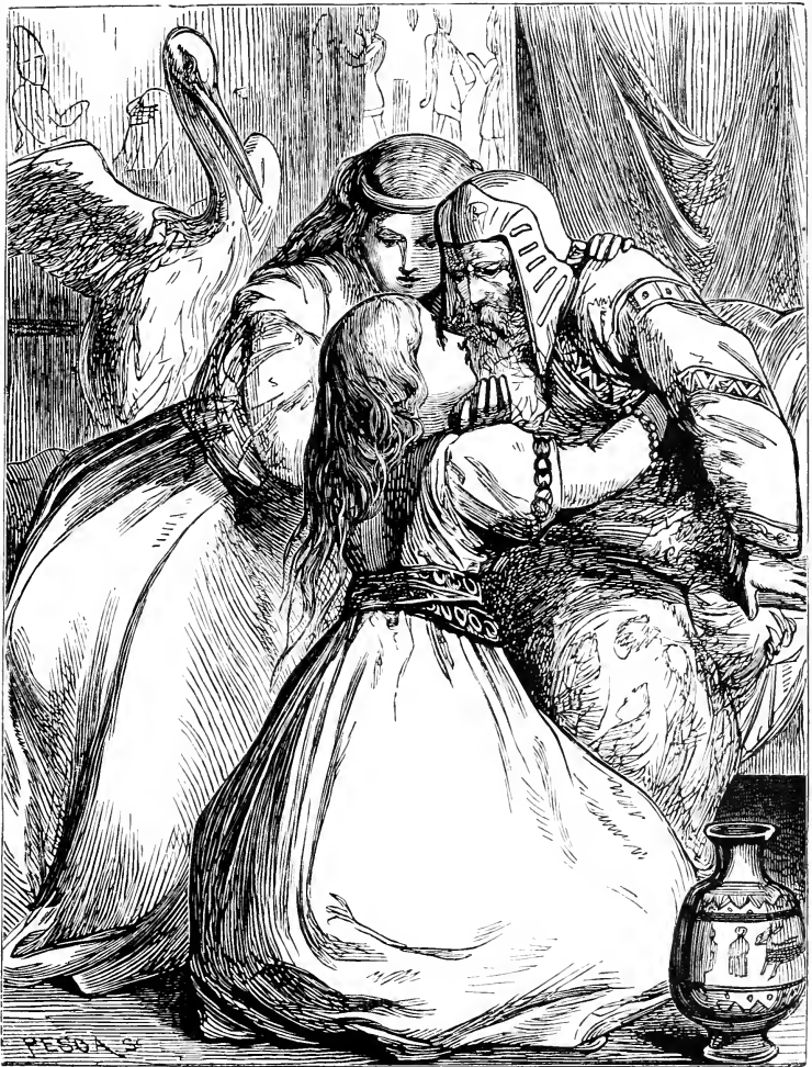
THE KING OF EGYPT'S RECOVERY.