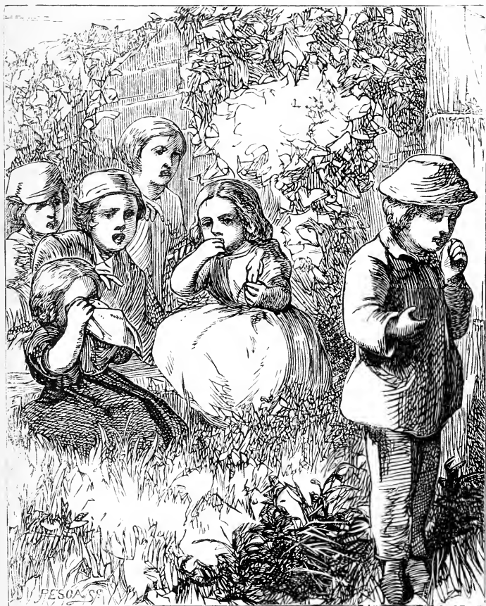
THE NAUGHTY BOY WHO ATE THE GINGERBREAD MAIDEN.