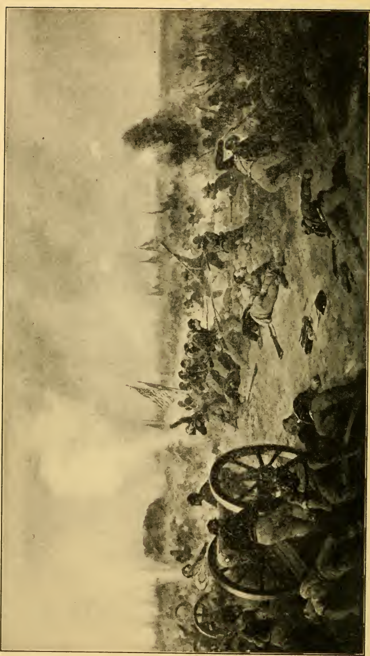
HIGH TIDE AT GETTYSBURG, JULY 3, 1863