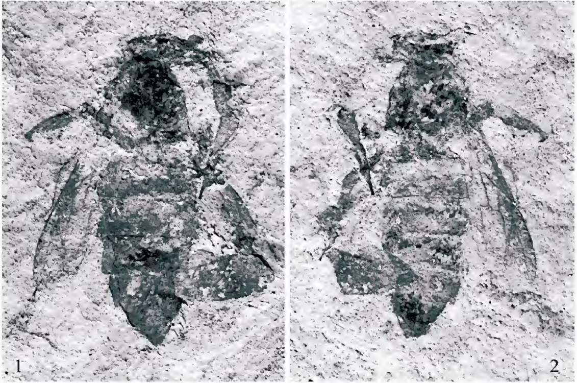
Figs. 1–2. Photomicrographs of Apis lithohermaea n.sp., holotype. 1. Part. 2. Counterpart.

rows, bristle rows, or pollen brush rows) ( A. dorsata , with its longer metabasitarsus, has 12–14 postauricular pectens; this species is intriguing in that it combines a relatively elongate metabasitarsus with the plesiomorphic condition of fewer pectens; 8–9 pectens is the usual condition for species of the mellifera and florea groups). Metasomal segments typical for bees of the dorsata group in observable characters (e.g., proportions of segments).