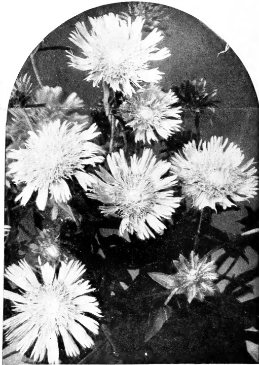
STOKESIA CYANEA (Corn flower Aster)

T HIS beautiful native hardy plant is not yet quite so well known as it should and deserves to be. No garden, large or small, should be without it. As a single specimen or group in the hardy border it makes for itself a place that cannot be filled by any other hardy plant, while for beds or masses of any size it ranks with the Phlox, Pæony and Iris. It is of the easiest culture, blooming the first year from seed, and succeeding in any open sunny position. The plants grow from 18 to 24 inches high and begin flowering in July, continuing without interruption till late in October to produce their handsome lavender blue centauria-like blossoms which are highly valuable for cutting, supplying a shade of color not overly plentiful at any season of the year.