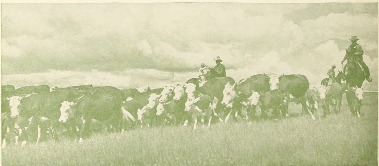
Each acre must produce a good yield if the rancher is to prosper.

By careful consideration of their demands, a rancher can maintain range plants and at the same time harvest a good crop of livestock products. To