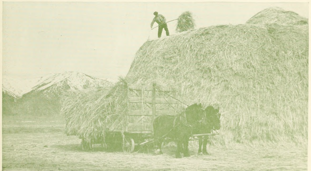
Should the harvest fail for a single season, famine would depopulate the earth.

In much of the world grass is grown as a cultivated crop, seeded by the labor of man. In the range States of the West, grass was growing luxuriantly when the pioneer first brought in his herds of livestock. Nature had provided grass as the plant best adapted to grow on most of the vast range area. A great many acres of the rangelands are not adapted to plowing and sowing of grass or any other crops, so the native grasses seeded by Nature