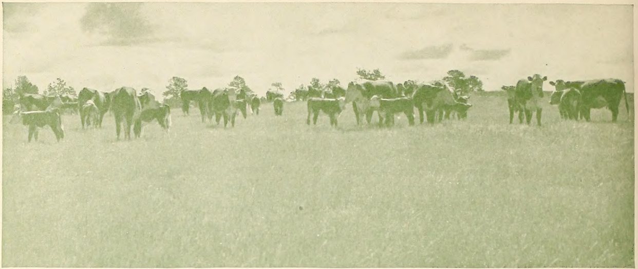
In the United States over half the land, nearly a billion acres, produces grass for livestock.

in tons, he is still directly concerned with the quantity of grass because he well knows this directly determines the pounds of meat he can produce. It is even more important that the rancher study his crop carefully because he does not have the opportunity to plant the succeeding crop. He must work with Nature for the seeding of most productive plants and those that are best adapted to the area.