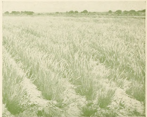
In much of the world, grass is seeded as a cultivated crop.

The rancher thinks of himself principally as a producer of livestock. The average rancher has well-bred herds and some fine animals in which he takes a great deal of pride. He is also interested in and concerned with his rangeland and the plants that grow on it. The rancher does not need to be