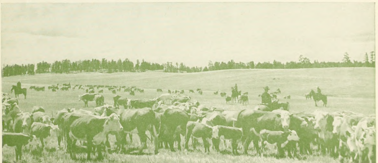
The rancher takes pride in his well-bred herds, and equal pride in the grass that produced them.