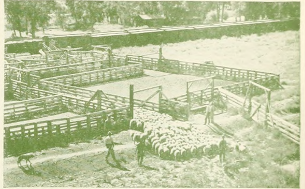
Grass goes to market on the hoof.