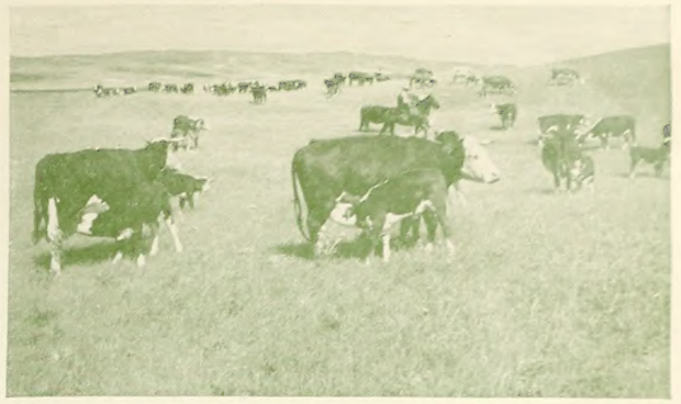
The rancher measures his grass crop in pounds of beef.

The rancher can apply this knowledge of forage-plant development and adjust grazing so that the plants will produce a maximum forage crop. He must harvest his crop of forage grass at such a time and use it at such a rate that the plants will stay vigorous and productive and will reseed themselves. The rancher who studies these things and applies his knowledge is the rancher who will stay in business and continue to prosper.