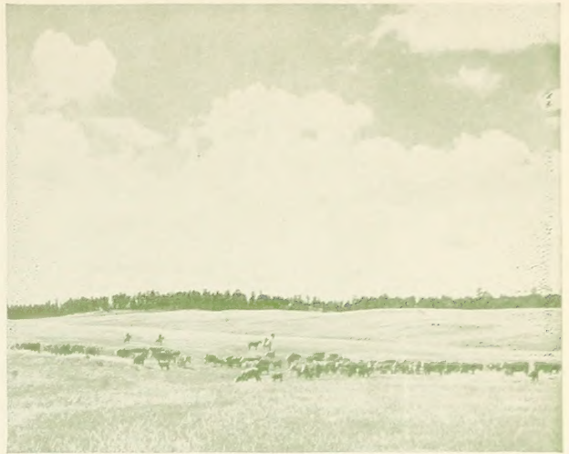
Grass is living, and like animals, must have food, air, water, and light.

The farmer studies the needs of his crop carefully. He must till the soil, seed the crop, and adapt his harvesting methods to make the most efficient use of his equipment. He measures his crop in bushels or tons of crop harvested. The rancher measures his crop in pounds of beef, lamb, and wool, because this is the measure of his market product. While he has not thought much about the grass production