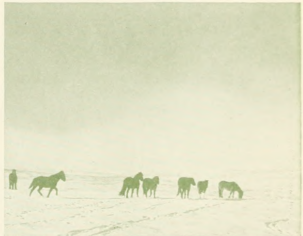
Grass endures all the fluctuations of weather.