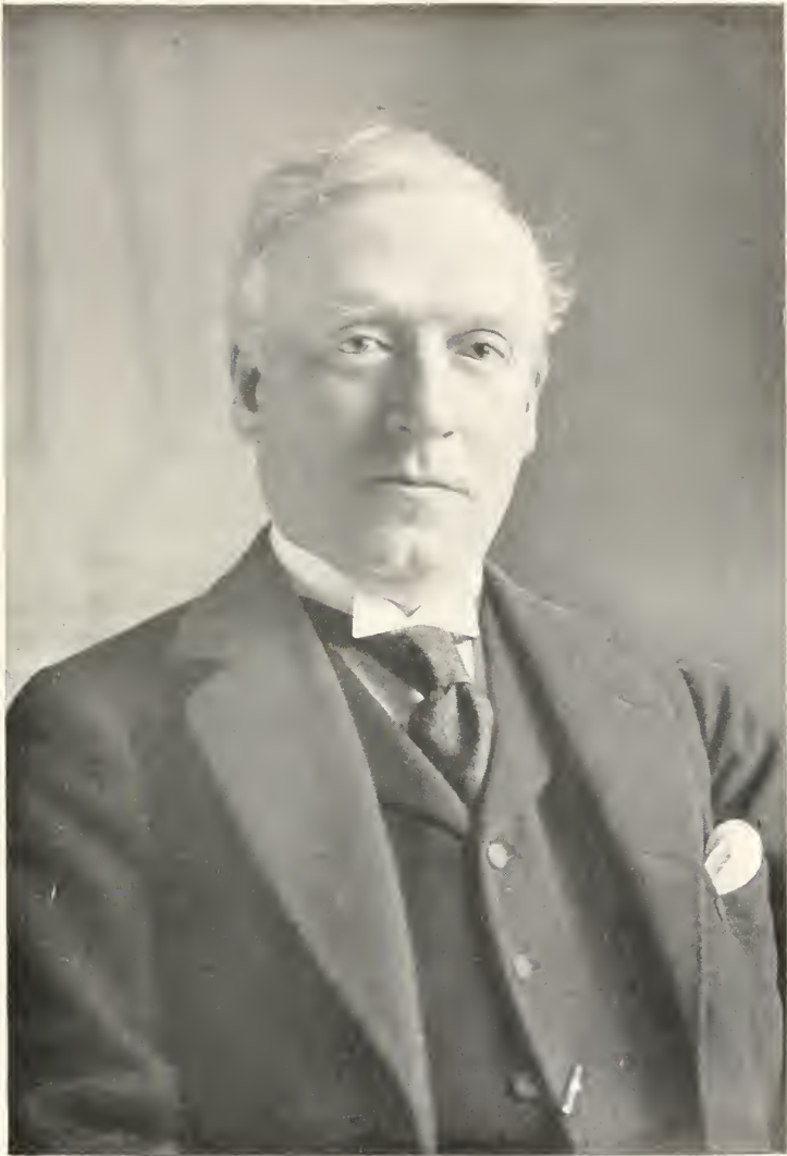
RT. HON. H. H. ASQUITH (PRIME MINISTER)