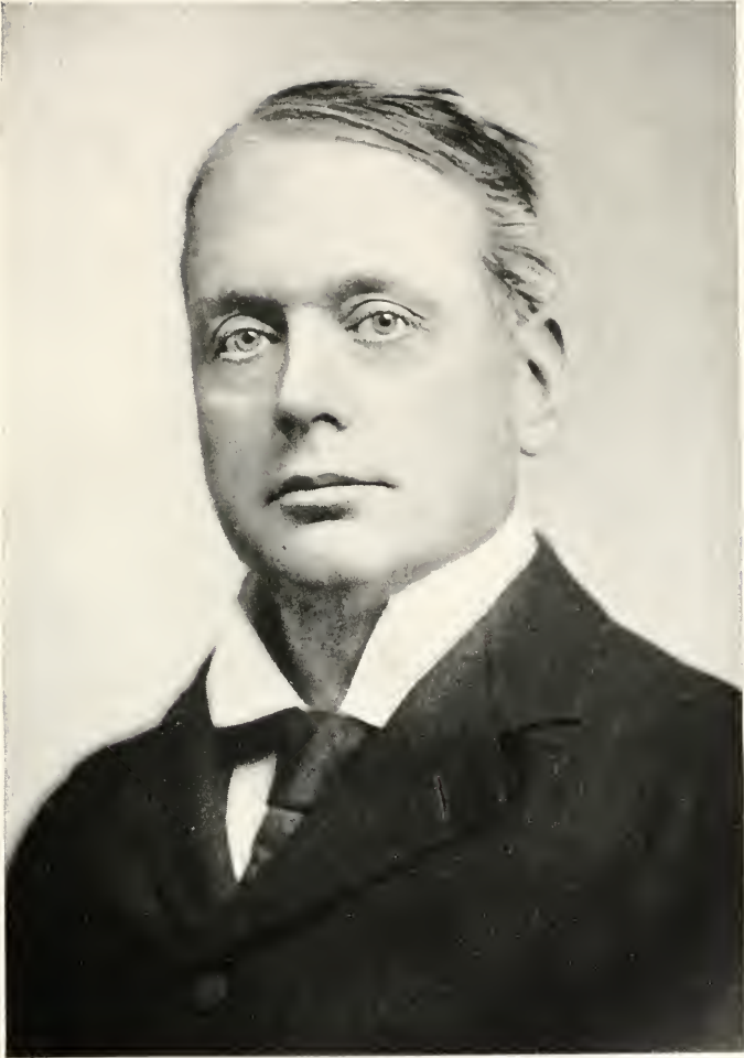
EARL OF ROSEBERY