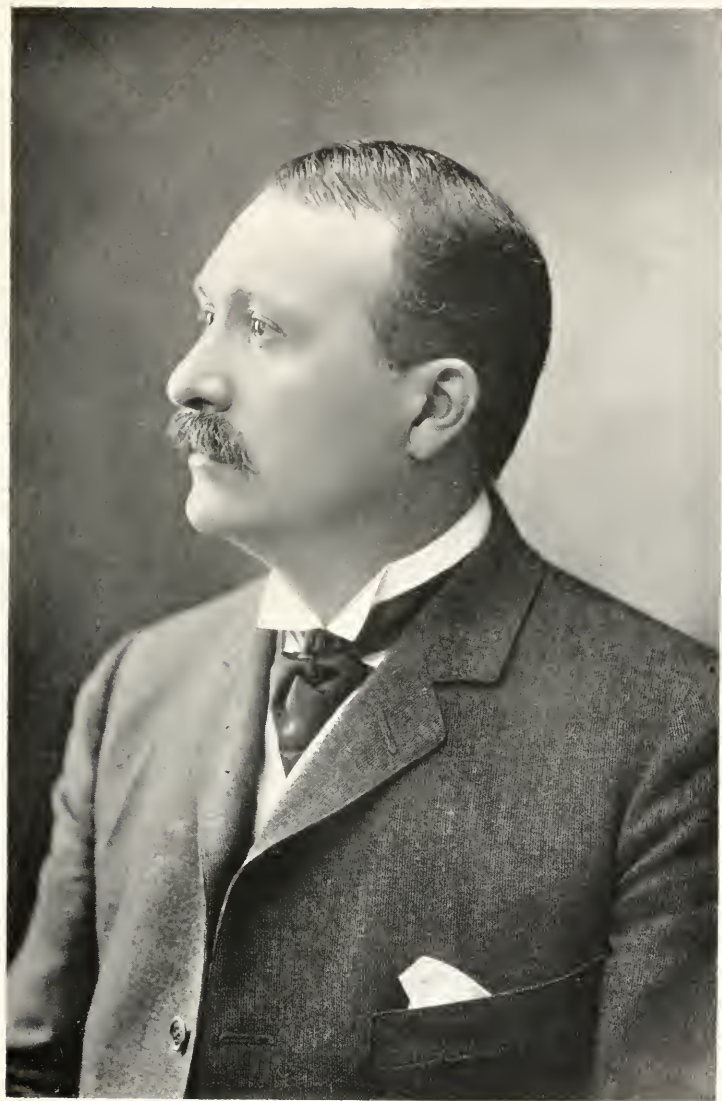
M. RENÉ VIVIANI (FRENCH MINISTER FOR FOREIGN AFFAIRS)