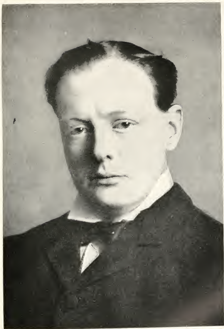
RT. HON. WINSTON S. CHURCHILL (FIRST LORD OF THE ADMIRALTY)