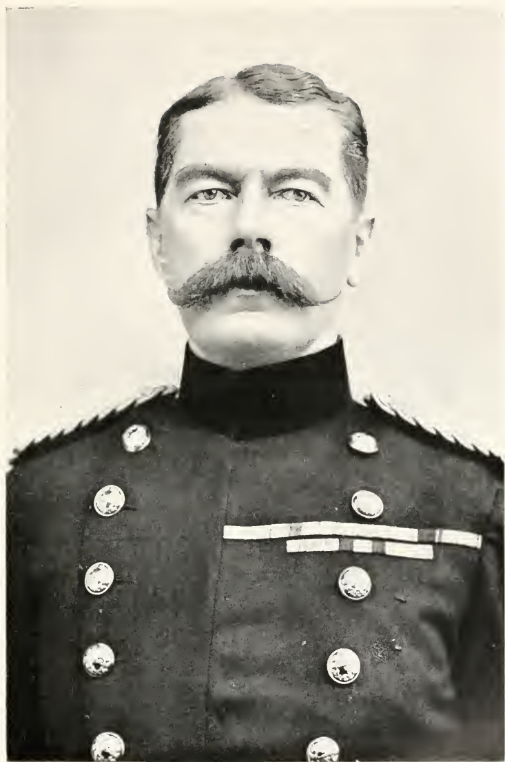
EARL KITCHENER (WAR MINISTER)