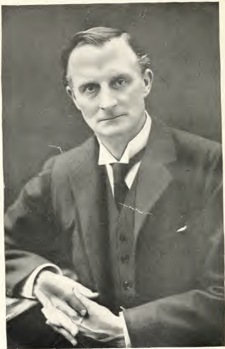
SIR EDWARD GREY (MINISTER FOR FOREIGN AFFAIRS)