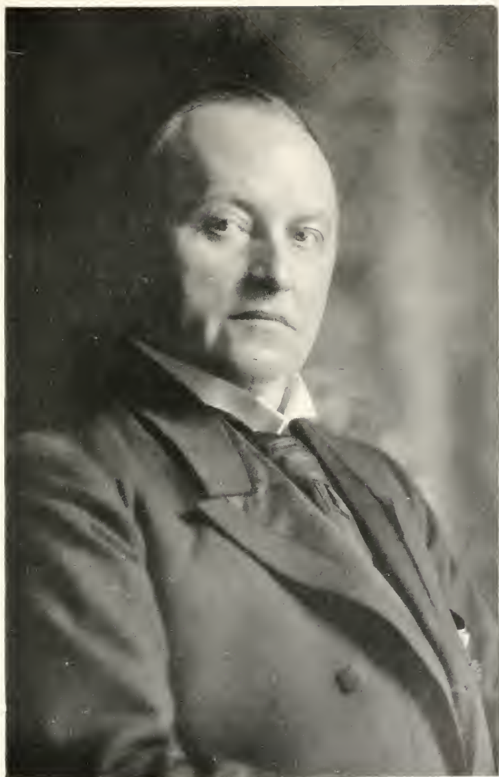
EARL CURZON OF KEDLESTON