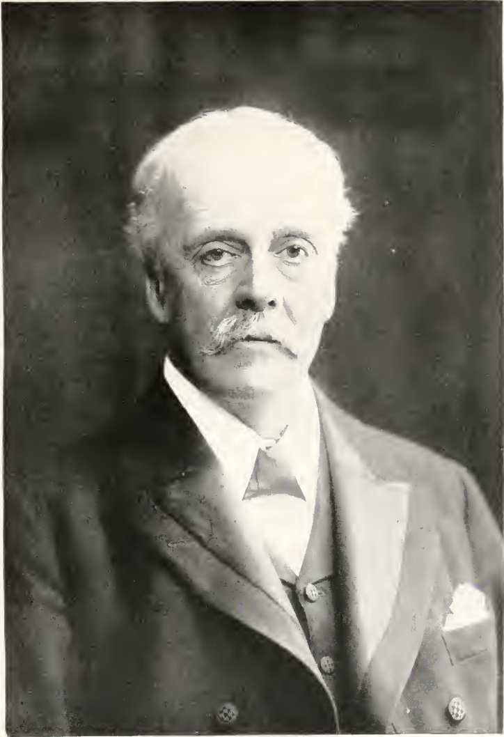
RT. HON. A. J. BALFOUR (LATE LEADER OF THE CONSERVATIVE PARTY)