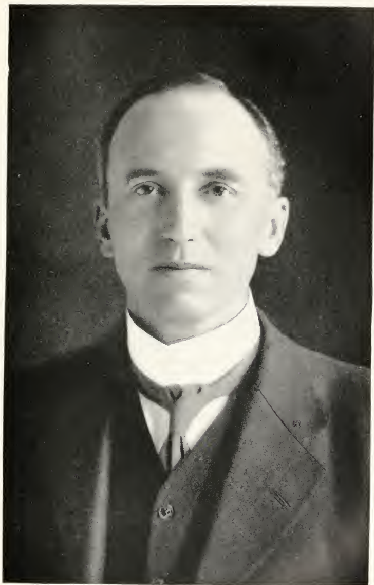
RT. HON. SIR JOHN SIMON (ATTORNEY-GENERAL)