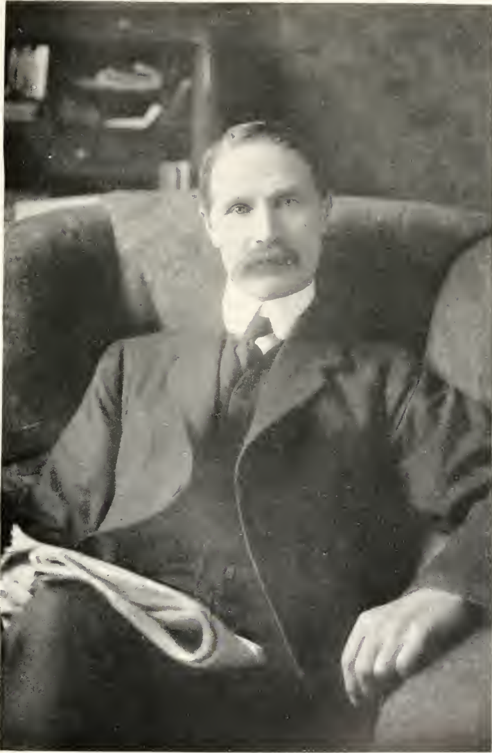
RT. HON. A. BONAR LAW (LEADER OF THE OPPOSITION)