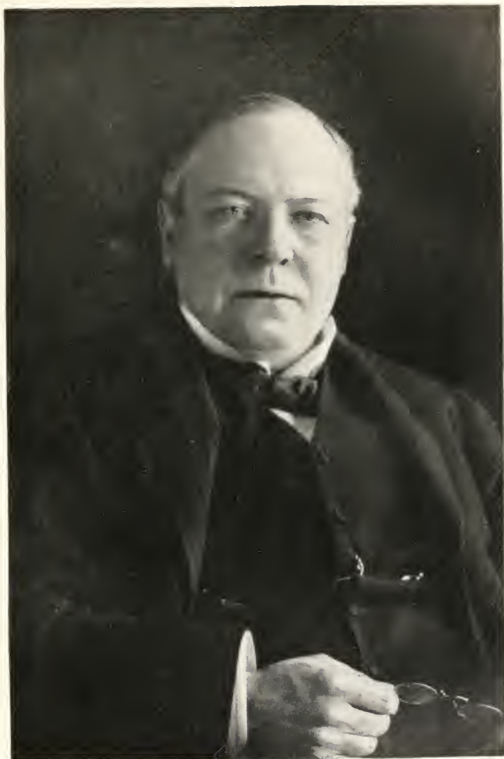
VISCOUNT HALDANE (LORD CHANCELLOR)