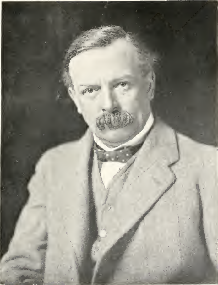
RT. HON. D. LLOYD GEORGE (CHANCELLOR OF THE EXCHEQUER)