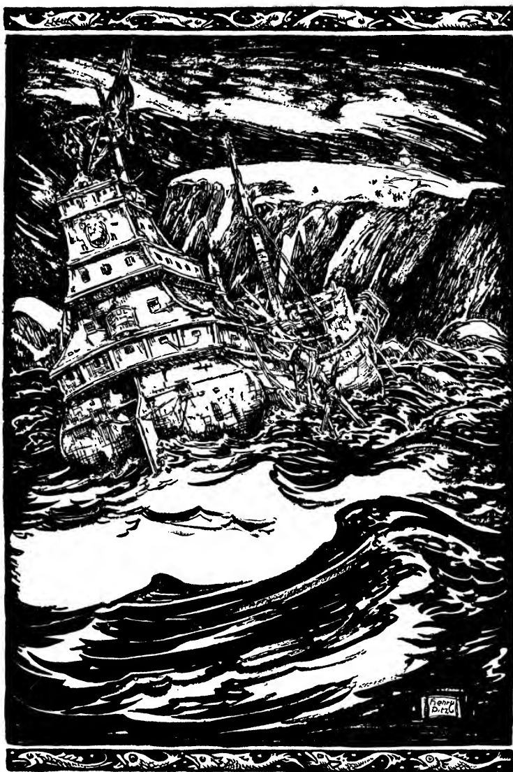
The Spaniard drifted straight upon our shore