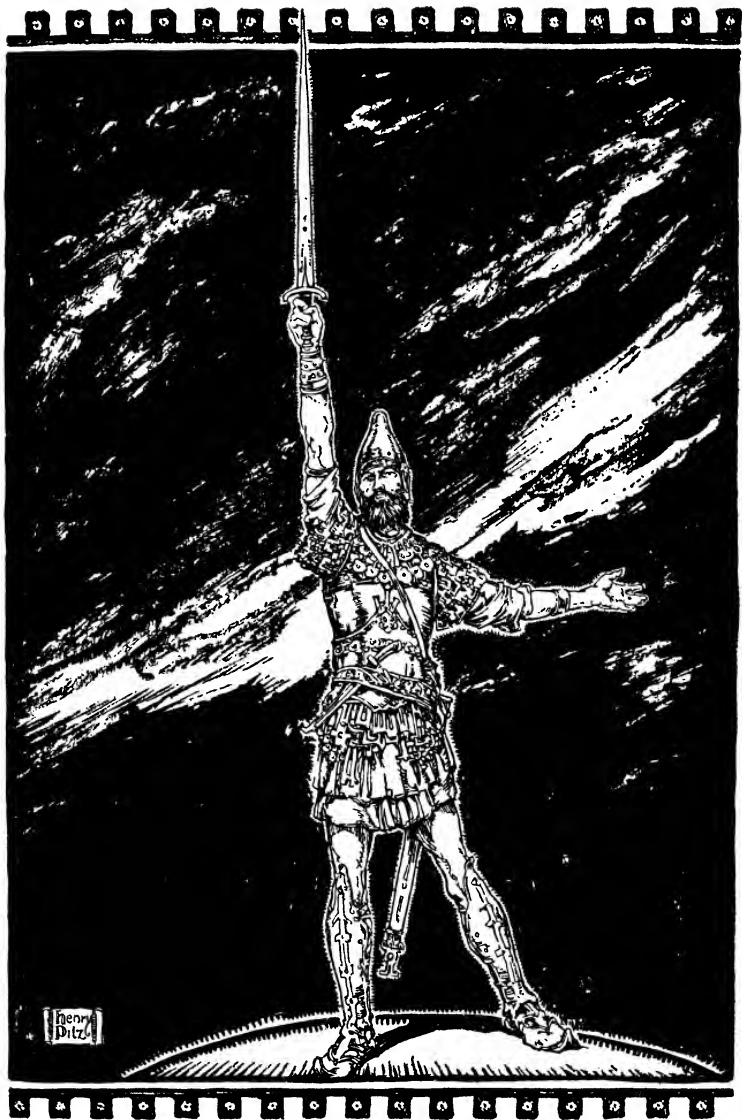
A giant officer in brazen mail, upholding stiffly a lean, straight sword of grey steel