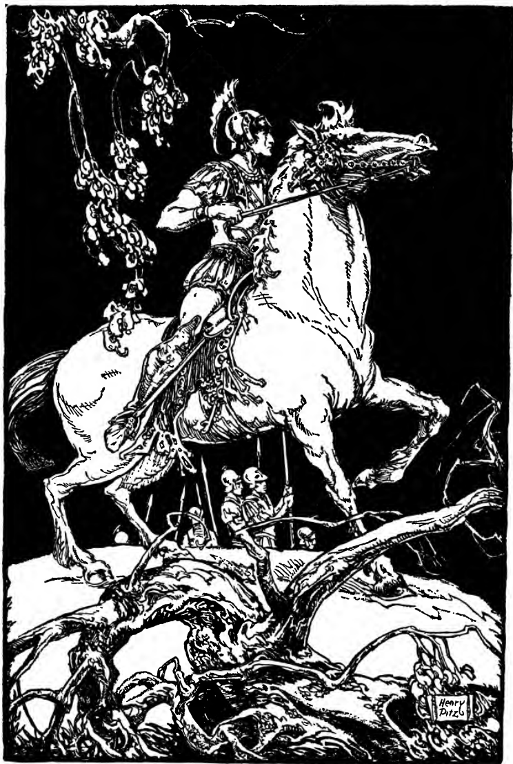
He was sitting his horse close by where we were grouped above the river crossing