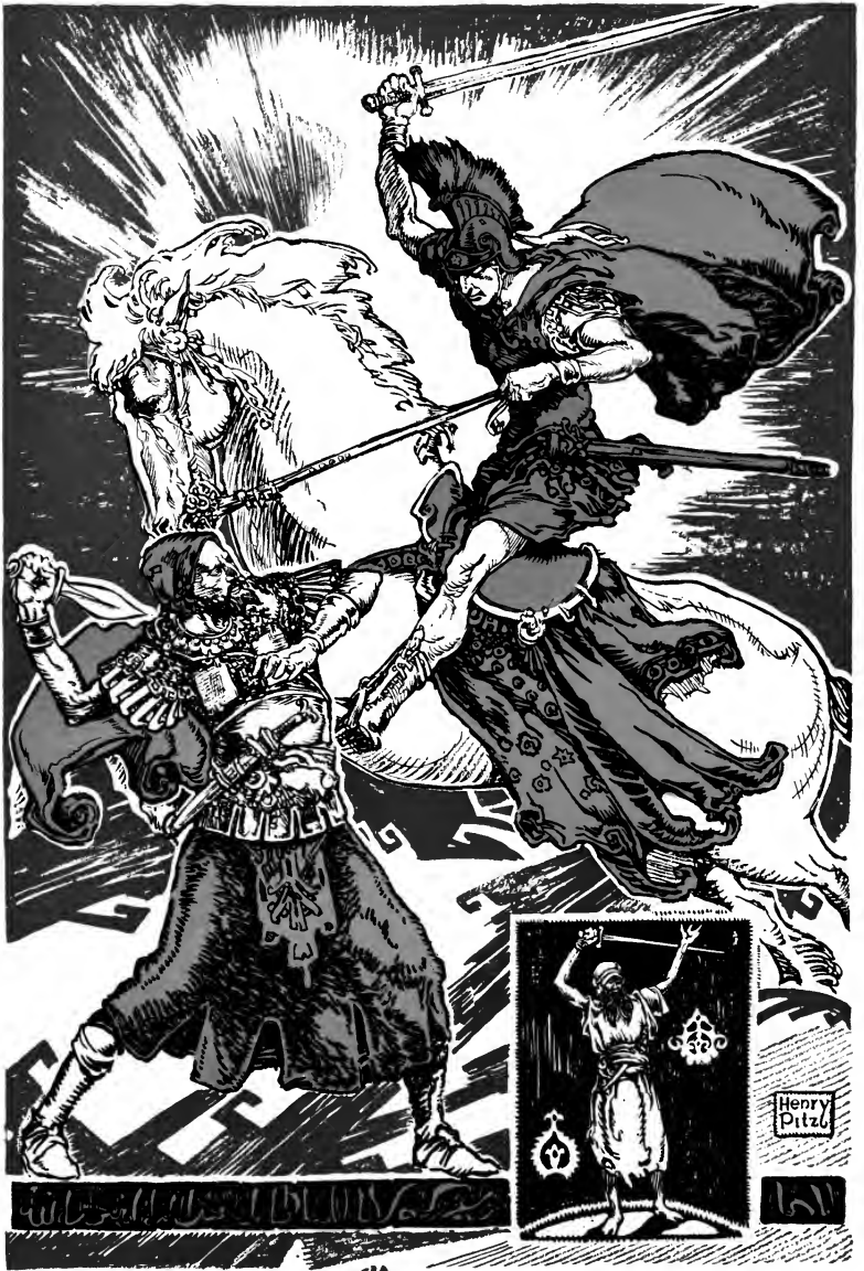
The Arab scrambled to his feet and struck again at the Roman