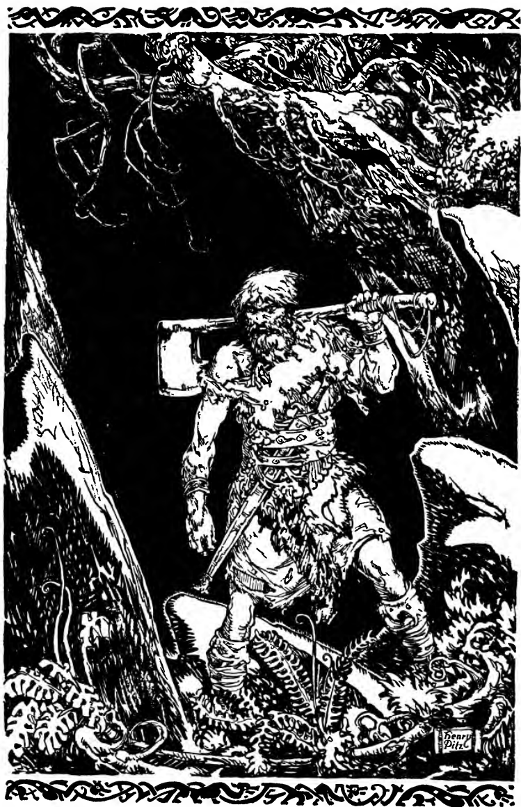
Aslak appeared, a wild figure, dressed in sheepskins, hairy as Herjolf's self