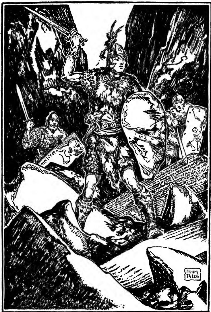
Hamilcar made the grey sword hiss in air, and strode out in front of the Carthaginians