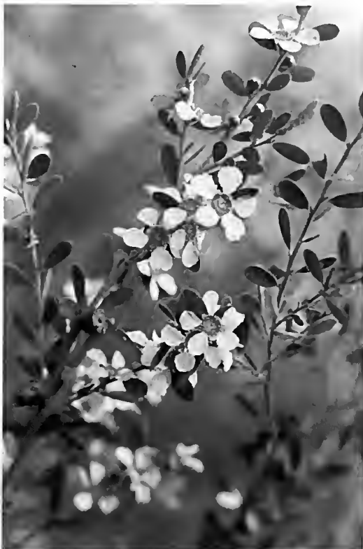
Leptospermum laevigatum : laevigatum —from the Latin, laevigatus , meaning smooth, slippery and referring to the shiny smoothness of the leaves