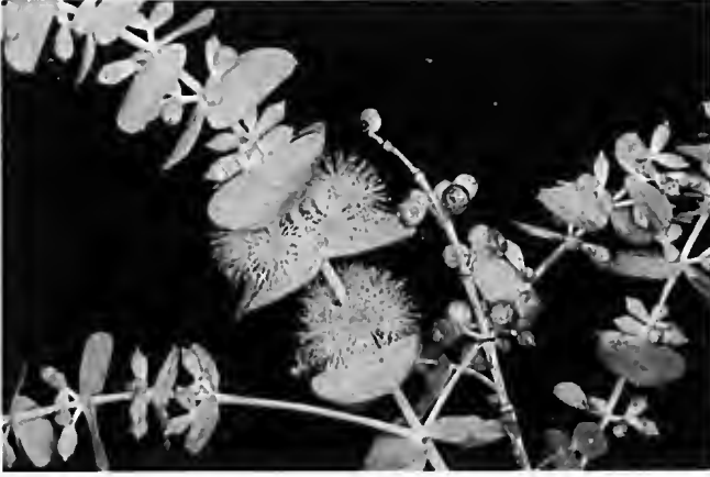
Eucalyptus pulverulenta : Eucalyptus —from Greek words, eu, good or well, and kalypto, meaning one cover, alluding to the calyx which forms a close lid over the flower bud; pulverulenta —refers to the powdery covering of the leaves

Recreation is more important now than it has ever been before because we have more time for leisure. A garden should not be a source of worry where one is forced to mow the lawns or do the weeding. If one doesn't relax in the garden then a switch to bowls, football or fishing is recommended.