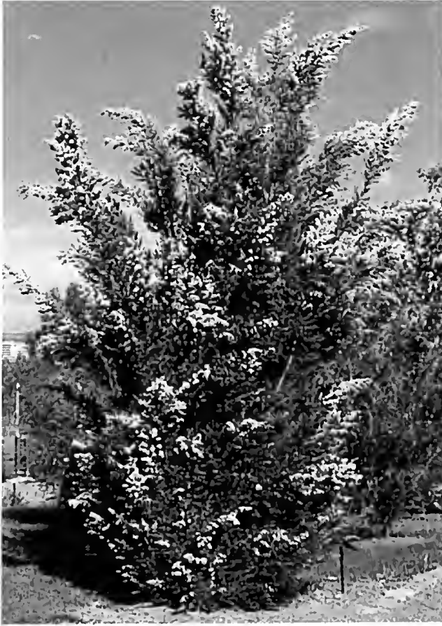
Leptospermum lanigerum : Leptospermum —from the Greek, meaning slender seed; lanigerum , from the Latin, laniger, meaning fleecy or woolly and referring to the hairiness of the plant.