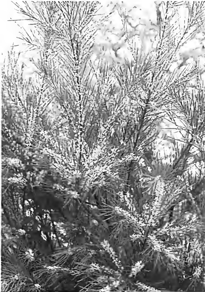
Hakea propinqua : Hakea —after Baron Von Hake, patron of botany in the 18th century; propinqua —feminine form of propinquus, meaning near or related (the reason for the use of this epithet is obscure)

There appear to be two distinct forms of Hakea propinqua growing at Canberra Botanic Gardens. The first had its origin in the Wentworth Falls area of the Blue Mountains. Specimens of this form are low growing, being only 1.5–2 m high, rounded in shape and rather stiff. The older leaves lower on the stem are thickened to 2–3 mm in diameter and are 4–5 cm in length. The