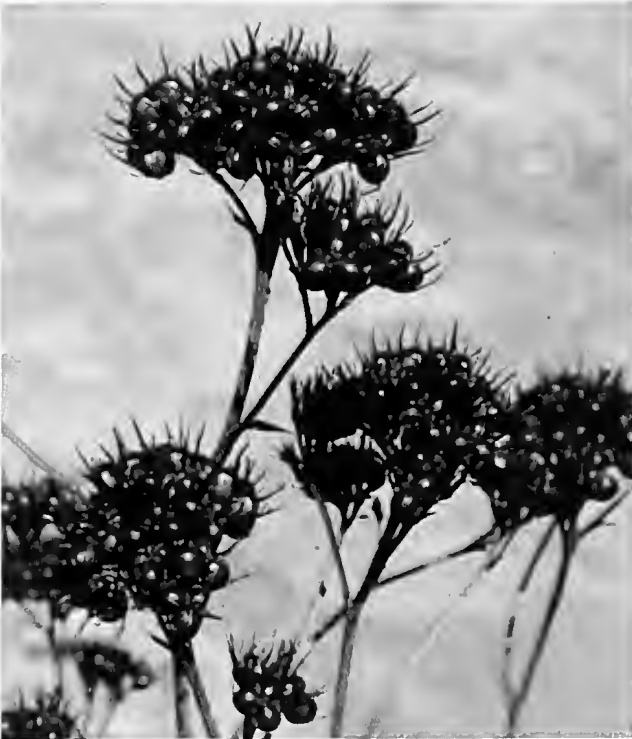
Haemodorum planifolium : Haemodorum —from the Greek, haima, meaning blood, and dōron, a gift (probably referring to the roots serving as food for the Aborigines); planifolium —having flat leaves (many Haemodorum sp. have terete leaves)