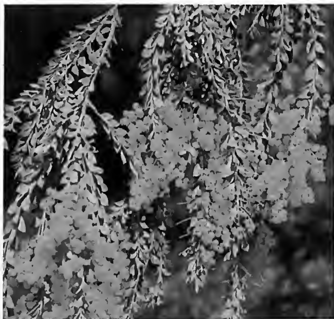
Acacia vestita : Acacia —thought to be from a Greek word meaning to sharpen in reference to the first species discovered; another opinion refers to the Egyptian Thorn (akakia), a species of Acacia which yields gum arabic; vestita —a feminine form of vestitus , a Latin adjective meaning clothed