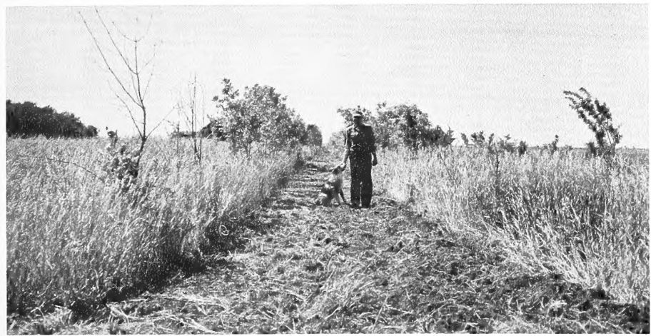
F-500501 FIGURE 1. — Sod-bound shelterbelt partially renovated by sod removal (moderate treatment) using a 4-foot-wide rototiller. Grass is Bromus inermis , height 3 to 4 feet. Souris, No. Dak.