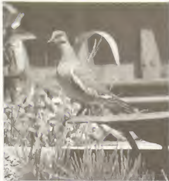
White-winged Dove first observed in Pt. Richmond on June 26