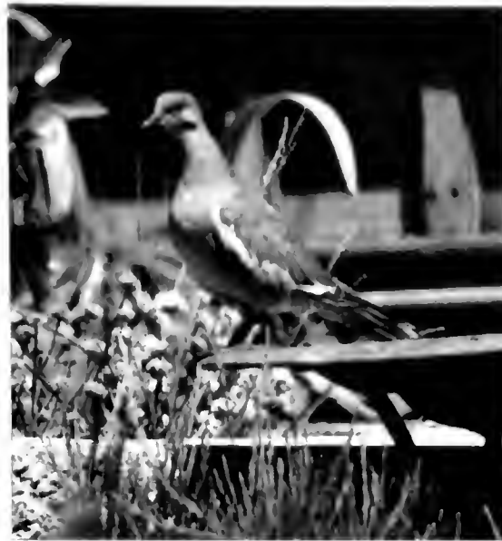
White-winged Dove first observed in Pt. Richmond on June 26