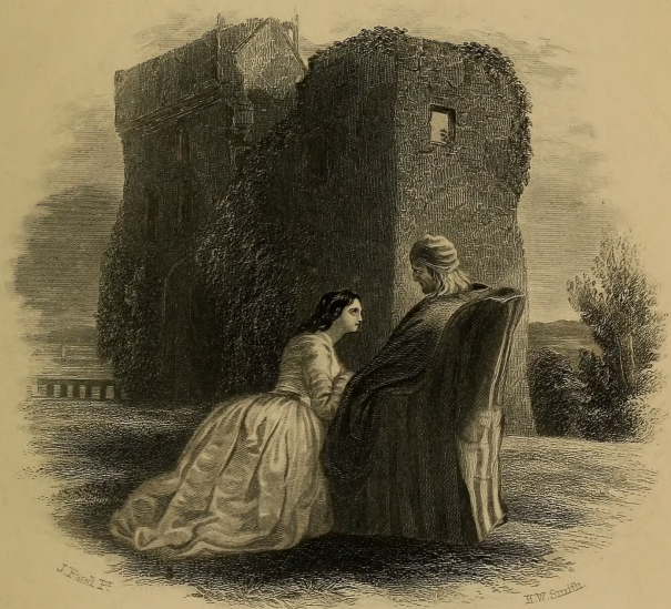
Lucy and her Father at Ellangowan.