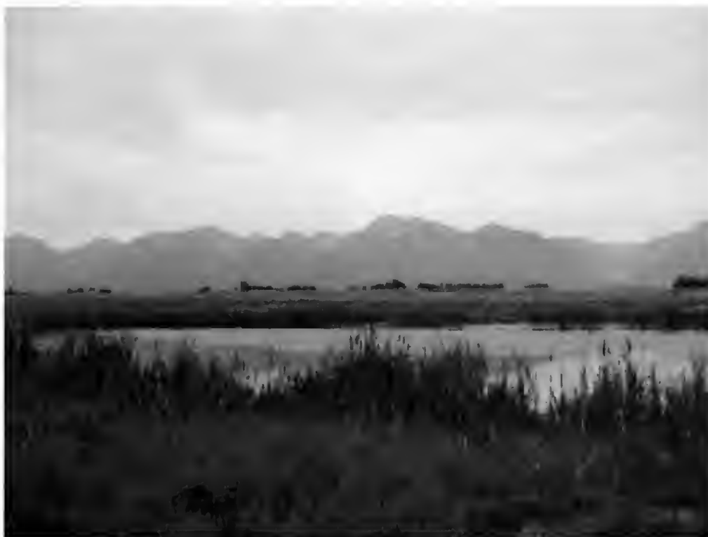
Davis Property Wetland

Davis addition (phase II) 23 acres – April 2007 - $115,150 of Habitat Montana funds.