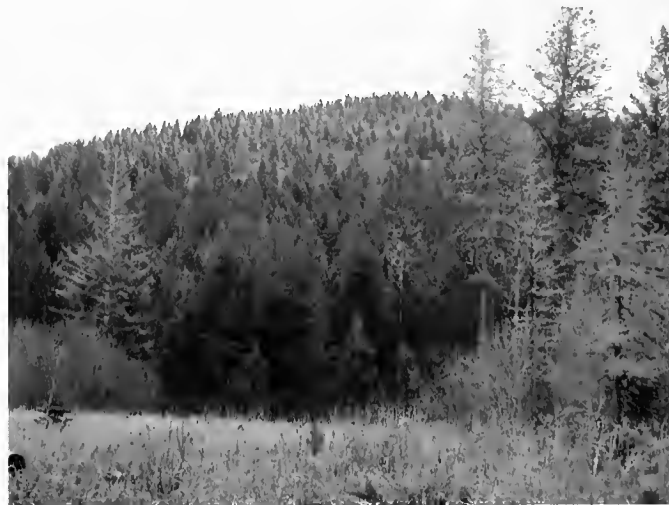
JACOBSEN - VALITON