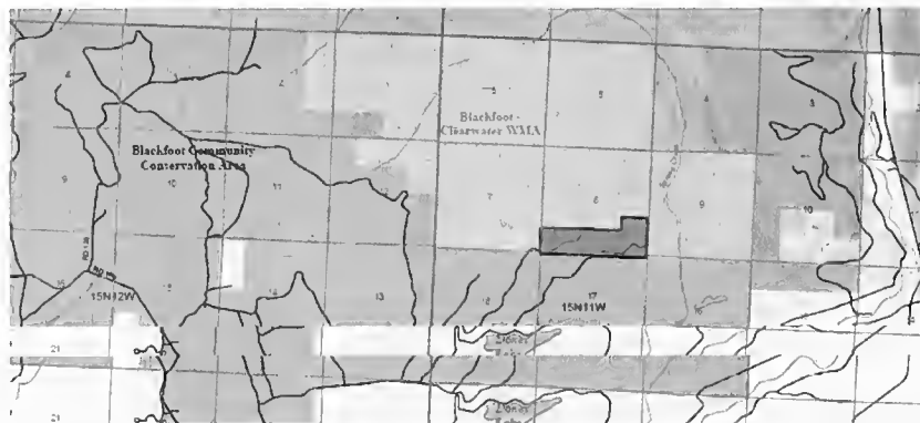
The Red L-shape is the Jacobsen-Valiton Addition

JACOBSEN-VALITON ADDITION: 180 Acres – March 2007 $270,000. of Habitat Montana funds