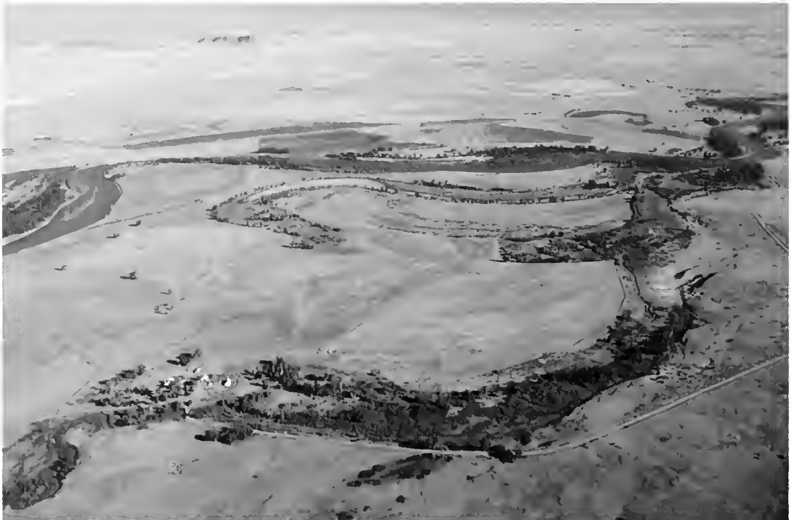
Bird Creek Easement is in foreground, south of the Missouri River

2,292 acres for $550,000 of Habitat Montana dollars plus the following - This easement is being established, managed and funded in conjunction with two USDA / Natural Resources Conservation Service (NRCS) easements. Those are: The Farm and Ranch Lands Protection Program (FRPP) and the Wetland Reserve Program (WRP). The WRP will acquire a wetland easement on approximately 230 acres of the slough area for approximately $150,000 and the FRPP will contribute $398,000 towards the acquisition of the FWP easement to protect the farm and ranch land, prohibit subdivision, and protect the historic values of the property. PPL Montana, LLC will also donate $50,000 towards the acquisition of the FWP easement. The landowner has donated $102,000 of value. In addition, the Montana Migratory Bird Stamp Program has allocated $50,000 for potential future wetland and riparian renovation/restoration projects on the ranch.