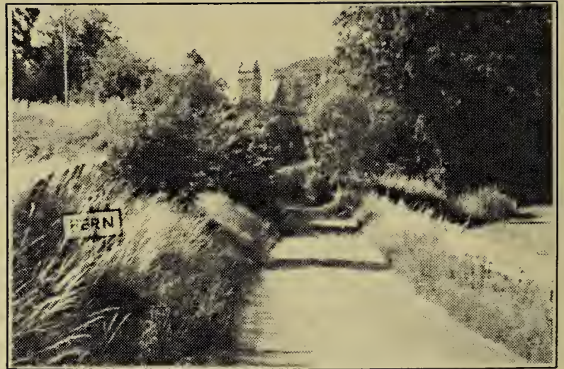
Town of Fern.