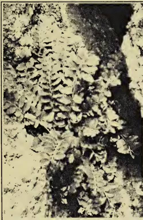
Asplenium marinum.