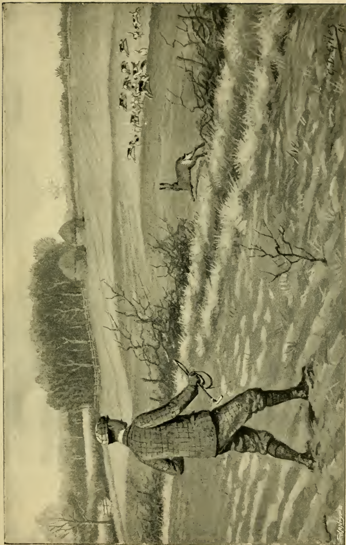
'A CRITICAL MOMENT. THE HUNTSMAN STANDS STILL AS DEATH'