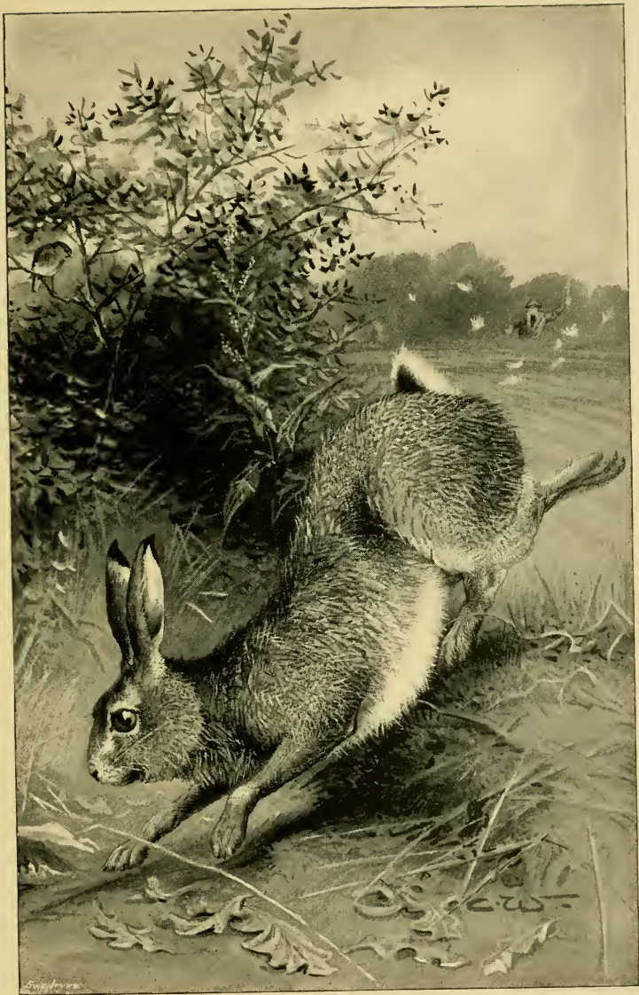
' MAKING FOR THE HEDGEROW '