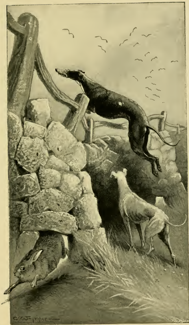
'RETURNING TO THE ORIGINAL FIELD'