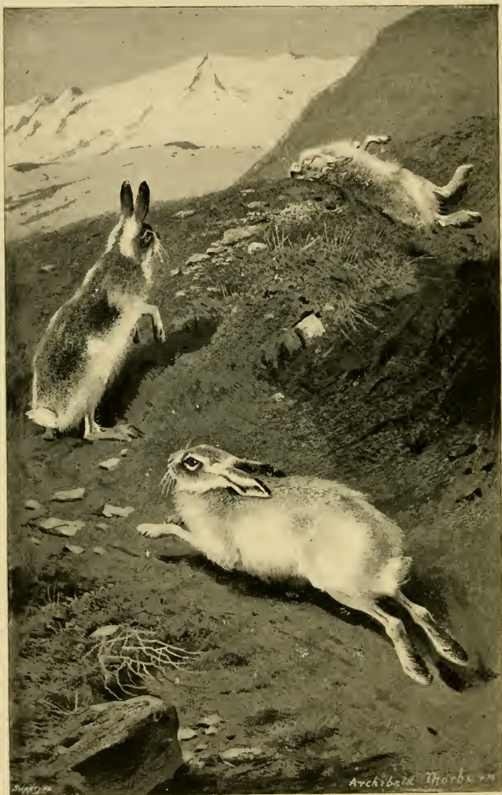
A HARE DRIVE