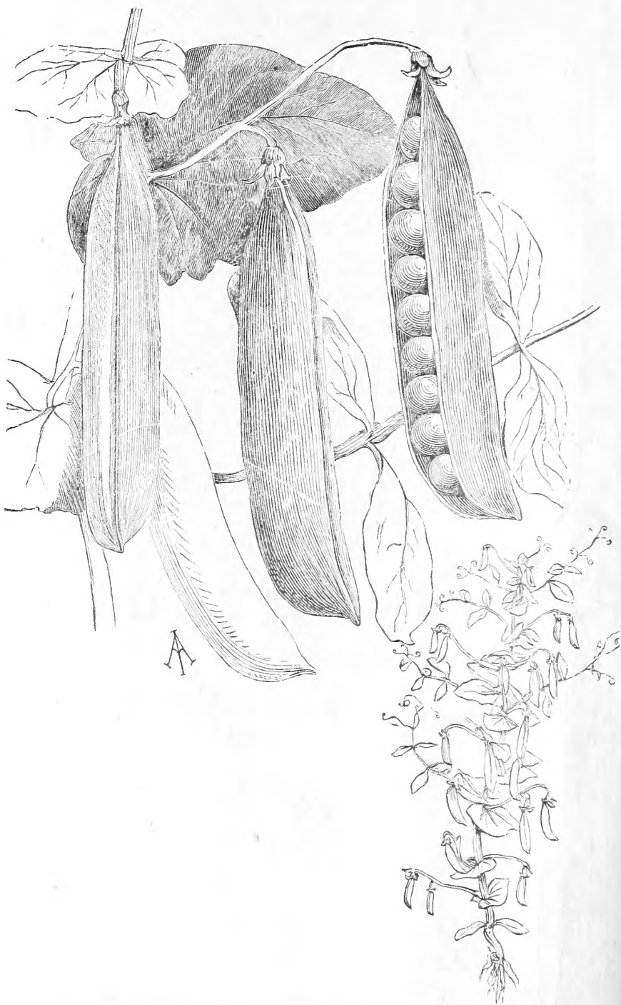
LAXTON'S DWARF LONG POD PEA.