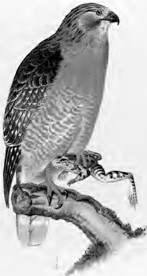
RED-SHOULDERED HAWK Buteo lineatus (Gmel)