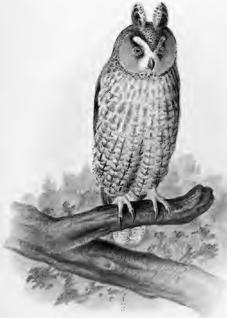
AMERICAN LONG-EARED OWL.