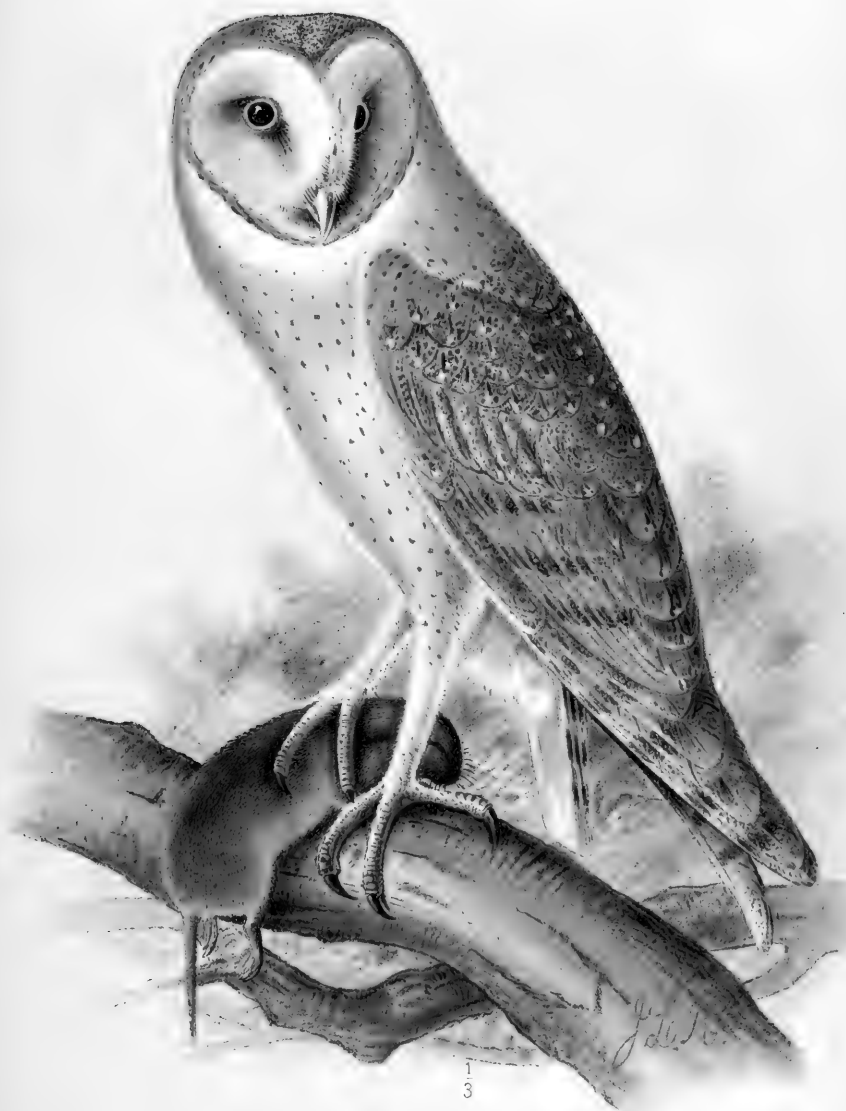
BARN OWL Strix pratincola Bonap.