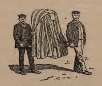
THE BATH CHAIRS.

douche, enters the bath, and the usual clothing is returned to the hotel by the servant. After the douche and rubbing down, the patient is carefully wrapped in the blanket, which has been warmed in a gas oven in the meantime, and the bath chair having been brought into the dressing room, the patient is put into it, and carried to the hotel, up to his room,