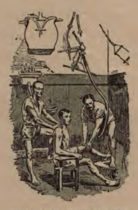
THE DOUCHE MASSAGE.

women who perform it have had their art handed down to them for many years, as their fathers and mothers have been "masseurs" or "masseuses" before them. The Aix waters have an unctuous quality which makes them particularly adapted to rubbing and kneading the muscular structures that is not found in other waters.