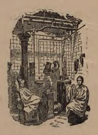
LOCAL VAPOUR BATHS.

uratic precipitation and gives the kidneys time to overtake their arrears in the task of eliminating uric acid. We shall not dwell here on the therapeutic action produced by drinking the Aix waters, except to say that it is certainly powerful in its good influence over disease.