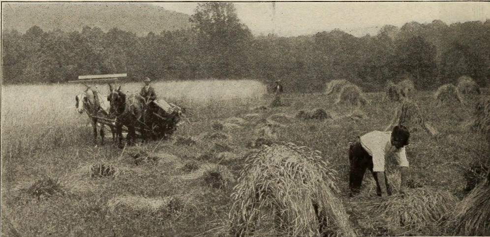
LEAP'S PROLIFIC WHEAT

Price, $3.25 per bushel of 60 lbs.; 10-bushel lots, $3.15 per bushel.