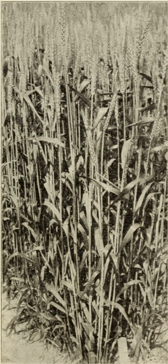
"BEARDLESS" RURAL NEW YORKER WHEAT.

Price, $3.00 per bushel of 60 lbs.; 10-bushel lots, $2.90 per bushel.