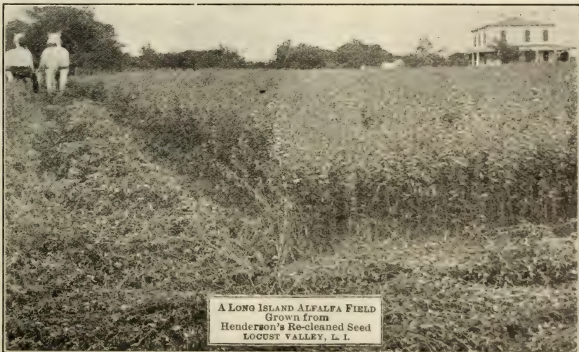
A LONG ISLAND ALFALFA FIELD Grown from Henderson's Re-cleaned Seed LOCUST VALLEY, L. I.

Full cultural instructions will be found in our new Booklet "ALFALFA ON NORTHERN FARMS" sent free to all applicants.