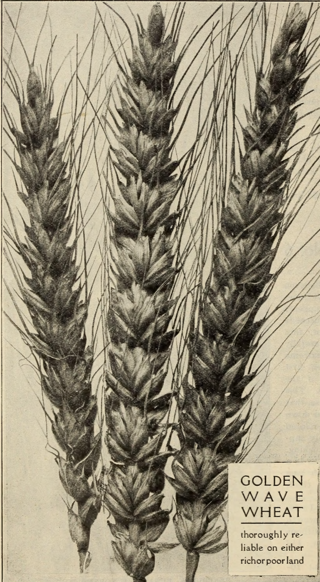
GOLDEN WAVE WHEAT

Price, $3.00 per bushel of 60 lbs.; 10-bushel lots, $2.90 per bushel.