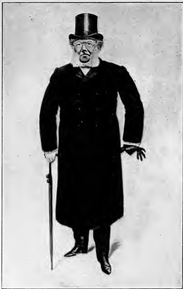
From a drawing by Gustav Laerum.