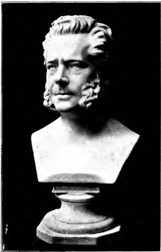
Bust of Ibsen, about 1865.