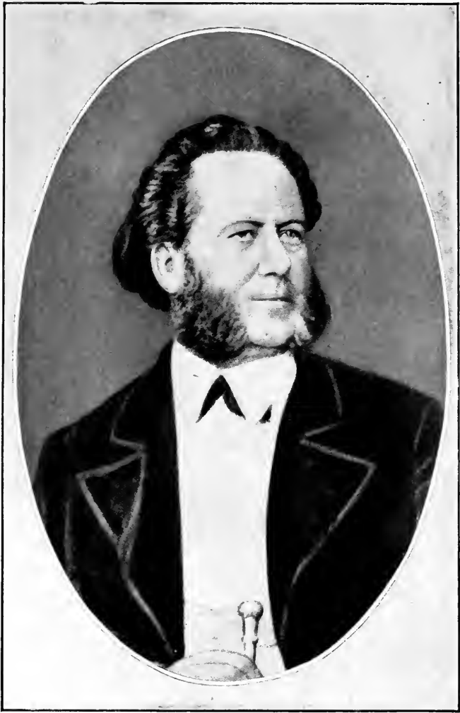
Ibsen in 1868.