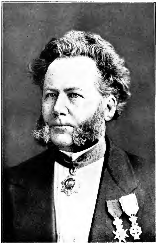
Ibsen in Dresden, October, 1873.