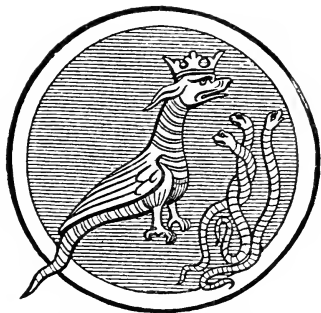
From an illuminated MS. of XIVth cent.

Balls , (1) eyeballs, (2) cannon-balls; V. ii. 17. Balm , consecrated oil used for anointing kings; IV. i. 269. Bankrupt (Folios, " banqu'rout "); IV. ii. 43. Bar , impediment, exception; I. ii. 35; "barrier, place of congress" (Johnson); V. ii. 27. Barbason , the name of a fiend; II. i. 56. Basilisks , (1) serpents who were supposed to kill by a glance; (2) large cannon; used in both senses of the word; V. ii. 17.