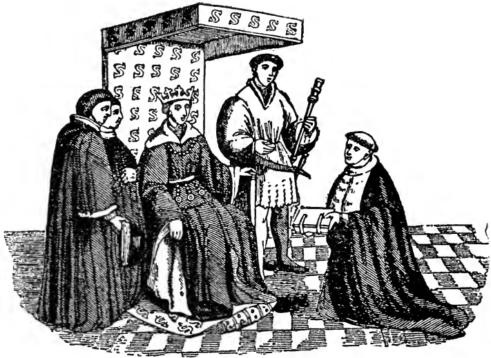
The Court of Henry V. From a MS. in Corpus Christi College Library, Cambridge.