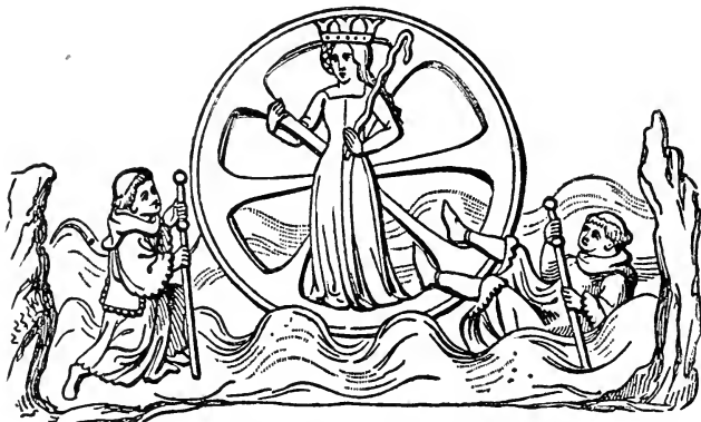
From the English translation (Cott. MS., XVth cent.) of William de Deguileville's Pilgrimage of Human Life .

III. vi. 28-30. 'And giddy Fortune's furious fickle wheel,' etc.; cp. 'Fortune is blind . . . whose foot is standing on a rolling stone,' Kyd's Spanish Tragedy .