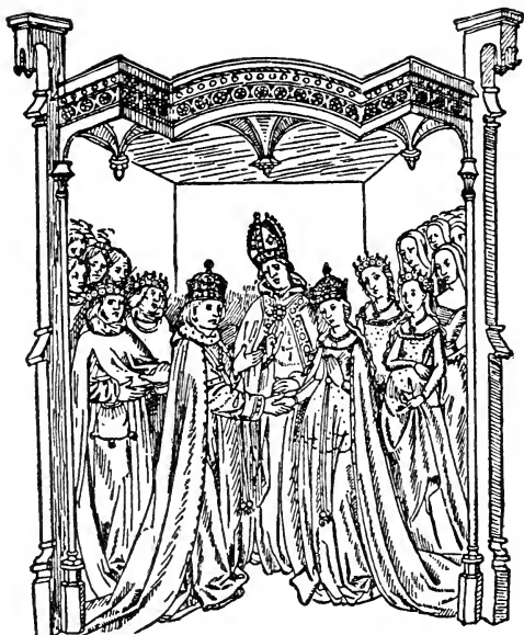
The marriage of Henry V. and Katharine of France. (From the MS. Cott. Jul. E. iv.)