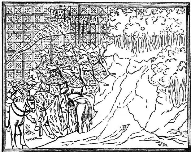
Richard II. knighting Harry Monmouth (afterwards Henry V.). (From an illuminated MS.)