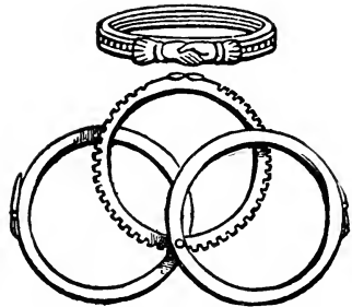
From a silver gilt specimen in the Londesborough collection.

Galliard , a nimble and lively dance; I. ii. 252. Galling , harassing, I. ii. 151; scoffing, V. i. 77. Gamester , player; III. vi. 118. Garb , style; V. i. 79. Gentle , make gentle, ennoble; IV. iii. 63. Gentles , gentlefolks; Prol. I. 8. Gesture , bearing; Prol. IV. 25. Giddy , hot-brained, inconstant; I. ii. 145. Gilt , used with a play upon "guilt"; Prol. II. 26. Gimmel bit , a bit consisting of rings or links (Folios, "Iymold"); IV. ii. 49. (Cp. illustration.)