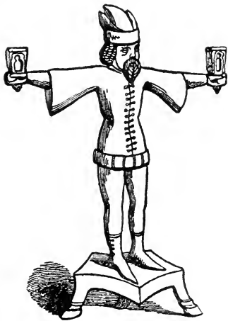
From an original specimen of the time of Charles VII. of France (A.D. 1422-1440), preserved in a private collection in Paris.

IV. i. 299, 300. ' take from them note the sense of reckoning, if the opposed numbers '; Tyrwhitt's reading; Folios, ' take . . . reck'ning of the opposed numbers: '; Theobald, ' take . . . reck'ning; lest th' opposed numbers '; etc., etc.