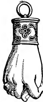
From an original specimen.

Figo , a term of contempt, accompanied by a contemptuous gesture; the word and habit came from Spain; hence "the fig of Spain" (Ornaments similar to the one here represented were much favoured in the XVIth century); III. vi. 59.