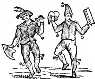
Whitsun Morris dance. From a XVIIth-century woodcut.

Morris-dance , an old dance on festive occasions, as at Whitsuntide; the reason for its connection with "Moorish" is not quite clear; perhaps from the use of the tabor as an accompaniment to it; II. iv. 25.