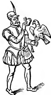
From MS. Sloane 3794 ( temp. Elizabeth).

Harfleur (Folios, " Harfew "); Prol. III. 17, etc. Hazard (technical term of tennis); I. ii. 263. Head ; "in h.," in armed force; II. ii. 18. Heady , headstrong (Folio 1, " headly "; Capell conj. " deadly "); III. iii. 32. Heaps ; "on heaps"; in heaps; V. ii. 39. Hearts , courage, valour; IV. i. 301. Held , withheld, kept back; II. iv. 94. Helm , helmet; IV. vii. 163. Heroical , heroic; II. iv. 59. Hilding , mean, base (Prof. Skeat makes hilding a contraction for hildering = M.E. hinderling = base, degenerate); IV. ii. 29. Hilts , a sword; used as singular; Prol. II. 9. His , its; I. i. 66. Honour-owing , honourable; IV. vi. 9.