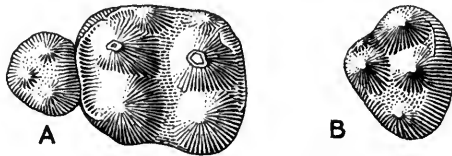
FIG. 17. A, Heliscomys woodi sp. nov. Holotype. F.M. No. P26255. Crown view of P_4 - M_T . \times 15 . B, Heliscomys sp. Walker Museum No. 1643. Crown view of P_4 . \times 15 .

In M_T the four primary cusps are conular and subequal in shape and size. There is a slight posterior cingulum. The anterior cingulum is rather wide but much less so than in other known species. The anterior and external cingula are not continuous as they are in other species. The external cingulum is narrow and the stylar cusps are small and low. The anterior cingular cusp is postero-external to the protoconid and the posterior one is almost directly external to the hypoconid. The posterior cingular cusp is much smaller than the anterior and both are much lower than the primary cusps. The transverse valley is deeper than the antero-posterior valleys—seem-