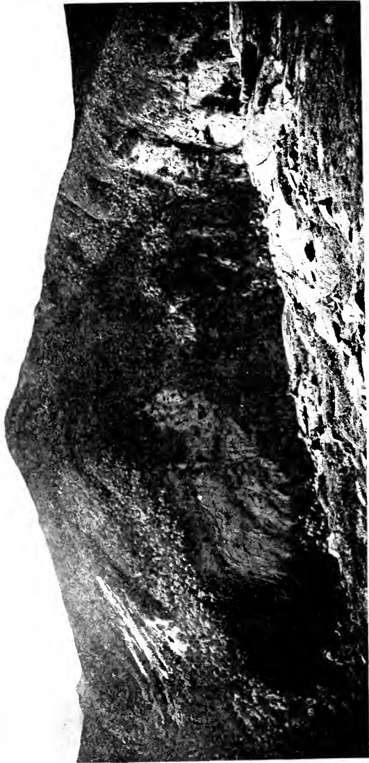
MT. MARCY OVER PANTHER GORGE FROM HAYSTACK

“ I know of no two finer prospects than the one over Panther Gorge toward Marcy, and the one over the rocky Gothics ”