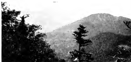
HERBERT, MAC INTYRE, WRIGHT AND COLDEN FROM REDFIELD LOOKING OVER THE VALLEY OF THE OPALESCENT

Redfield This is another mountain without a 4,606 feet trail. In fact none of the remaining Rating 7 mountains, unless specifically mentioned, has one. We left the Opalescent Trail and followed Uphill Brook for about a mile to where it branched, passing some good sized falls on the way. We took the right hand fork