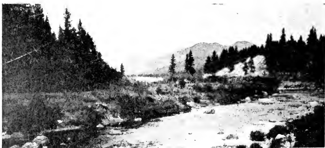
THE STONY AUSABLE—A GATEWAY TO AND FROM THE LOFTY PEAKS

*Elevation above sea level as given in United States Geological Survey maps.