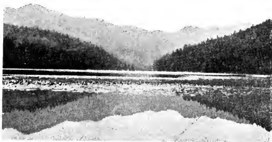
MOOSE POND, IN THE PASS BETWEEN STREET AND WALLFACE. A wilderness lake surrounded by virgin forest

In an endeavor to add to the knowledge concerning these mountains, and to encourage nature-lovers to get out and climb them, I have attempted to give a brief description of