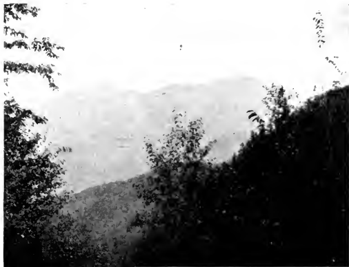
DIX AND NIPPLETOP FROM LOWER WOLF JAW "One of the great individual views of the Adirondacks"

The sight from the Lower Wolf Jaw is, I think, better than from the Upper. The view over the range is much the same, but in addition there is a view toward Giant and Keene Valley and another toward Dix.