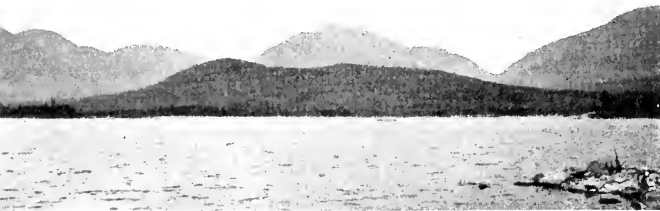
COLVIN, NIPPLETOP AND DIX FROM ELK LAKE (Elk Pass to the left, Hunter Pass to the right) "It would be difficult to imagine a finer view"

Foreword In every mountain section in the country there is a certain elevation, arbitrarily selected, which divides the monarchs of the region from the ordinary mountains. Thus in the Colorado Rockies 14,000 feet is generally chosen as the height which enables a mountain to get on the roll of honor. In the East no peaks rise nearly to that height, and so, of course, the elevation necessary to make a mountain a monarch is lowered. In the Appalachians of North Carolina it is about 5,000 feet; in the White Mountains of New Hampshire it is 4,000; in our own Adirondacks it is also 4,000. Here there are forty-two peaks which fall in this category. But, unlike the other sections, these peaks are comparatively little known and, with a few exceptions, almost never climbed.