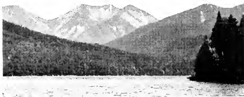
SADDLEBACK, GOTHICS AND SAWTEETH FROM UPPER AUSABLE LAKE

dleback it is joined by a trail which follows up Ore Bed Brook. From the east it is approached by the most often used trail which starts, as already mentioned, on the Ausable Lake