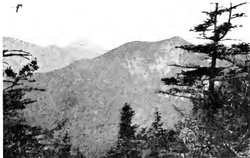
HAYSTACK, MARCY AND BASIN OVER THE VIRGIN WOODS OF GREAT BASIN FROM SAWTEETH

We had been told that Sawteeth was so heavily wooded on top a person was a fool to climb it. The first part of the statement was certainly true, but there were also ledges. From these, on the way up we got two superb views, one toward wooded