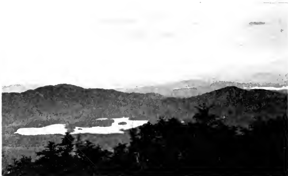
FROM SEWARD OVER BIG AMPERSAND POND, SHOWING CLEAR, LOWER SARANAC AND OSEETAH LAKES IN THE DISTANCE

“The view of the lake country is most remarkable from this peak”