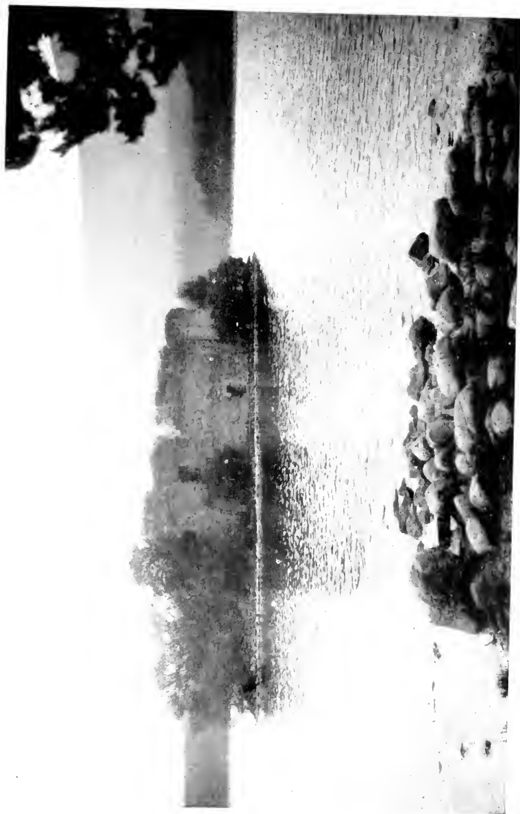
A FORMER NESTING SITE OF THE OSTRICH.