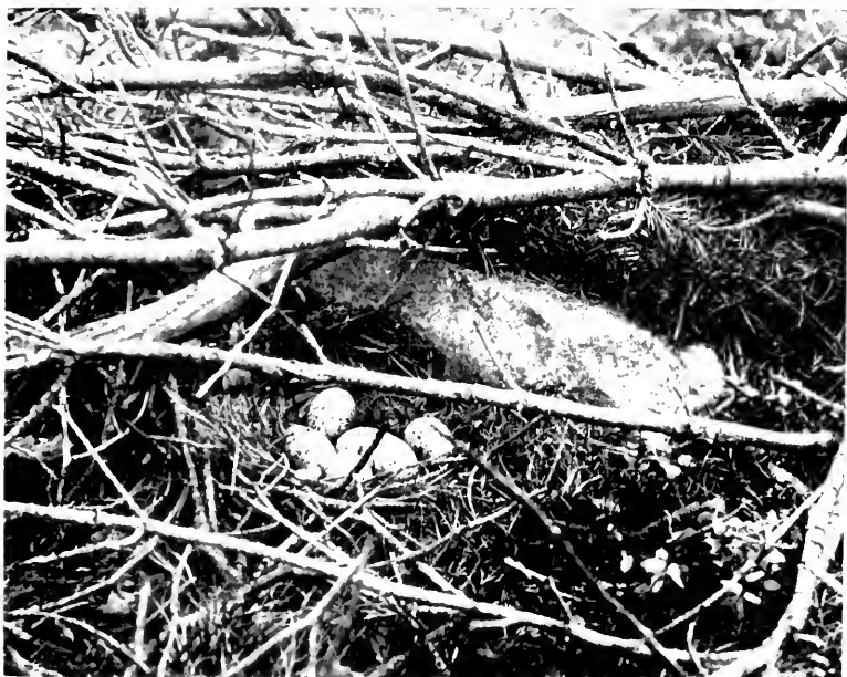
NEST OF THE GREYHEN.