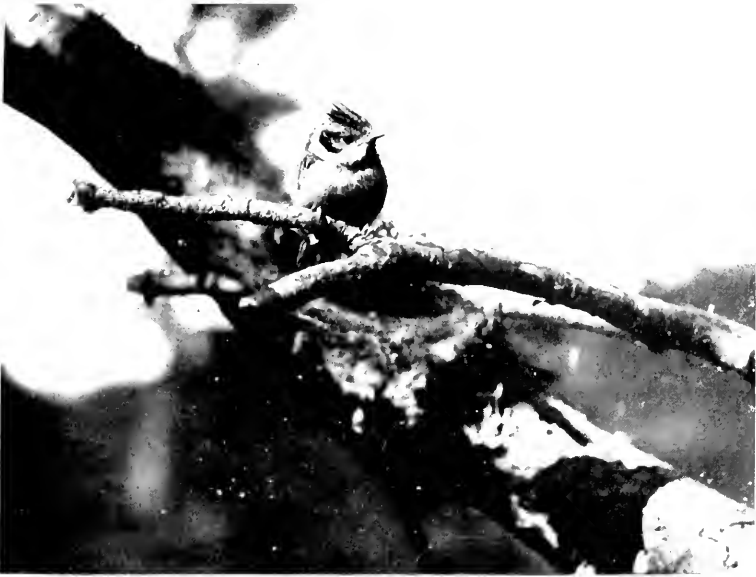
YOUNG CRESTED TITMOUSE.