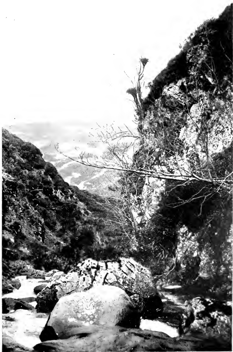
GREY CROW'S NESTS IN A SHELTERED GLEN.