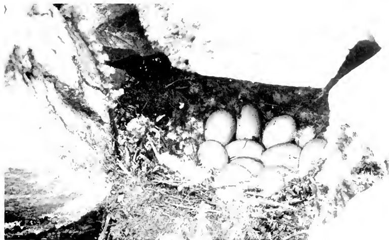
GOOSANDER'S NEST, IN A CLEFT AMONG LARGE STONES.

The hollow at the foot was too narrow to allow the bird to move backwards and forwards, so she had to fly perpendicularly up at least four feet before finding an egress