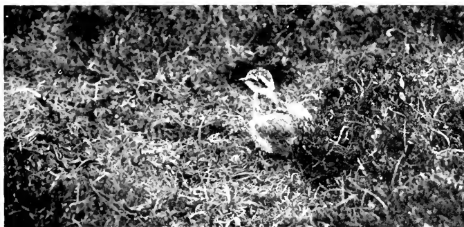
A YOUNG DOTTEREL.