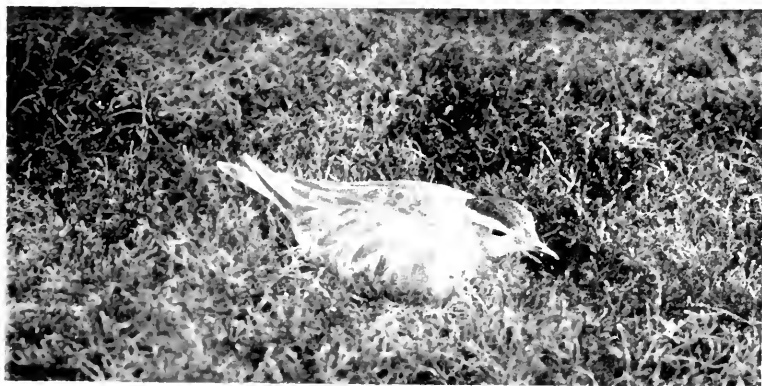
DOTTEREL AT HER NEST, NEARLY 3,000 FEET ABOVE SEA LEVEL.