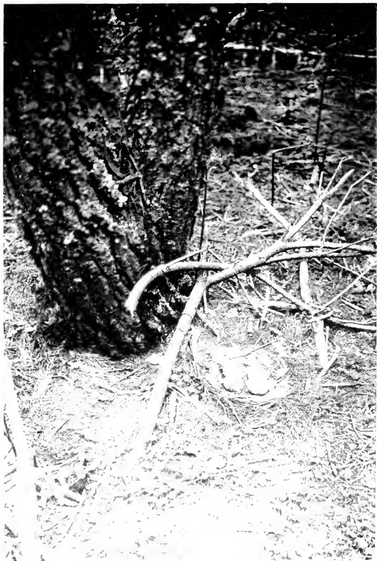
NEST OF THE CAPERCAILLIE.