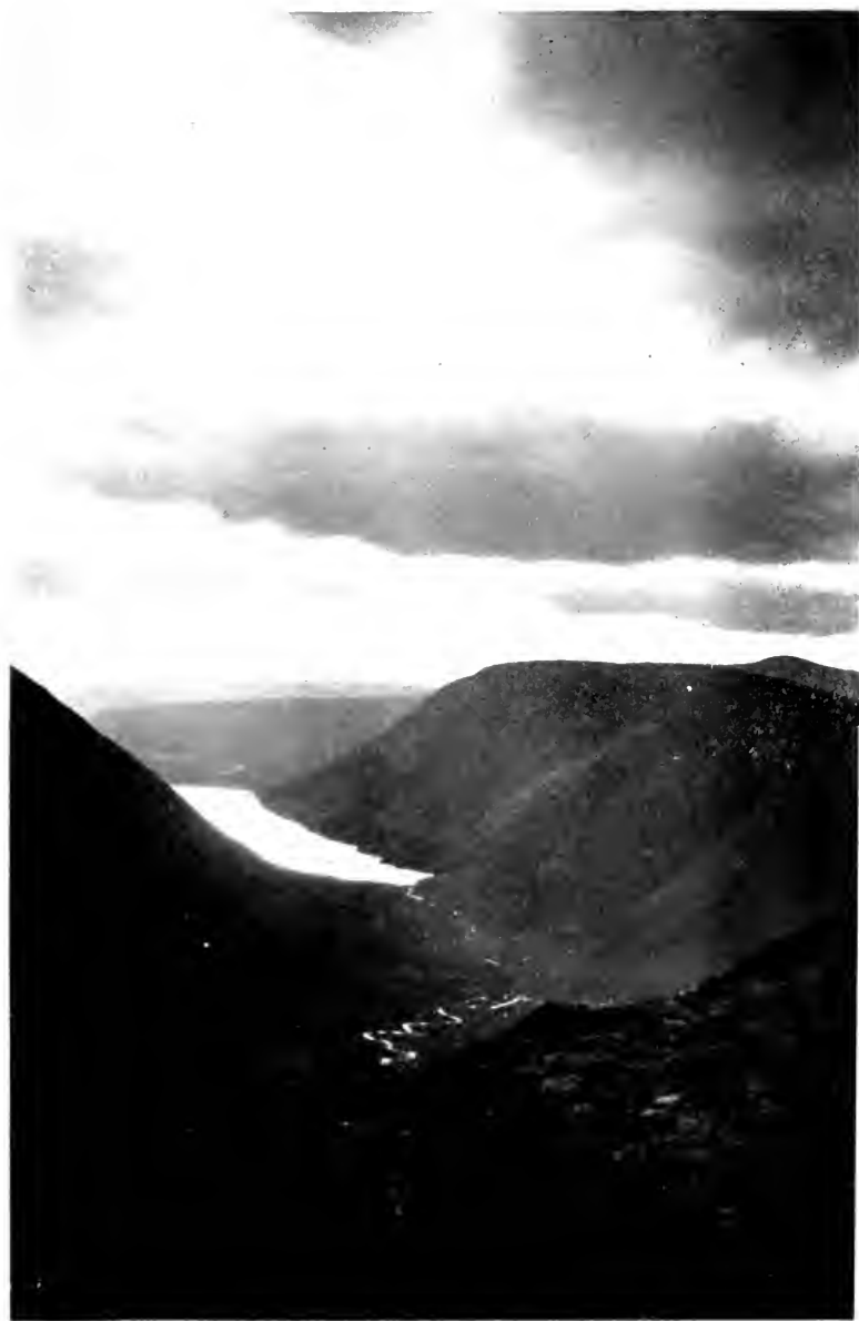
THE PERGRINE FALCON'S HOME.