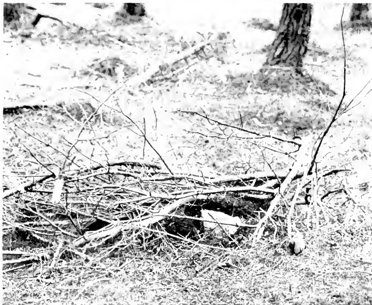
GREYHEN ON NEST.