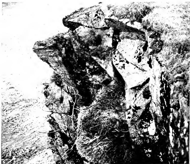
GOLDEN EAGLE'S EYRIE CONTAINING A SOLITARY EGG.

The photograph shows how one of the eggs is more strikingly marked than the other.