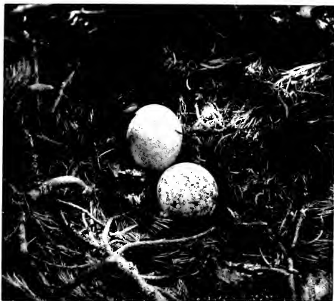
EYRIE OF THE GOLDEN EAGLE.

The photograph shows how one of the eggs is more strikingly marked than the other.