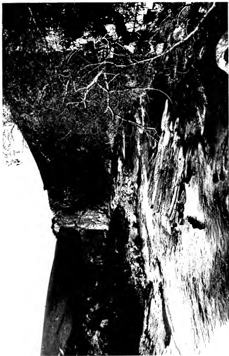
NESTING SITE OF GOOSANDER, KESTREL, DIVER AND KING OUZEL.