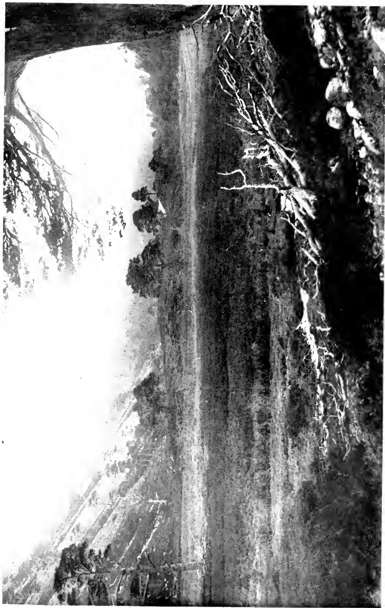
THE HAUNT OF THE GREENSHANK.