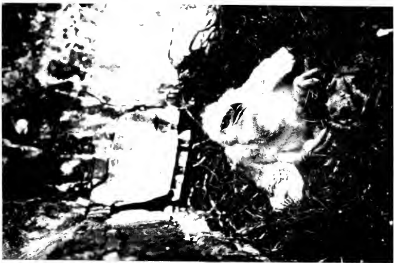
GOLDEN EAGLET NEARLY A MONTH OLD.

This picture was taken about five weeks before the bird left the eyrie.