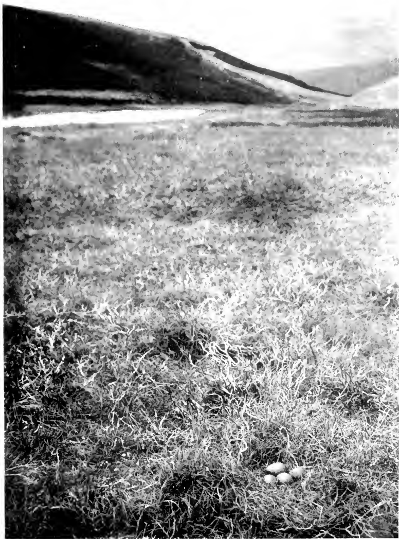
CURLEW - NEST. THE EGGS ARE LYING IN AN UNUSUAL POSITION.