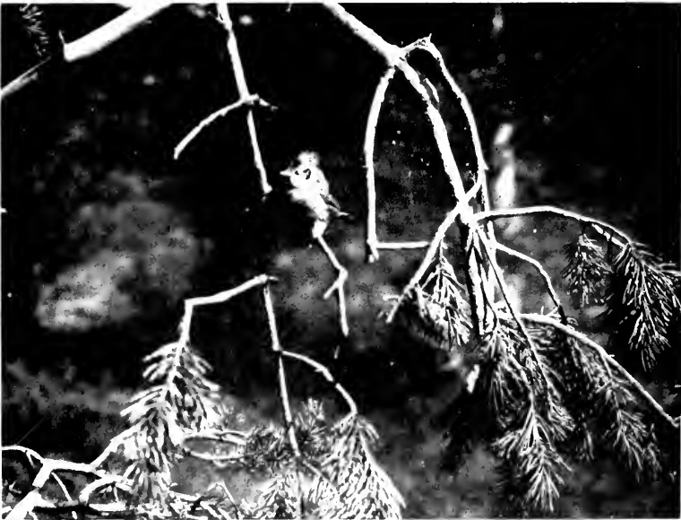
A BABY CRESTED TIT AFTER ITS FIRST FLIGHT.