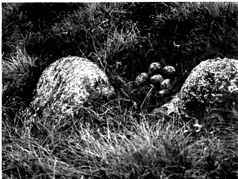
NEST OF THE PTARMIGAN. 3,500 FEET ABOVE SEA LEVEL.