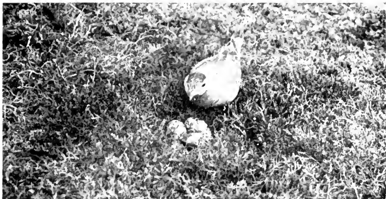
DOTTEREL GOING TO THE NEST.