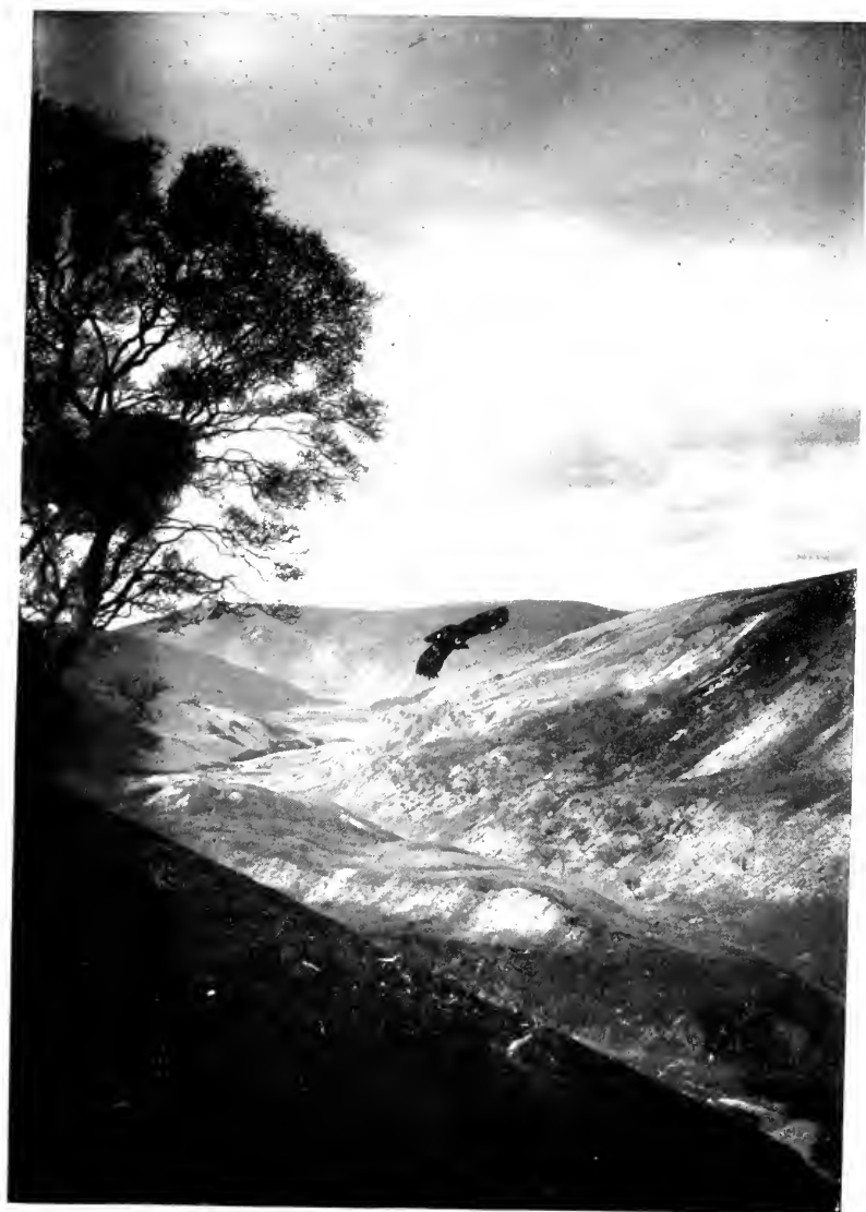
GOLDEN EAGLE SOARING OVER HER EYRIE.