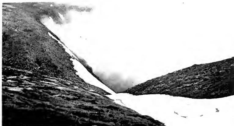
THE MIST-FILLED CORRIE OF THE PTARMIGAN.