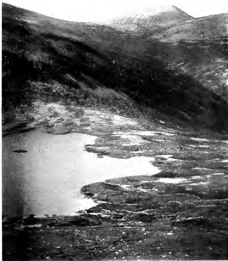
THE CORKIL OF THE SNOW BUNTING.