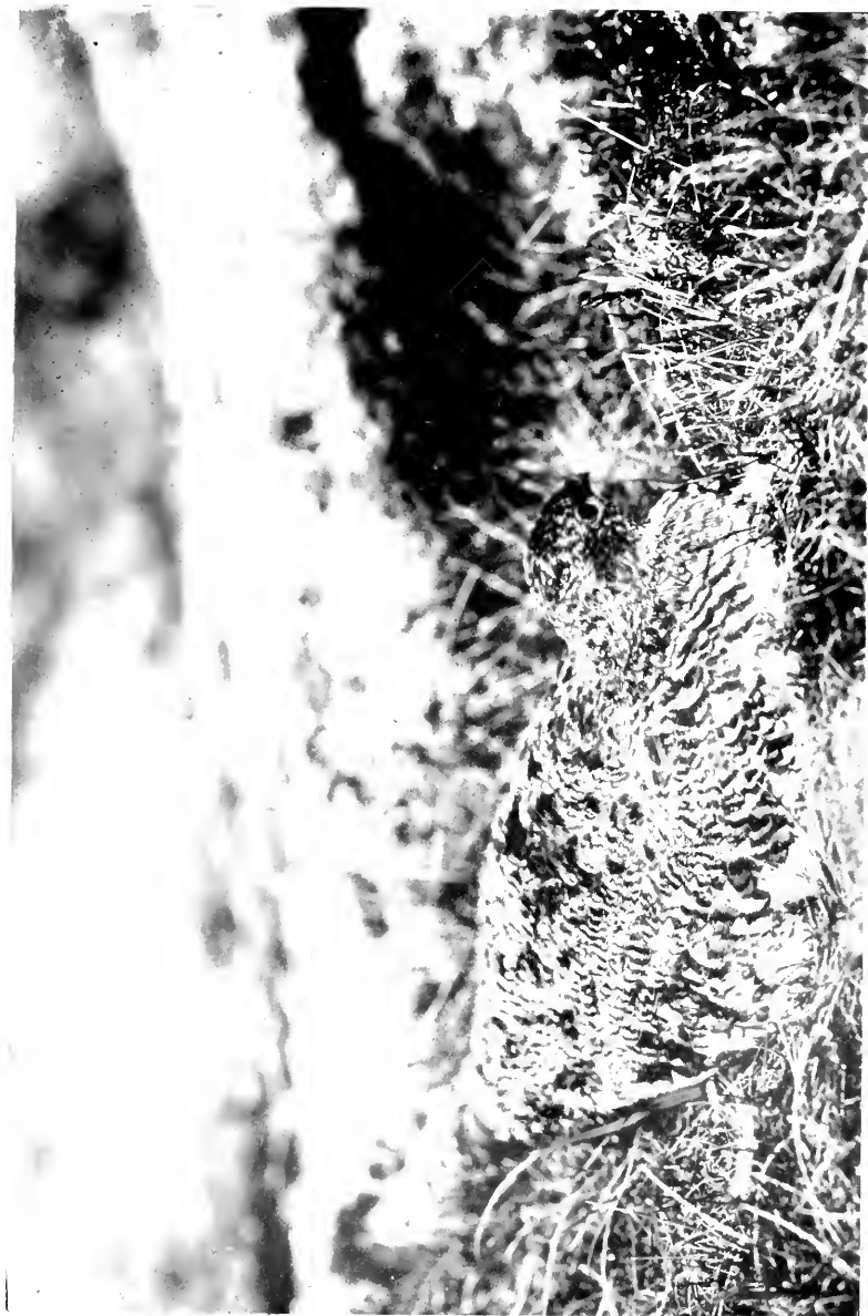
PTARMIGAN BROODING ON HER EGGS.