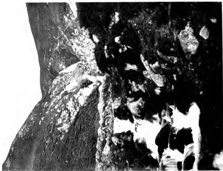
NESTING GROUND OF THE DIPPER, 2,000 FEET ABOVE THE SEA.