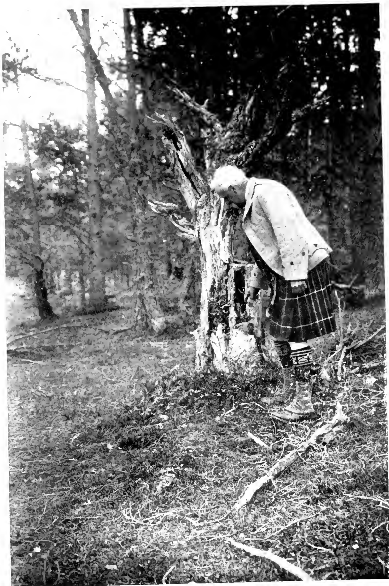
AT THE NESTING BLOW OF THE CRESTED TITMOUSE.