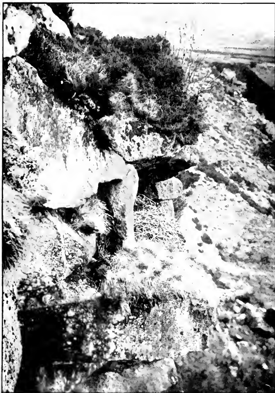
A RAVEN'S NEST.