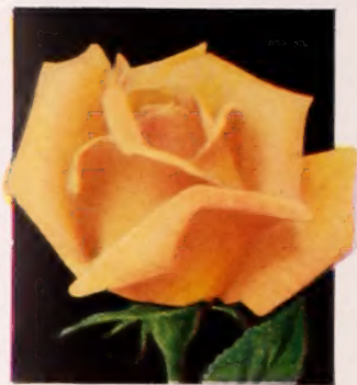
Mrs. Pierre S. du Pont

Willowmere. One of the lasting old favorites. Produces buds and blooms of soft shell pink with a luminous salmon and yellow glow.