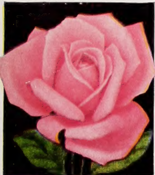
Dame Edith Helen

Joanna Hill. Very double bloom with Indian-yellow center, surrounded by bold, buff petals.