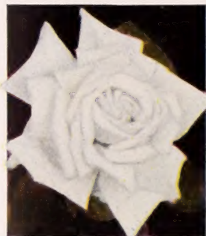
Cl. K. A. Viktoria

Paul's Scarlet Climber. No other Rose in any class can compare with it for brilliancy of color. The flowers are medium size, semi-double, scarlet, very freely produced in clusters from top to bottom of plant. The very finest pillar Rose when trained to stake.