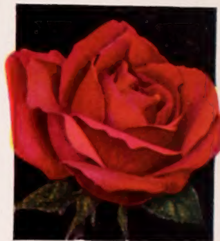
Cl. Francis Scott Key

Cl. Francis Scott Key. Sport from Francis Scott Key. One of the largest and best crimson-reds. Our own propagation; no others have it. Thrifty grower. Very thorny. Beautiful foliage. A strong climber and perfectly hardy. The very finest pillar Rose when trained to a stake. You have to see this Rose to appreciate it, for words fail to describe the brilliant color. Blooms monthly.