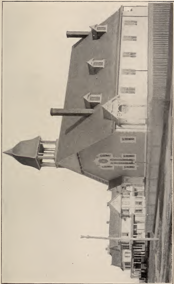
THE NEW CHURCH.