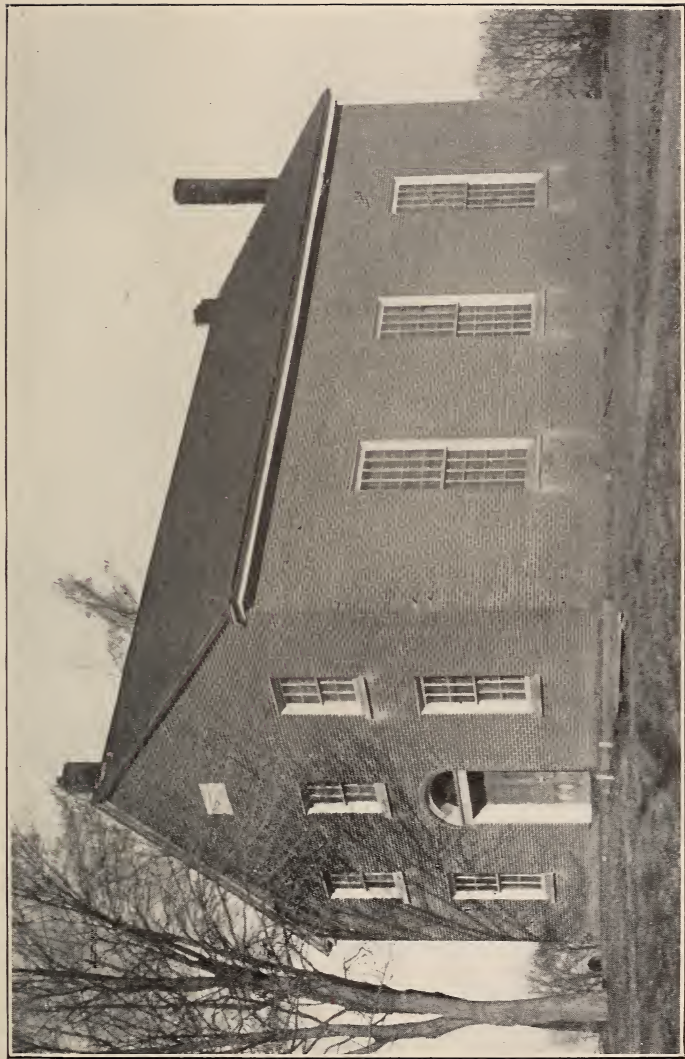
THE BRICK CHURCH.

This church was erected in 1842, on the site of the old frame church, which took the place of the log church erected at the beginning of the Seventeenth Century.