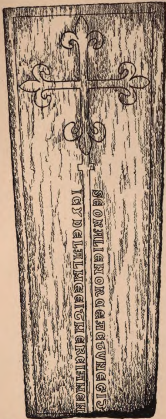
FROM MYNCHIN BUCKLAND PRIORY.