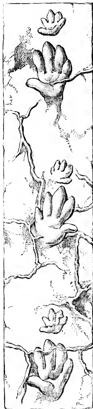
Fig. 2. Foot-prints of Labyrinthodon .

Decisive evidence of a species of Mammal being in existence at the Triassic epoch has since been had; but the remains of Tritylodon 1 have not yet revealed the structure of the feet.