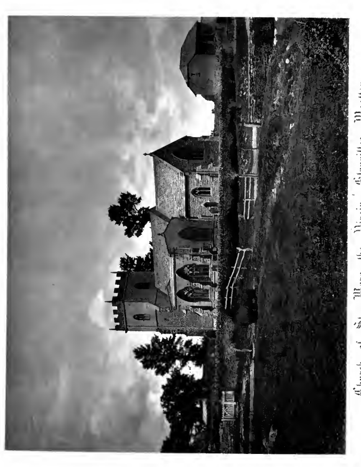
Church of St. Mary the Brigin, Glauvilles Bootton,