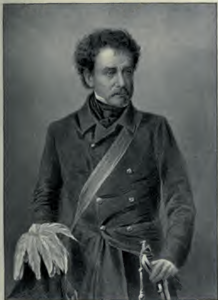
GENERAL SIR COLIN CAMPBELL, G.C.B. (LORD CLYDE).