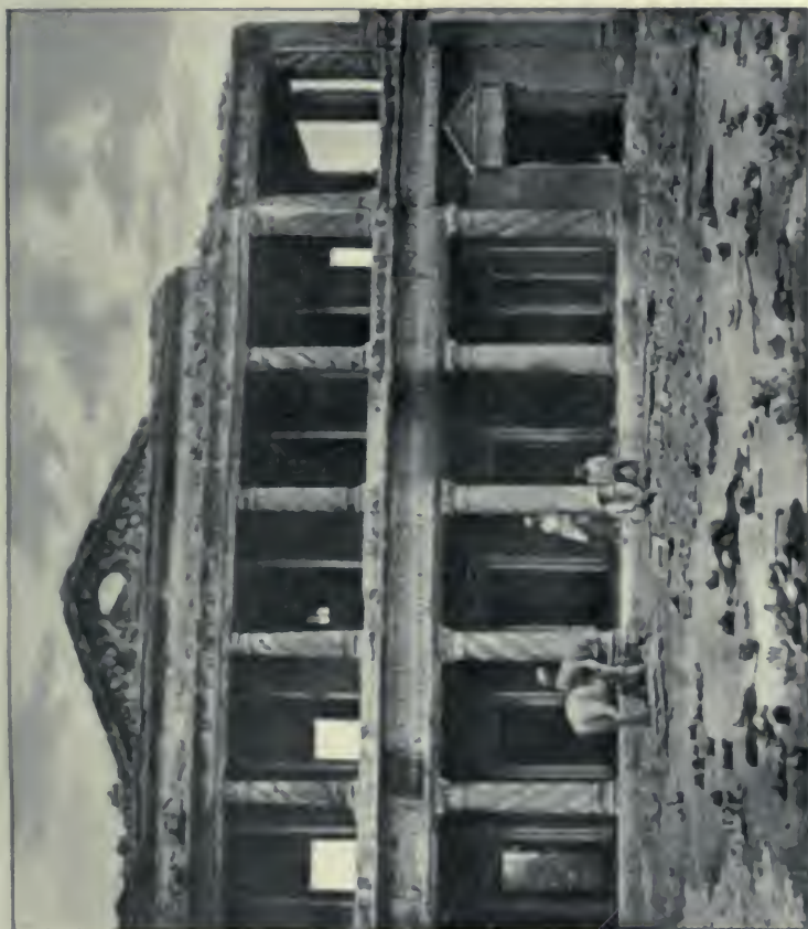
THE SECUNDER BAGH.