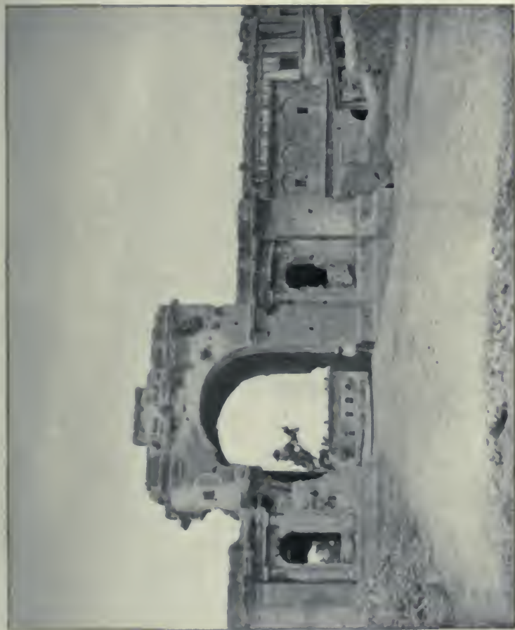
EXTERIOR VIEW OF THE BAILEY GUARD GATE.