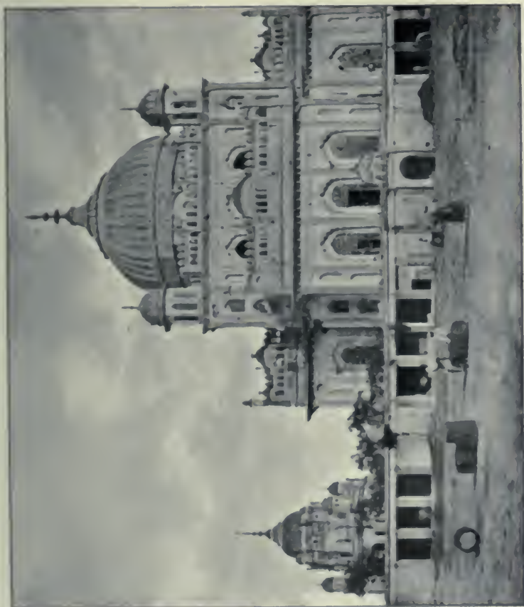
ALI KHAN'S MAUSOLEUM IN THE KAISER BAGH.