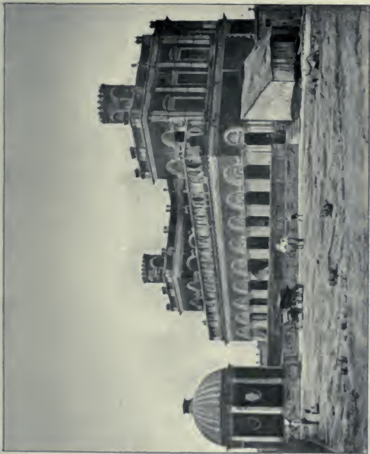
THE MOOSA BAGH