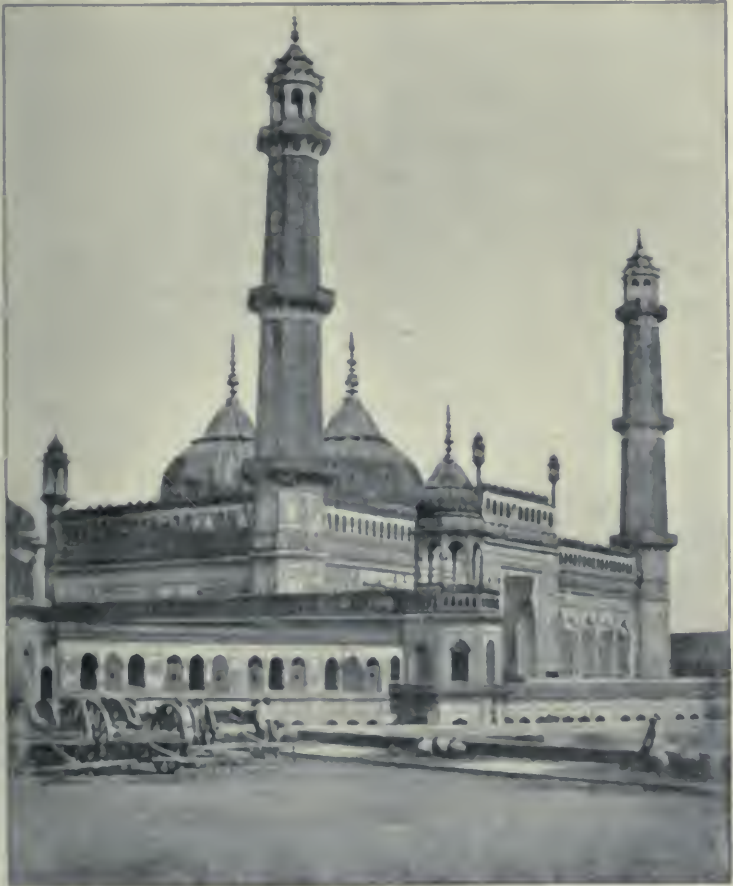
LARGE MOSQUE IN THE GREAT IMAMBARA.