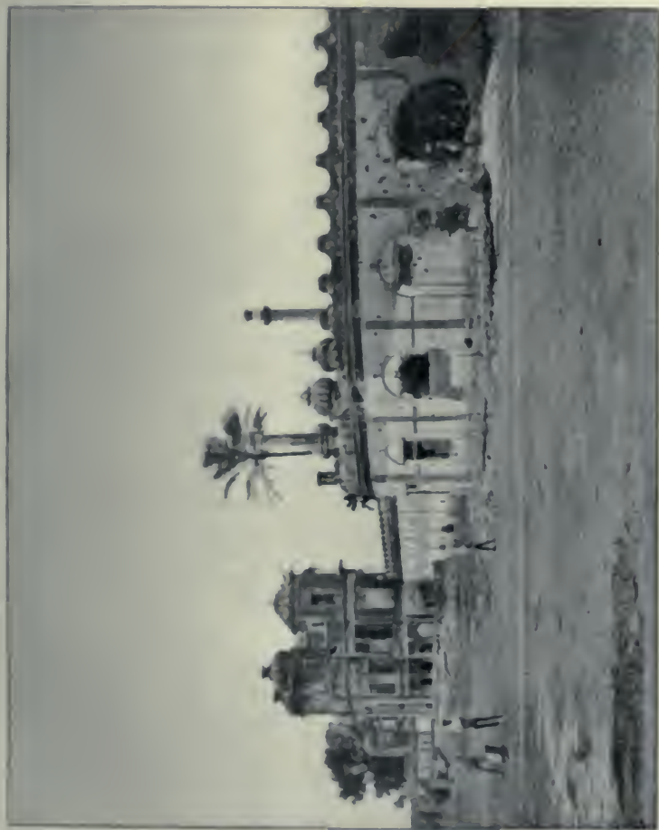
FRONT VIEW OF THE SECUNDER BAGH.