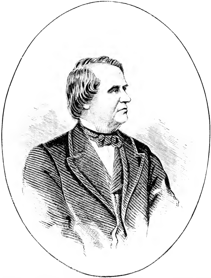
ANDREW JOHNSON, SEVENTEENTH PRESIDENT OF THE UNITED STATES. BORN AT RALEIGH, NORTH CAROLINA, DECEMBER 29TH, 1808. Engraved for the History of the Plots and Crimes.