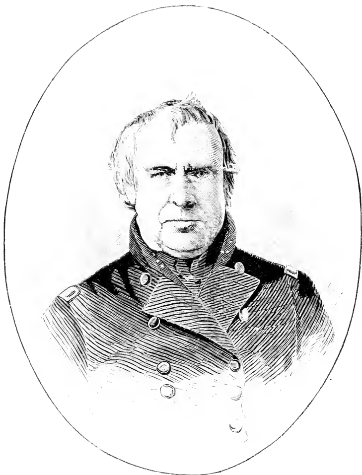
ZACHARY TAYLOR, TWELFTH PRESIDENT OF THE UNITED STATES, ASSASSINATED BY POISON JULY 4TH—DIED ON THE 9TH, 1850. (Engraved for the History of the Plots and Crimes.)