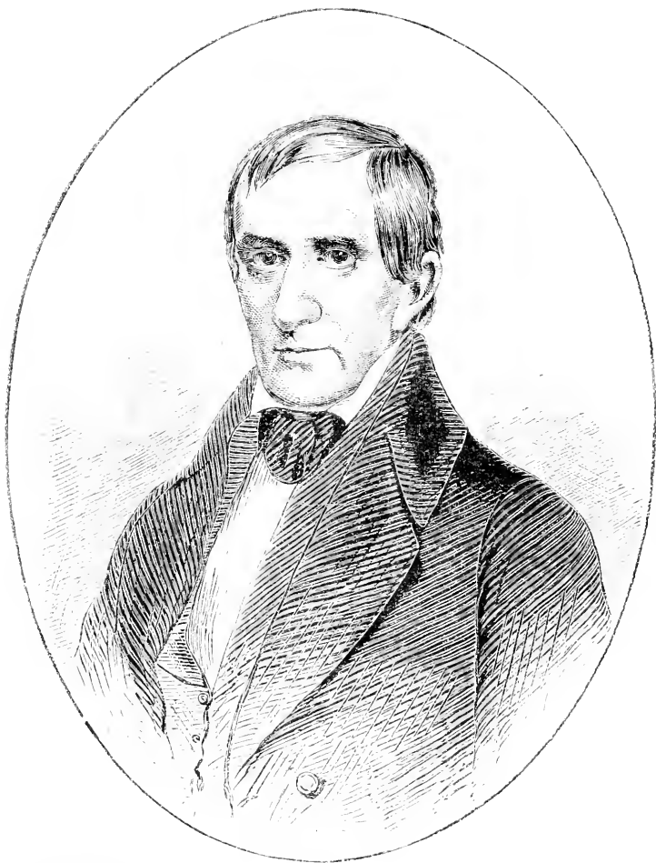
WILLIAM HENRY HARRISON, NINTH PRESIDENT OF THE UNITED STATES. ASSASSINATED BY POISON. MARCH 27 TH —DIED APRIL 4 TH . 1841 (Engraved for the History of the Plots and Crimes.)