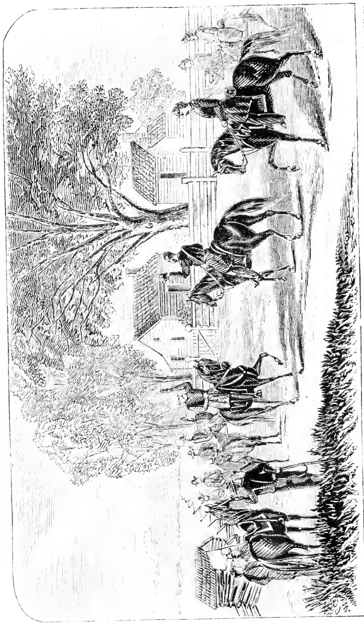
MEETING IN FRONT OF BENNETT'S HOUSE BETWEEN GENERALS SHERMAN AND JOHNSON, PRIOR TO THE LATTER'S SURRENDER APRIL 26TH, 1865. (Engraved for the History of the Plots and Crimes.)