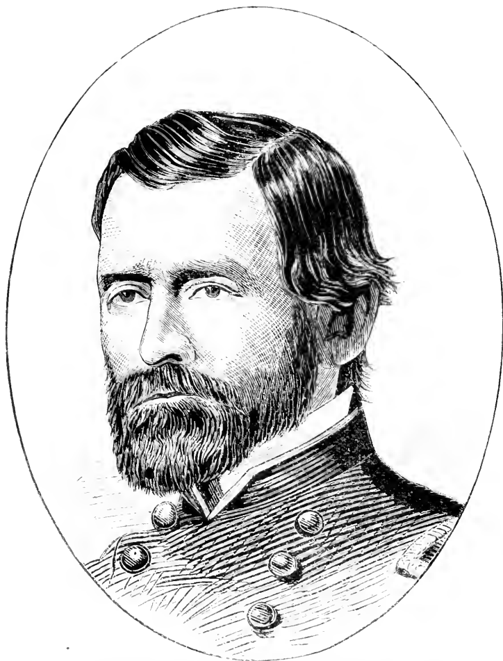
LIEUTENANT-GENERAL ULYSSES SIMPSON GRANT, U. S. A. (Engraved for the History of the Plots and Crimes.)