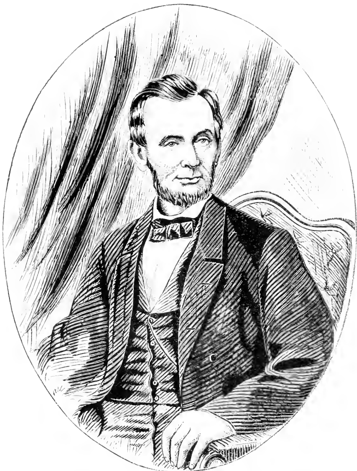
ABRAHAM LINCOLN, SIXTEENTH PRESIDENT OF THE UNITED STATES, ASSASSINATED APRIL 14TH—DIED ON THE 15TH, 1865, (Engraved for the History of the Plots and Crimes.)