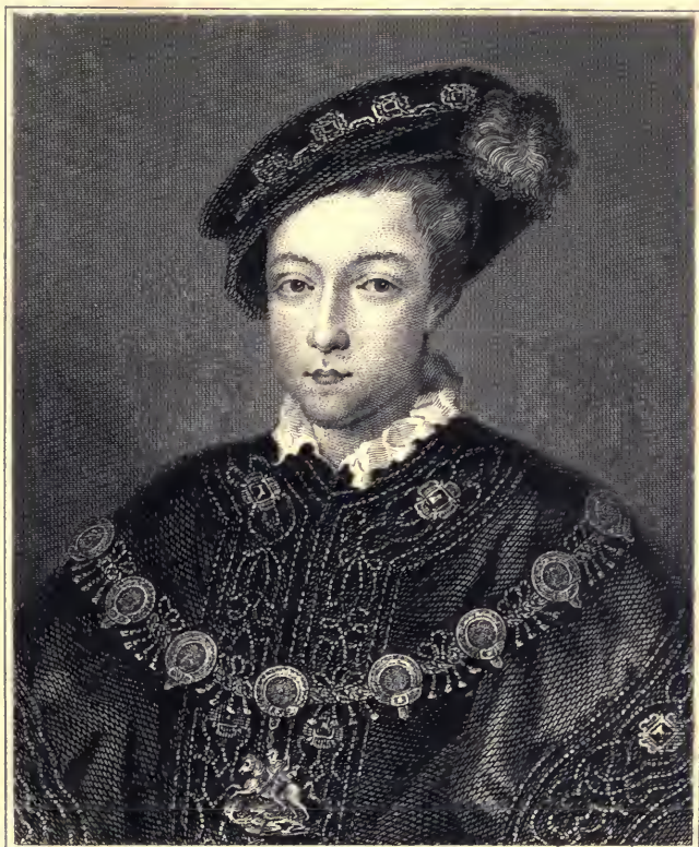
H. Holbein pinx