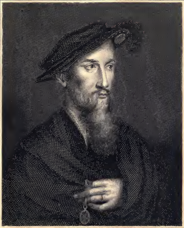
H. Holbein pinx.