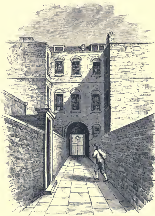
The Old Academy in Peter's Court, St. Martin's Lane