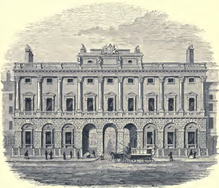
The Royal Academy, New Somerset House

March, stating that the apartments allotted to the Royal Academy in the new building at Somerset House are now completely finished, and that his Majesty has directed this year's exhibition of pictures to be there; and desiring to have an order for delivering up the same either to the president or council, or to the treasurer of the Academy, who is, by virtue of his office, to have the inspection and care both of the buildings and all other his Majesty's effects employed in that institution: I am commanded by their lordships to direct you to deliver up