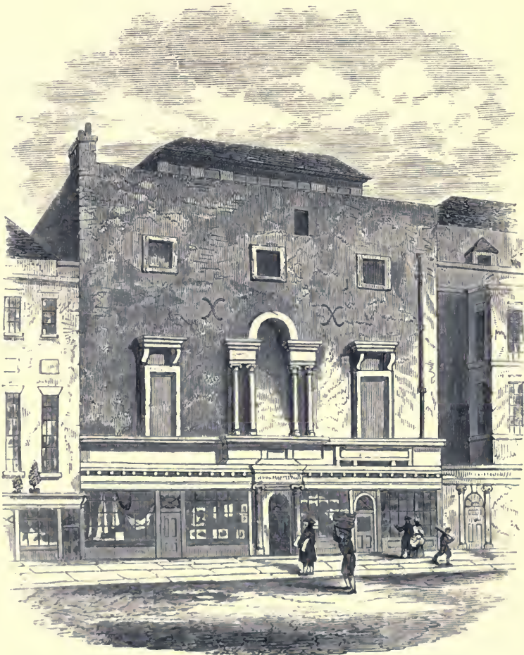
View of the old Royal Academy in Pall Mall

antique academy and a school for the living model,—the former presided over by the keeper, the latter by a succession of nine visitors. They were situated at that time