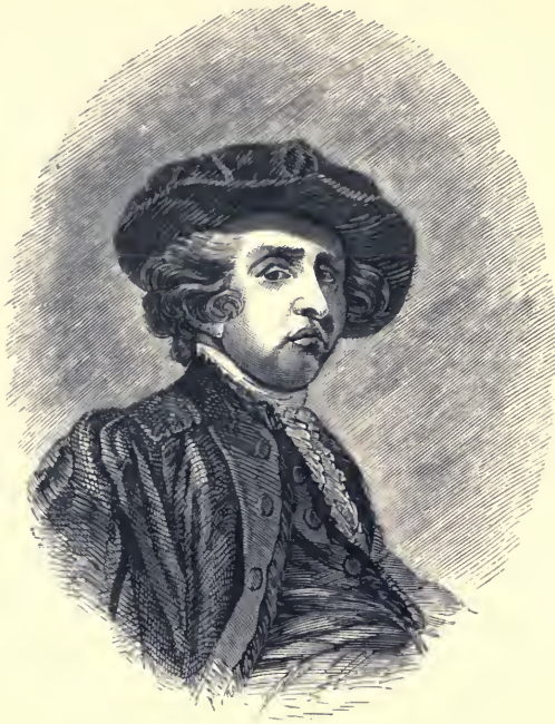
Sir Joshua Reynolds, from the portrait by himself, in possession of the Royal Academy