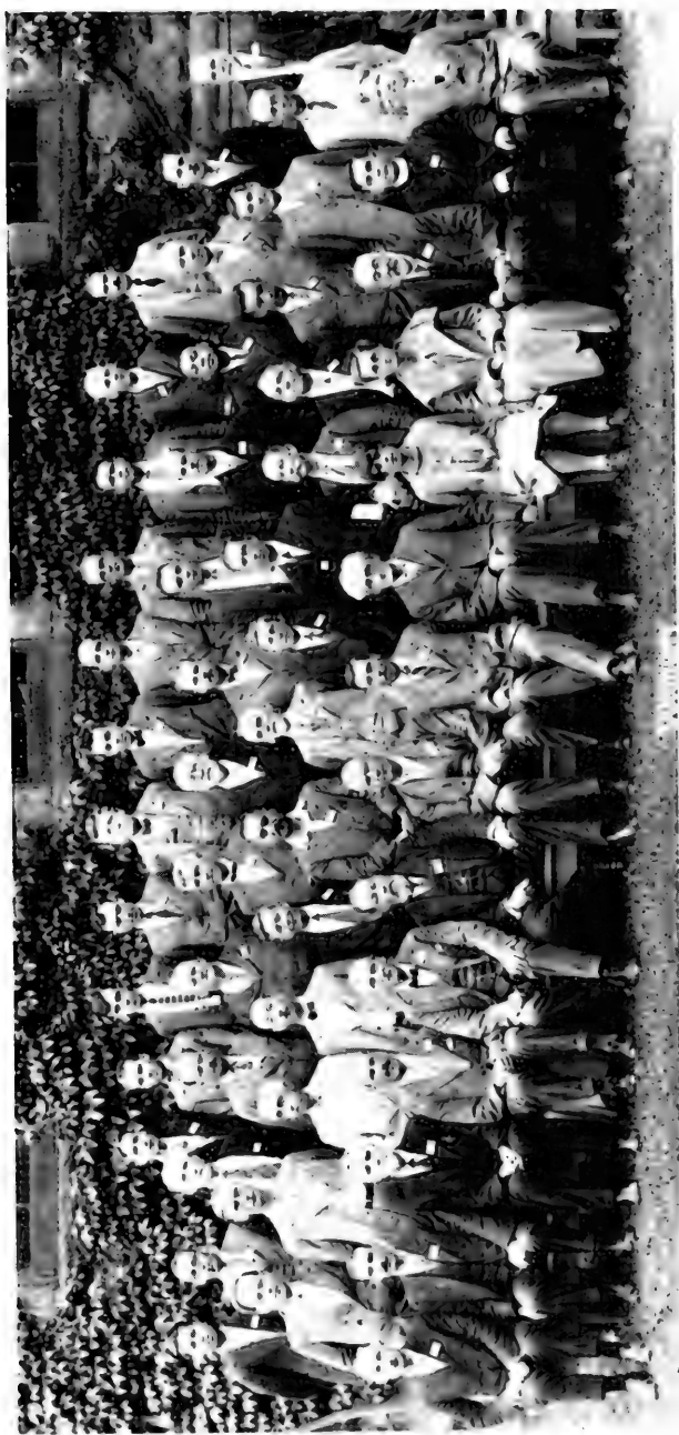
BOTANISTS AT THE INTERNATIONAL CONGRESS OF PLANT SCIENTISTS, ITHACA, NEW YORK, 1926