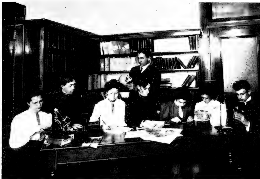
SCIENTIFIC SOCIETY, DRURY COLLEGE, ABOUT 1906