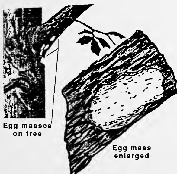
Figure 1. Gypsy moth egg masses

Starting in November, the IDA will begin egg mass searches throughout the infested counties. IDA personnel will enter yards and inspect trees for the presence of any egg masses. Homeowners and landscapers can help in the investigation by reporting any suspected gypsy moth egg masses. (Egg masses are light tan to yellow and about one inch long.) Additionally, people who vacationed this fall in Wisconsin, Michigan, or other gypsy-moth-infested areas should examine their vehicles and other outdoor equipment for egg masses that may have been laid during their visit. If you suspect that you have found a gypsy moth egg mass, please call the Des Plaines office of the Illinois Department of Agriculture at (847) 294-4343.