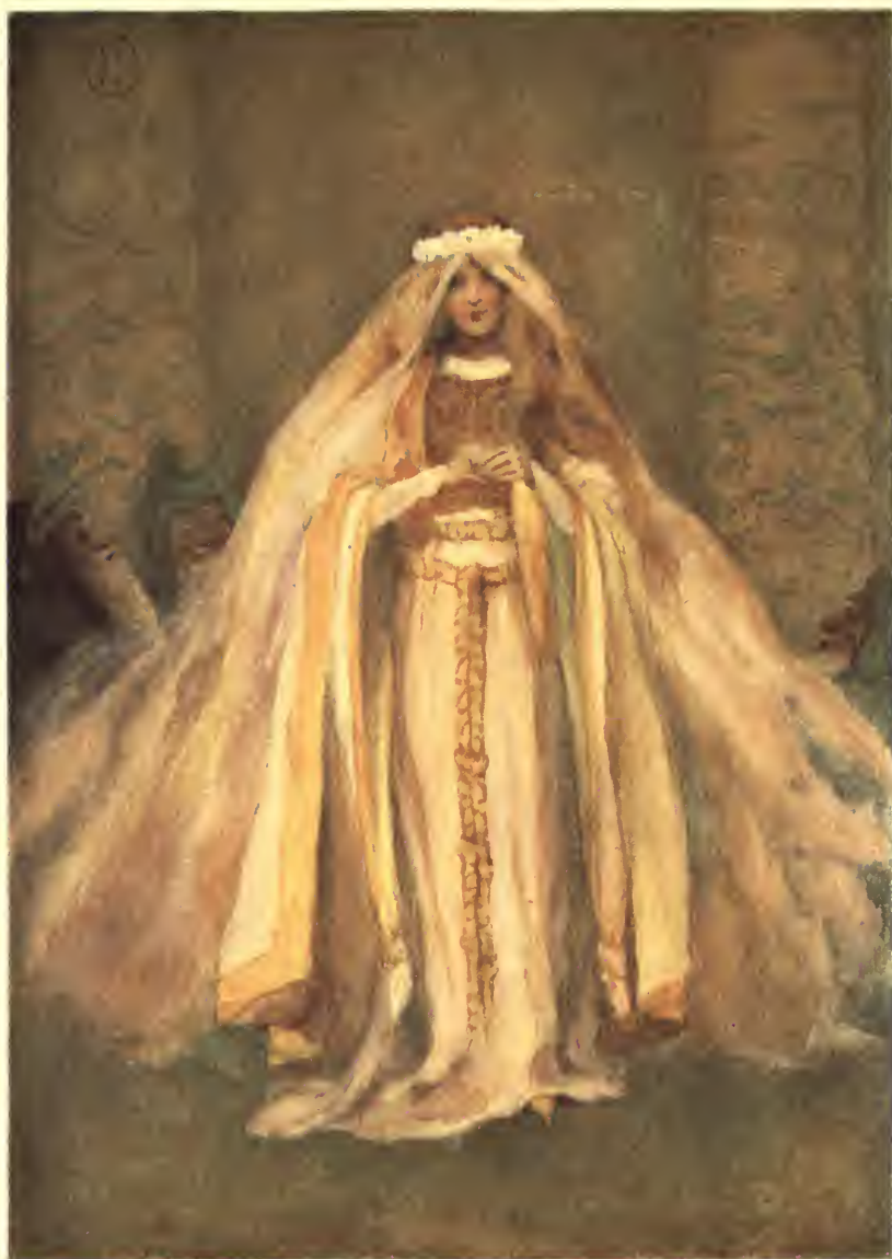
HONEY-BEE, PRINCESS OF THE DWARFS