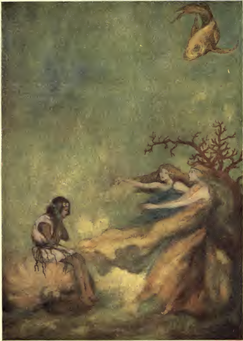
ONLY THE SONGS AND THE DANCES AND THE LOVE OF THE NIXIES