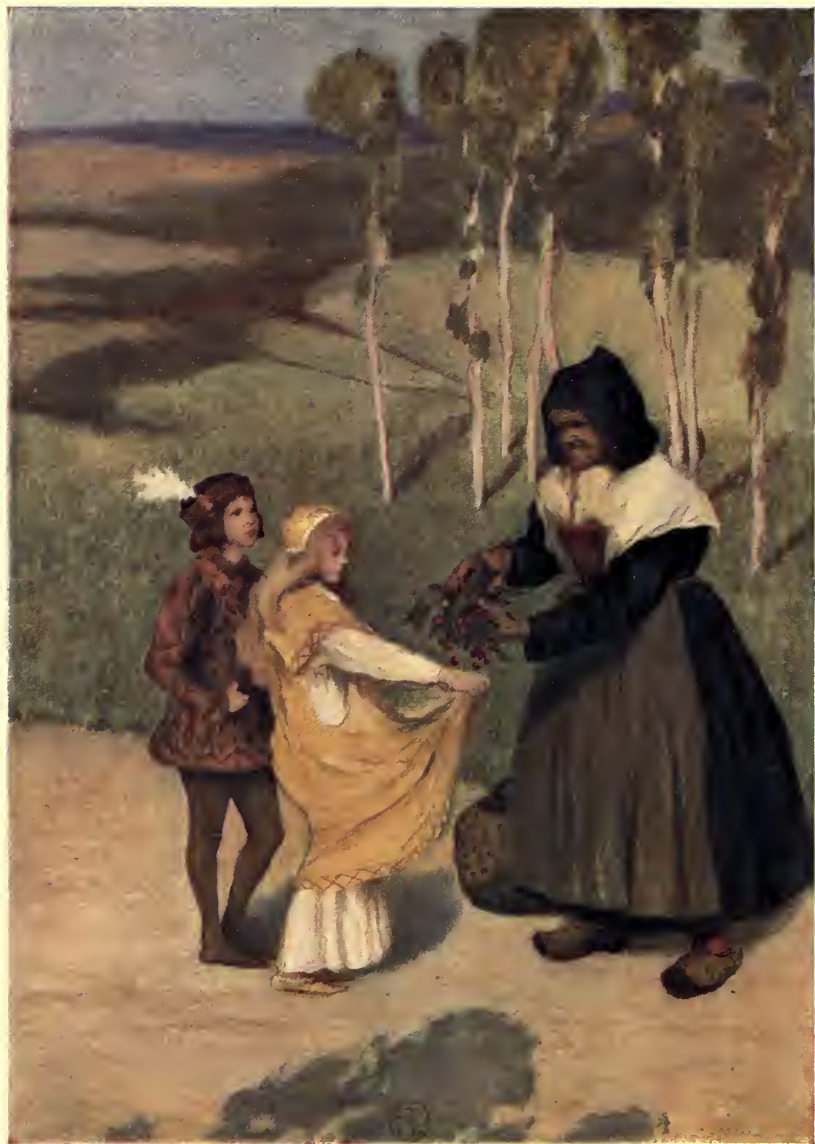
SHE RAISED HER LITTLE SKIRT WITH HER TWO HANDS