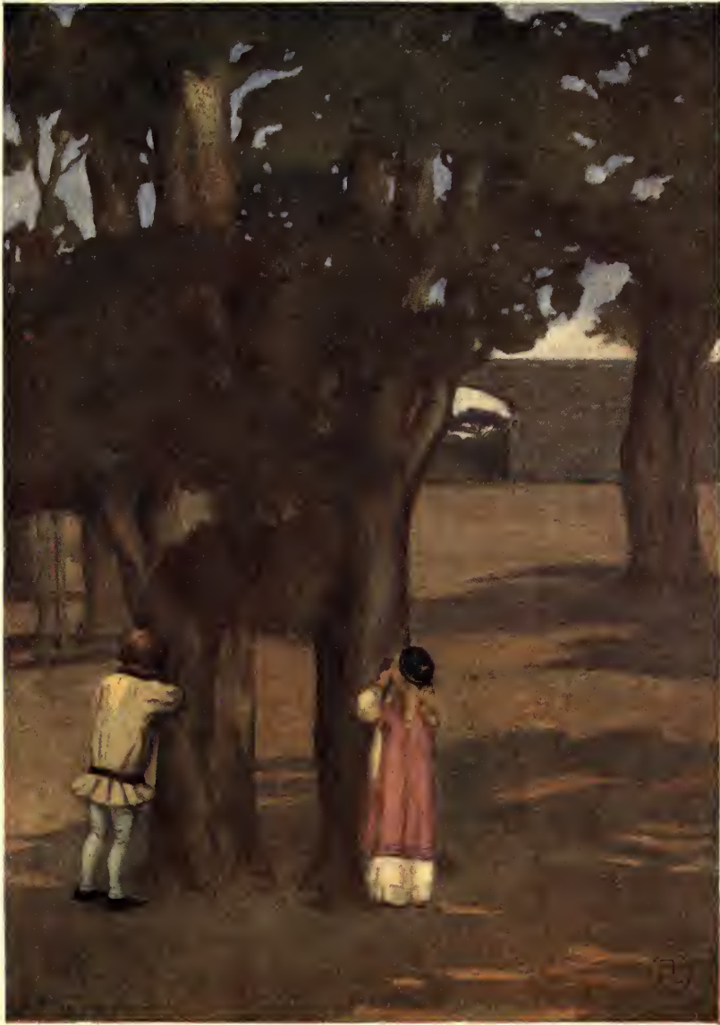
HONEY-EEE AND GEORGE WERE STILL WEEPING, EACH IN FRONT OF A TREE