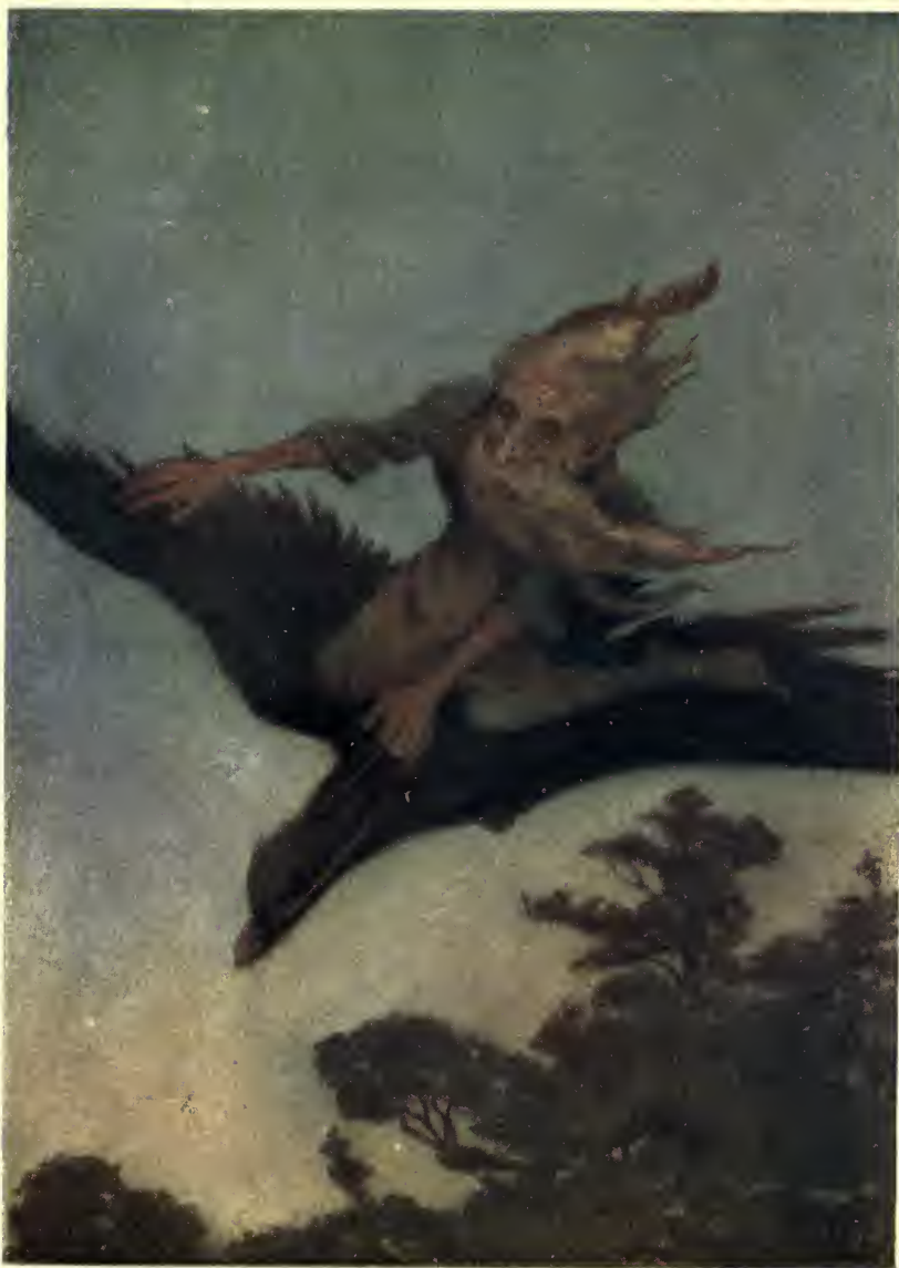
OVERHEAD SHE SAW A LITTLE DWARF MOUNTED ON A RAVEN