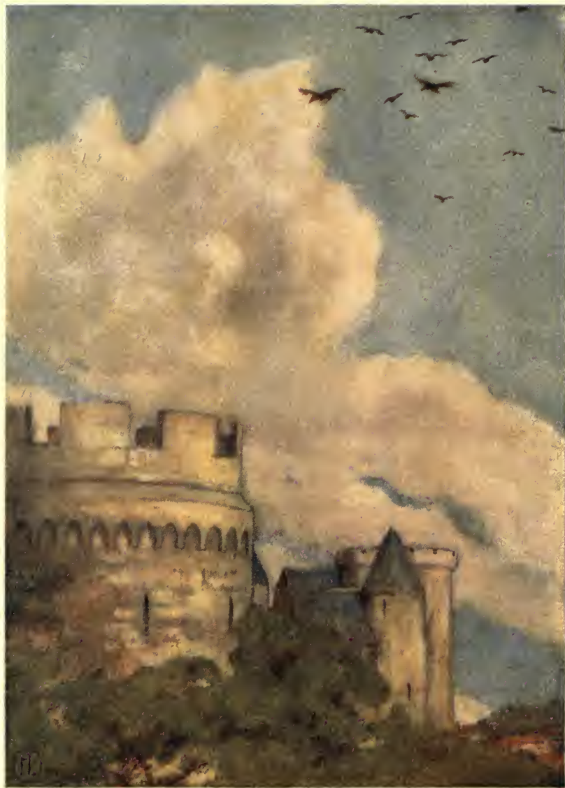
THE WATCH TOWER WHICH STANDS IN THE MIDDLE OF THE CASTLE OF CLARIDES