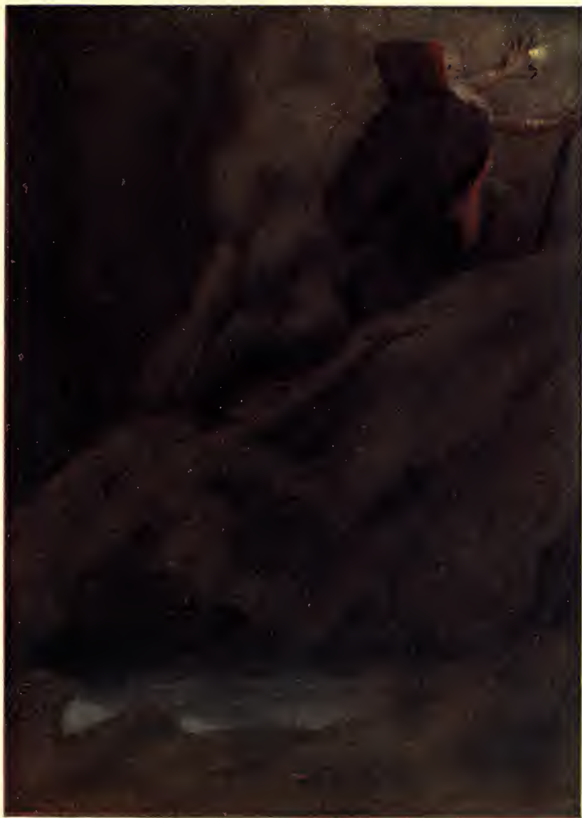
HE PENETRATED INTO GLOOMY CAVERNS