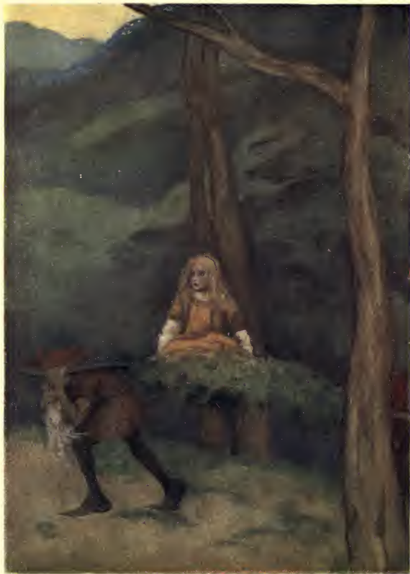
THEY CLIMBED A WINDING PATH ALONG THE WOODED SLOPE OF THE HILL