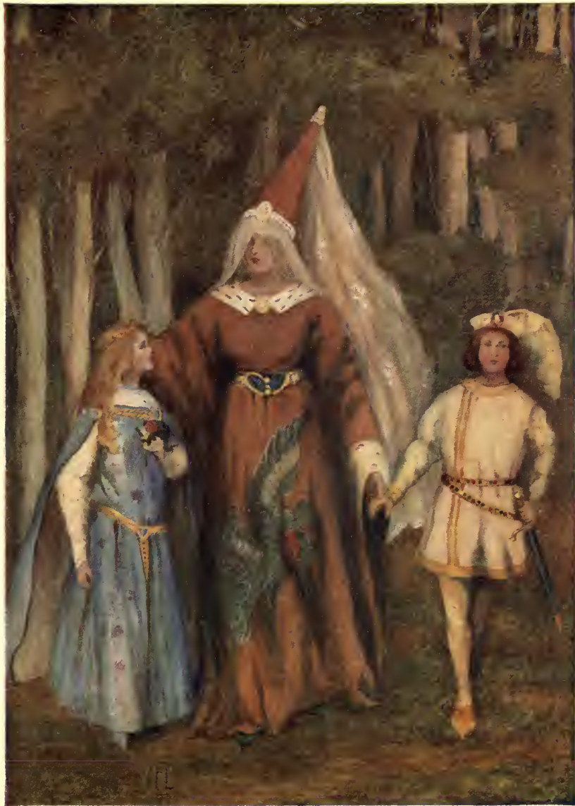
"LET US . . . WALK TO THE CHAPEL."