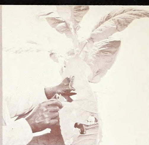
Hornworms on underside of a tobacco leaf

When applied according to directions, endrin and TDE—the recommended insecticides—can be used effectively, and will not reduce the value of the tobacco crop.