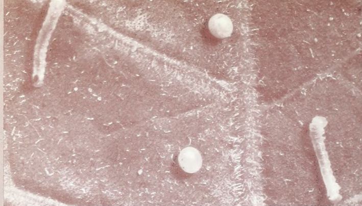
Eggs and newly hatched larvae of the tobacco hornworm

The pupal, or resting, stage usually lasts 2 to 4 weeks; then moths emerge from their pupal cases and make their way to the soil surface. The moths do not feed on tobacco leaves, but