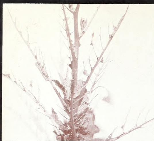
Portion of tobacco plant showing severe hornworm damage.

Do not use more insecticide than is recommended. To do so increases the hazard of leaving harmful residues on tobacco and creates an unnecessary expense.