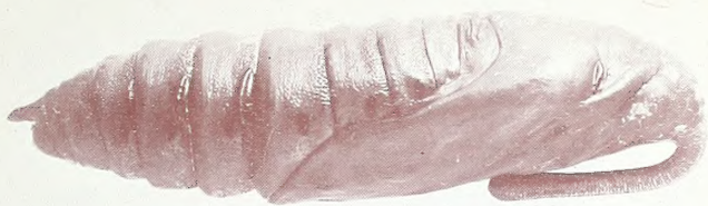
Pupa of the tobacco hornworm

If you dust, apply 1.5-percent endrin or 10-percent TDE dust at the rate of 8 to 15 pounds per acre for small plants, and 20 to 25 pounds per acre for large plants. Apply with hand or power equipment or by aircraft. If you use aircraft, apply 25 to 30 pounds of dust per acre.