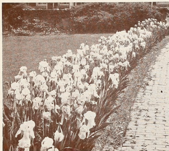
Border of Iris

This is our selection of the best of each color pattern. Many of them may be purchased at a considerable saving in a collection.