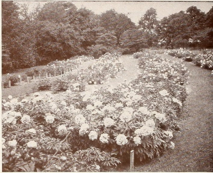
For sheer display peonies are supreme

6 CHOICE PEONY ROOTS for $7.50 (VALUE $9.50)