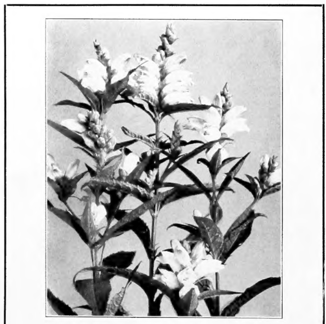
Chelone glabra , Turtlehead; Snakehead

Above plants, except as noted, are 25c each; 3 alike for 60c; 6 alike for $1.00. $2.00 per dozen of one kind.