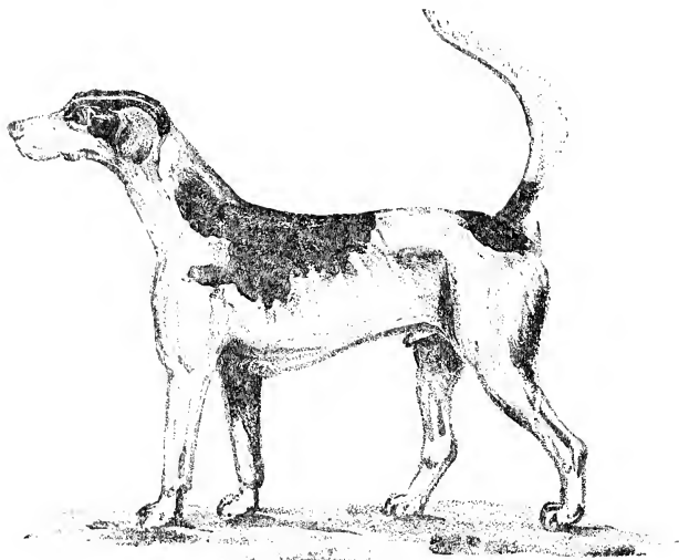
A PERFECT HOUND.

Foreleg .—Straight, with plenty of good bone