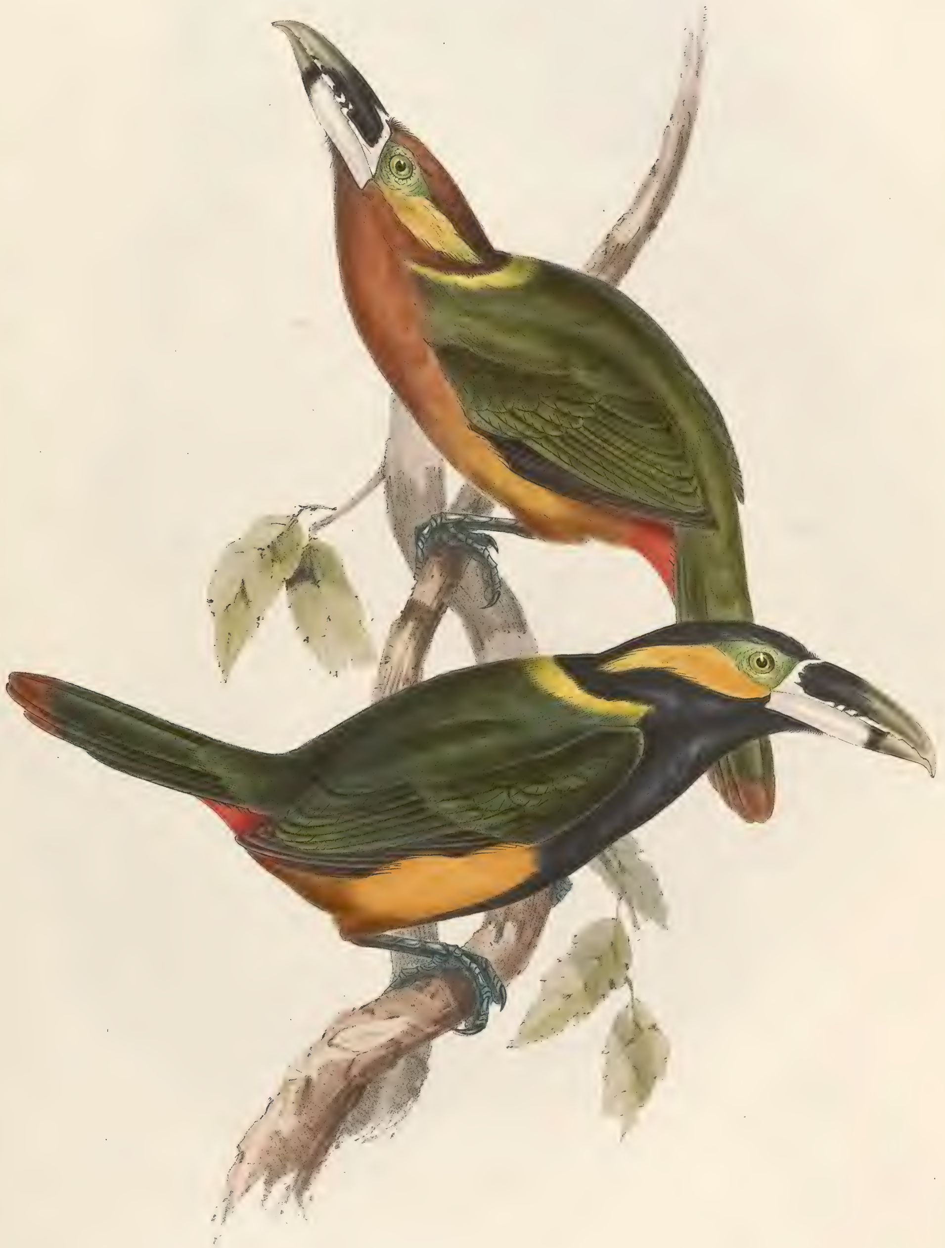
PTEROGLOSSUS ( SELENIDERA ) GOULDII, (Nutt.)