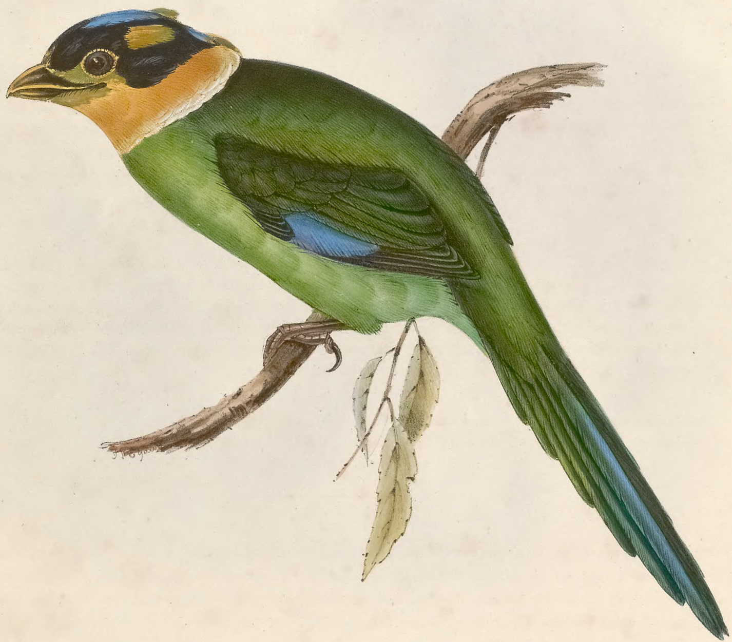
EURLAIMUS (CROSSODERA) DALHOUSIÆ. (Jameson).