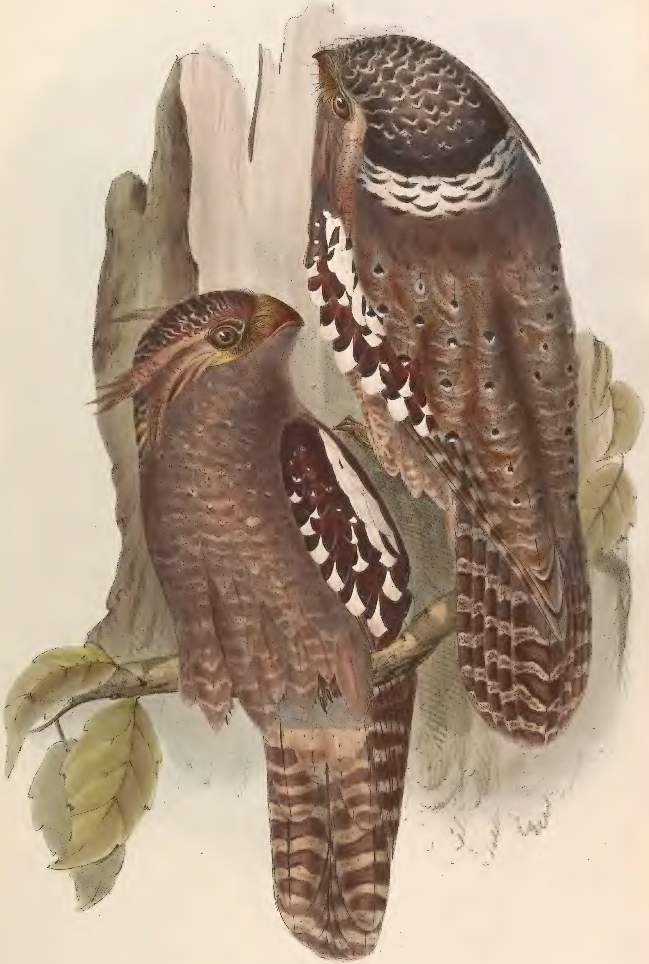
BATRACHOSTOMUS AURITUS; (Gould).