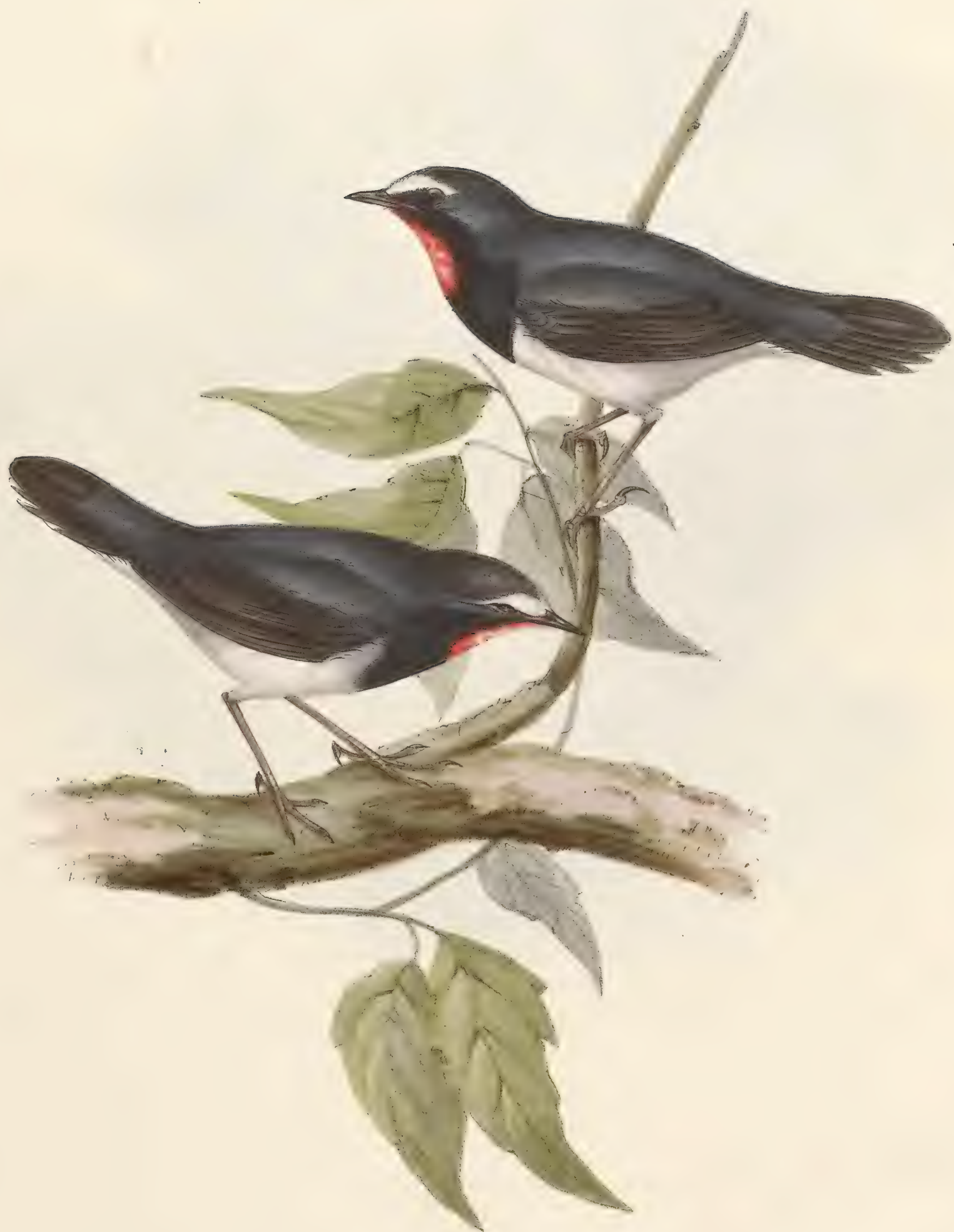
CALLIOPE PECTORALIS; (Gould).