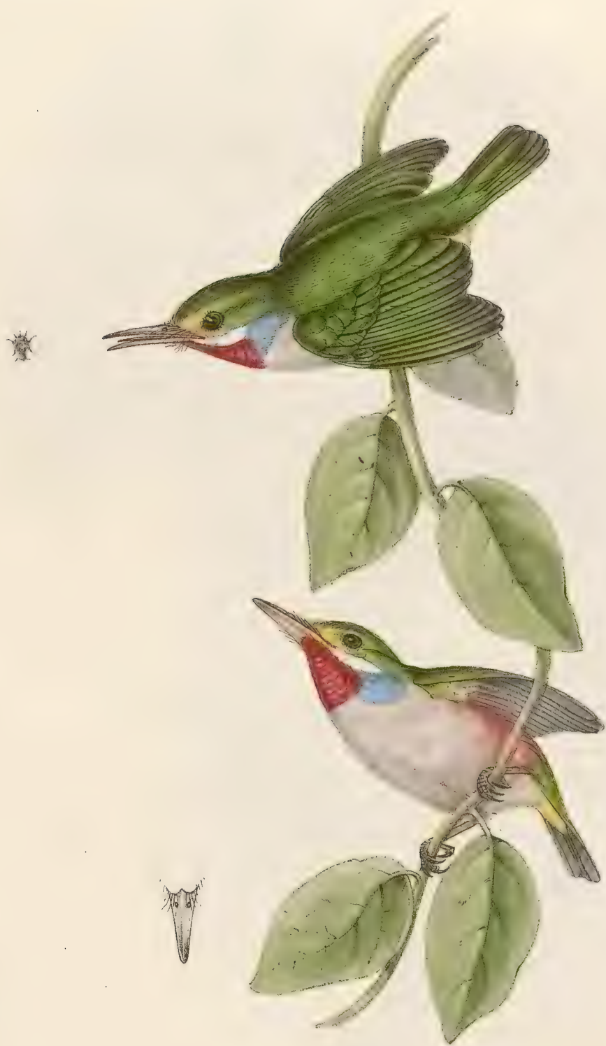
TODUS MULTICOLOR, (Gould).