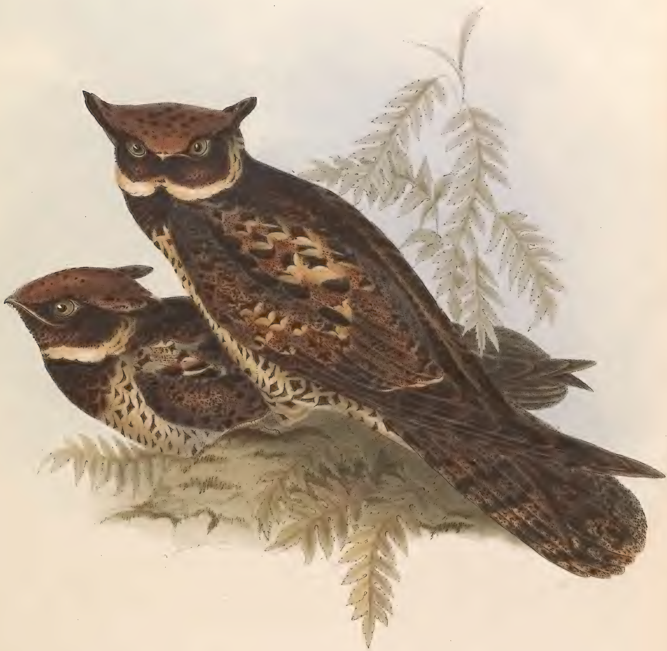
LYNCORNIS MACROTIS; (Gould).

Drawn from Nature & on Stone by J.E. Gould.