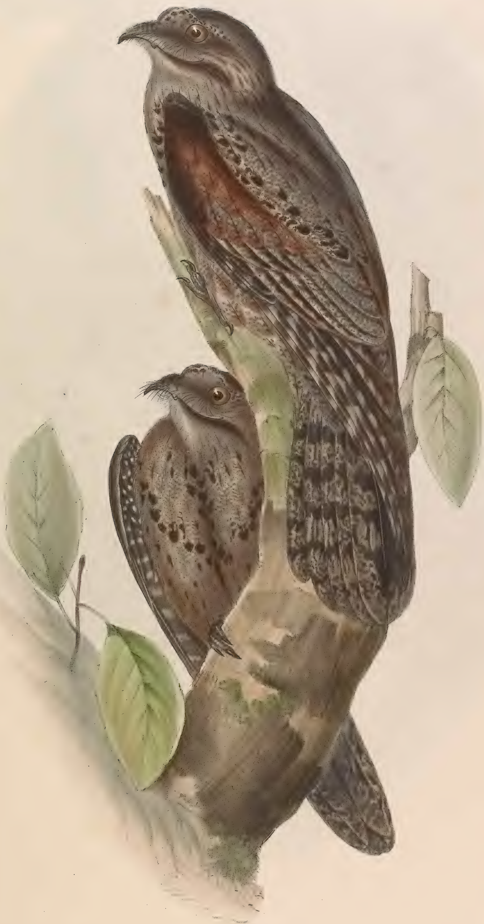
NYCTIBUS PECTORALIS, (Gould.)