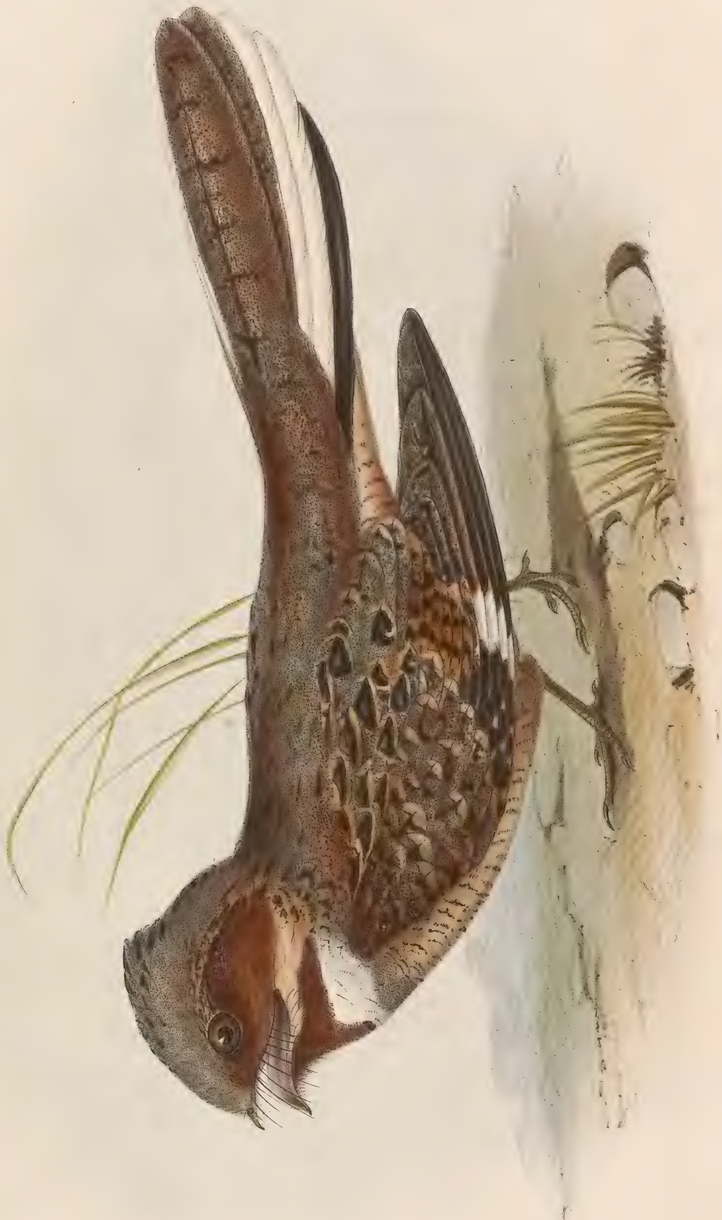
NUCTES BREVIANUS, (Gould.)