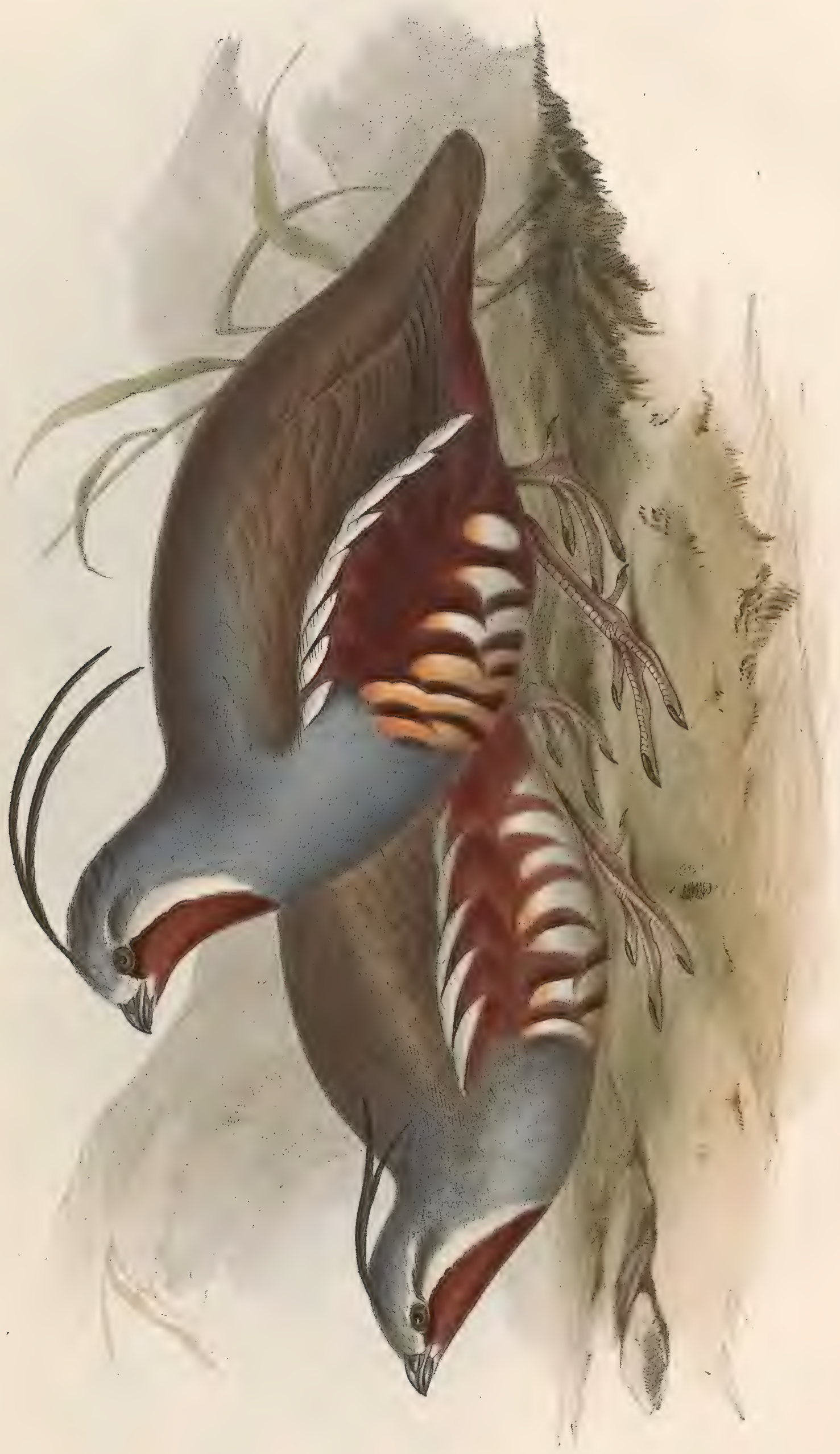
ORTYX PLUMIFERA, (Gould).