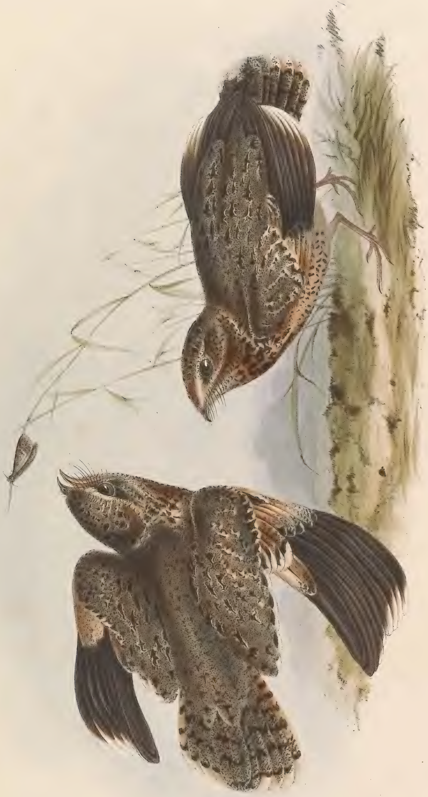
AMBLYPTERUS ANOMALUS; (Gould).

Drawn from Nature &c. Size by J. E. Gould