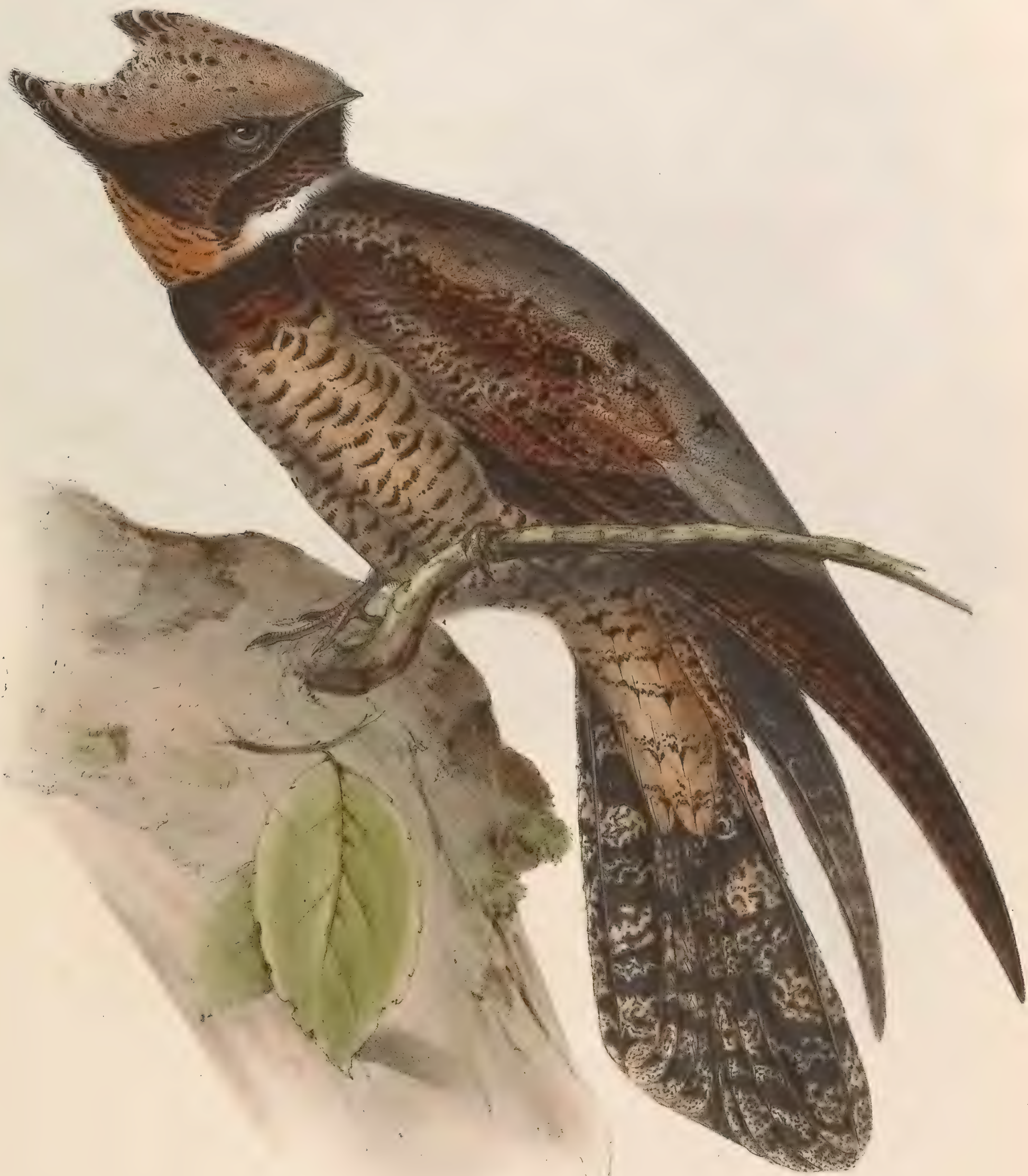
LYNCORIS CERVINUS, 1661