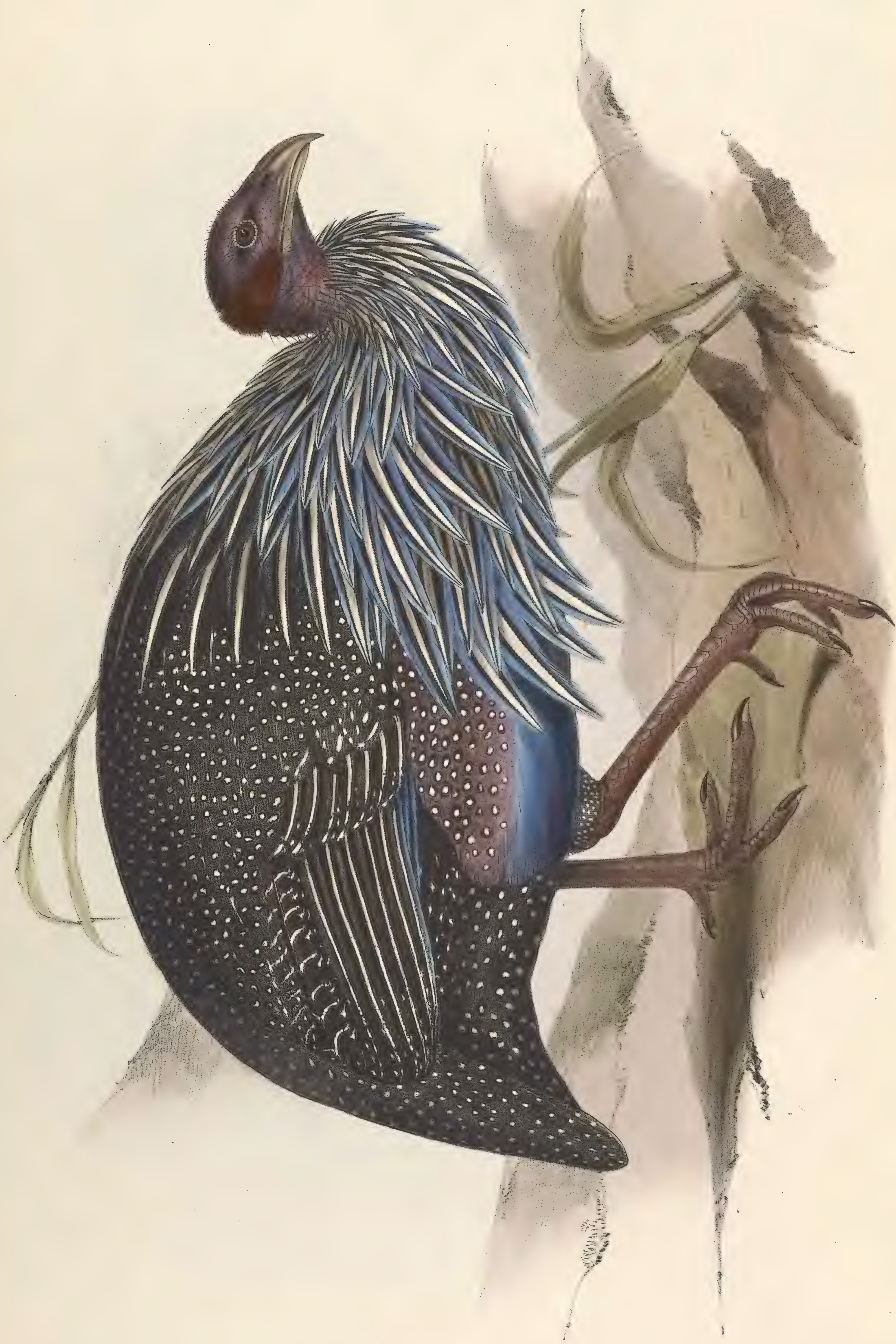
NUMIDA VULTURINA; (Haddon.)