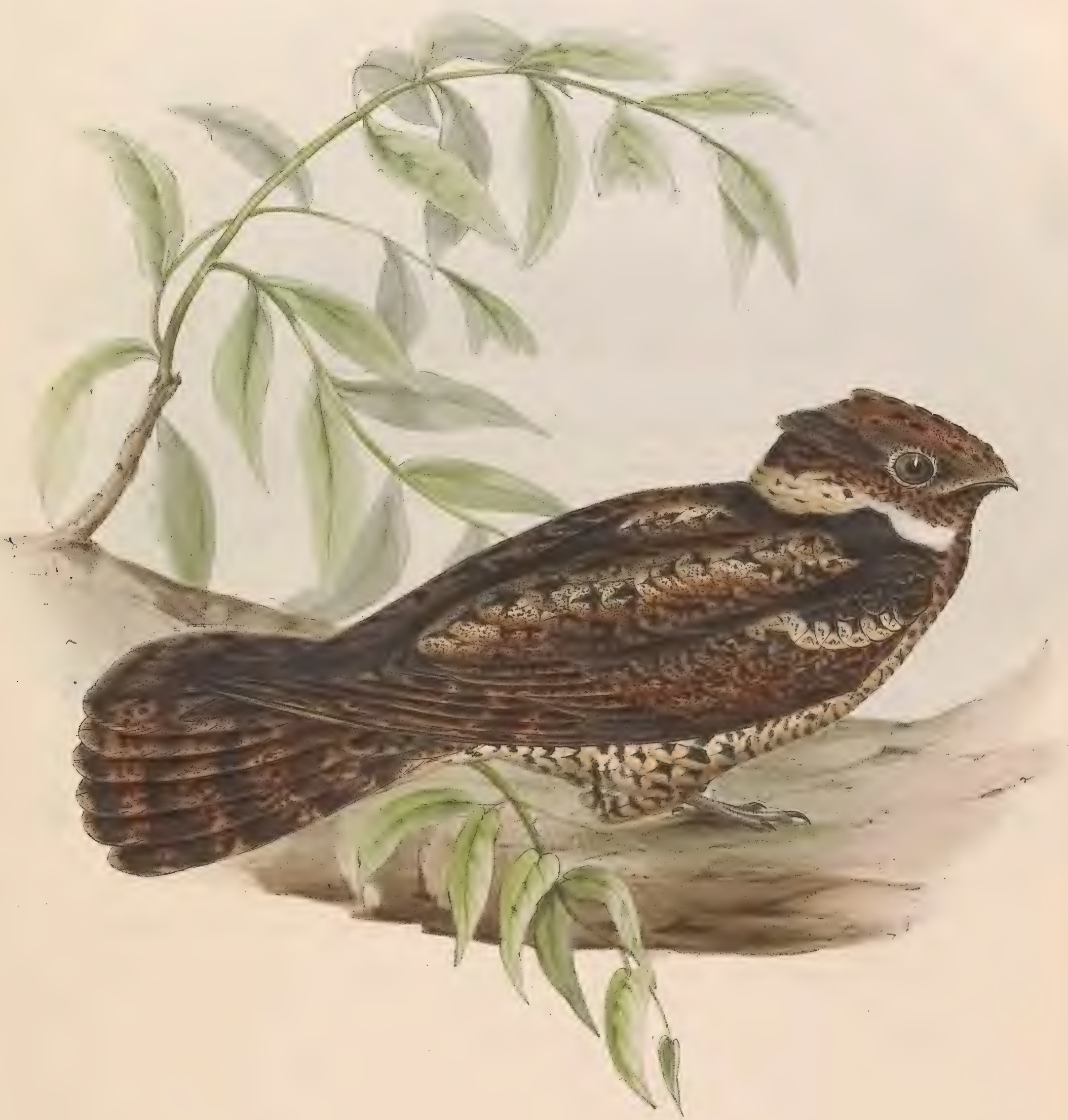
LYNCORNIS TEMMINCKII, (Gould).

Drawn from Nature & on Stone by J. E. Gould.