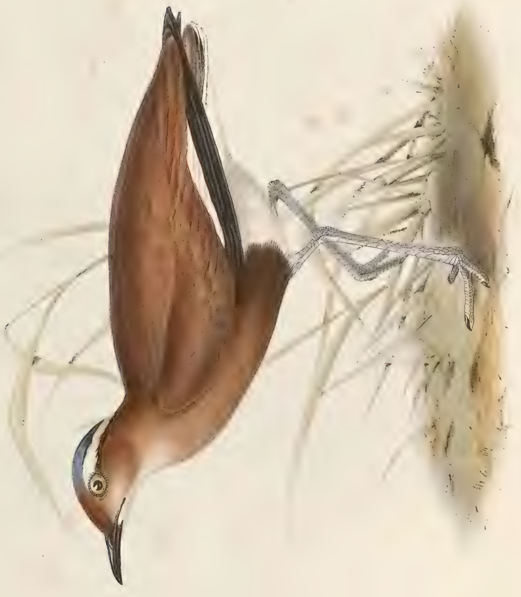
CURSUS RUTUS, (Gould.)