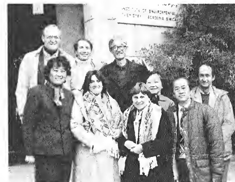
Outside the Institute of Environmental Chemistry

areas and back south. In addition to their work at Chinese research institutions, the group visited the Nanjing Botanical Garden, the South China Botanical Garden in Guangzhou, the Hangzhou Botanical Gardens, and, of course, the Great Wall.