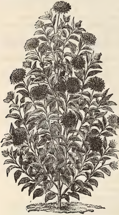
Helianthus multiflorus fl. pl.

H. rigidum. 4 feet. July and August. 25 cents each.