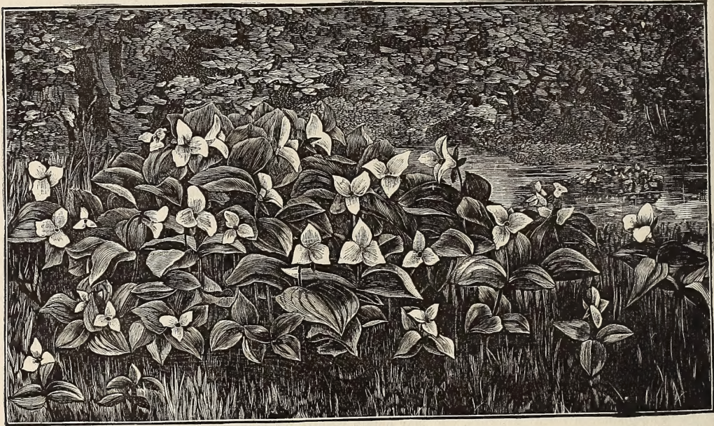
Bed of Trillium grandiflorum , in shade.

Nor do not forget that all these are of easy culture, and once obtained and reasonably used, will bloom each year in increasing beauty, and, instead of a yearly output of so much money for a repetition of this or that piece of flashy patchwork, you can obtain a permanent and lasting result of much greater beauty. The choice is whether you will have your garden occupied a third of the year by a few families of plants, not particularly distinguished for beauty, which may bloom well or not, and present as little variety as possible, or will you have your garden a home for a selection of the most varied and beautiful of Nature's floral productions, presenting a continual succession of lovely and ever-changing forms and colors during three-fourths of the year.