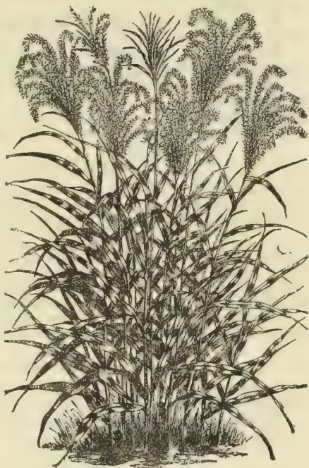
Eulalia Japonica var. Zebrina.

E. Japonica var. zebrina. [Zebra grass.] A most remarkable and handsome variegated form with the golden variegation in bands across the leaf at regular intervals, instead of longitudinal, as in the last case. Unique and very effective. 25 cents each.