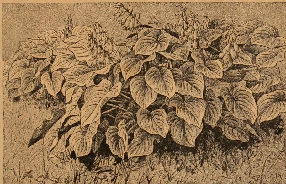
A GROUP OF PLANTAIN OR DAY LILIES.