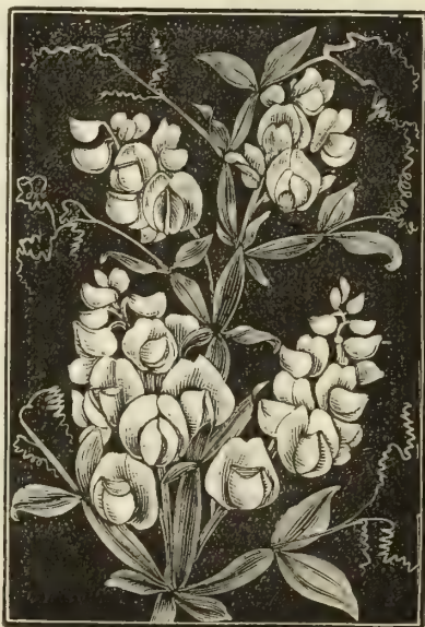
White Perennial Pea.

A class of very effective border plants, with long, dense spikes of attractive flowers in shades of rose, blue, and purple, suited to any common garden soil. All with narrow, linear, crowded foliage.