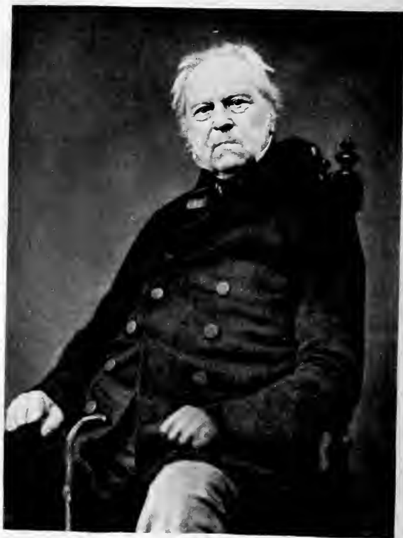
Walter Savage Landor. Abt. 65.